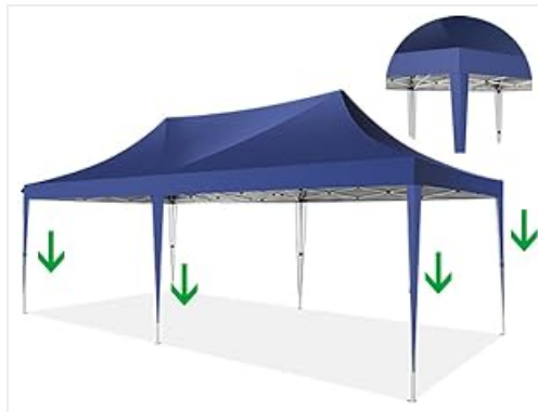
Figure 2: Securing the Canopy Foot Wrap

Once the frame is partially open, place the canopy cover over the top. Secure the cover to the frame using the integrated Velcro straps at each corner and along the frame bars. This ensures the cover is taut and prevents water accumulation.