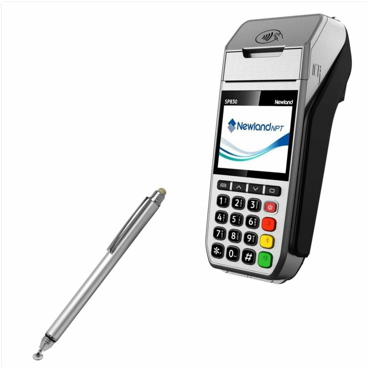
Image: The BoxWave DualTip Capacitive Stylus in metallic silver.