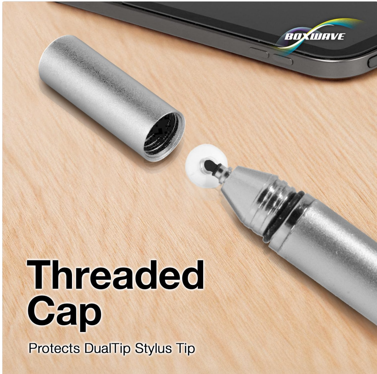
Image: The threaded cap protects the FineTouch clear disc tip.