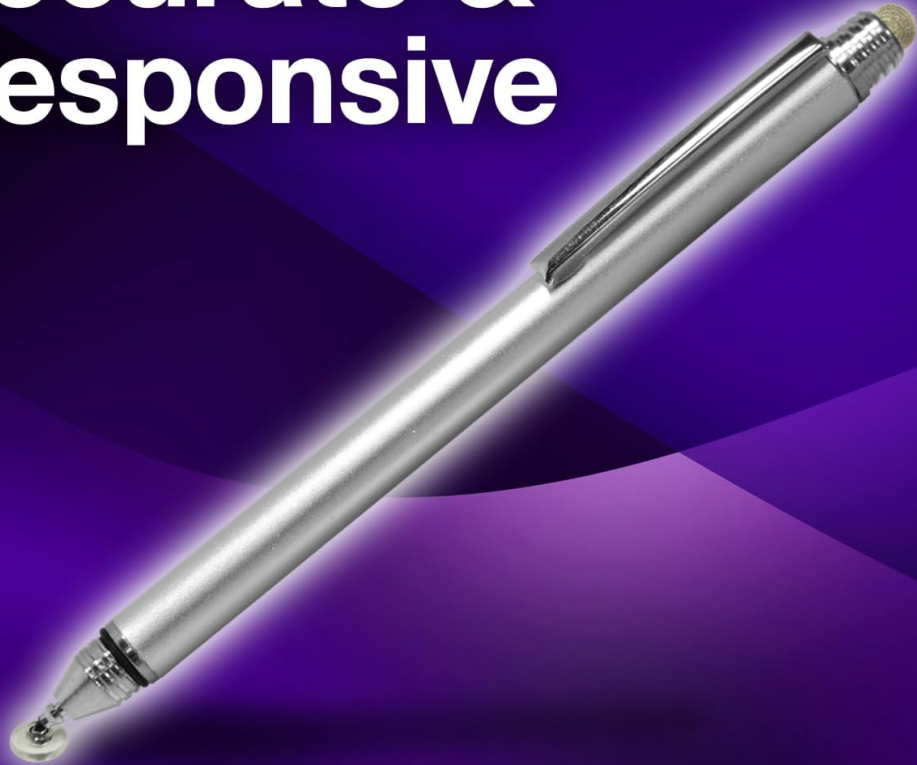
Image: The stylus is designed for ultra-accurate and responsive performance.