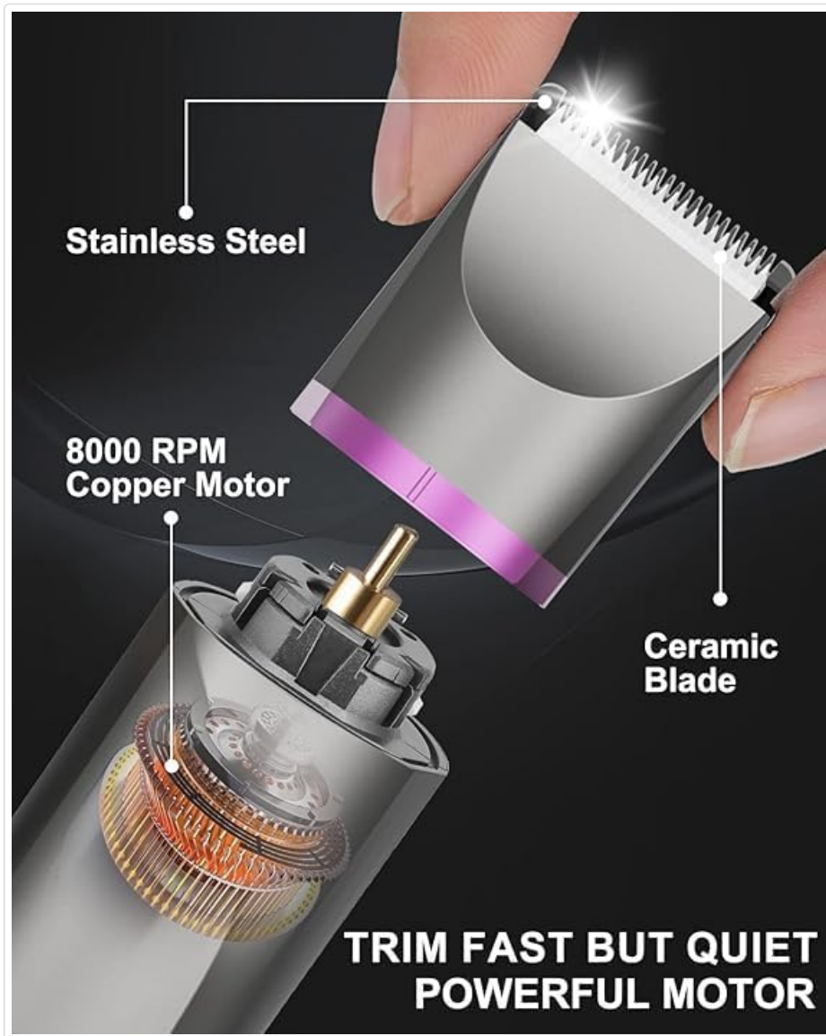
Image: An exploded view highlighting the internal components of the trimmer head, including the stainless steel and ceramic blades, and the 8000 RPM copper motor, emphasizing its powerful yet quiet operation.

sized guard combs and the detail trimmer attachment.