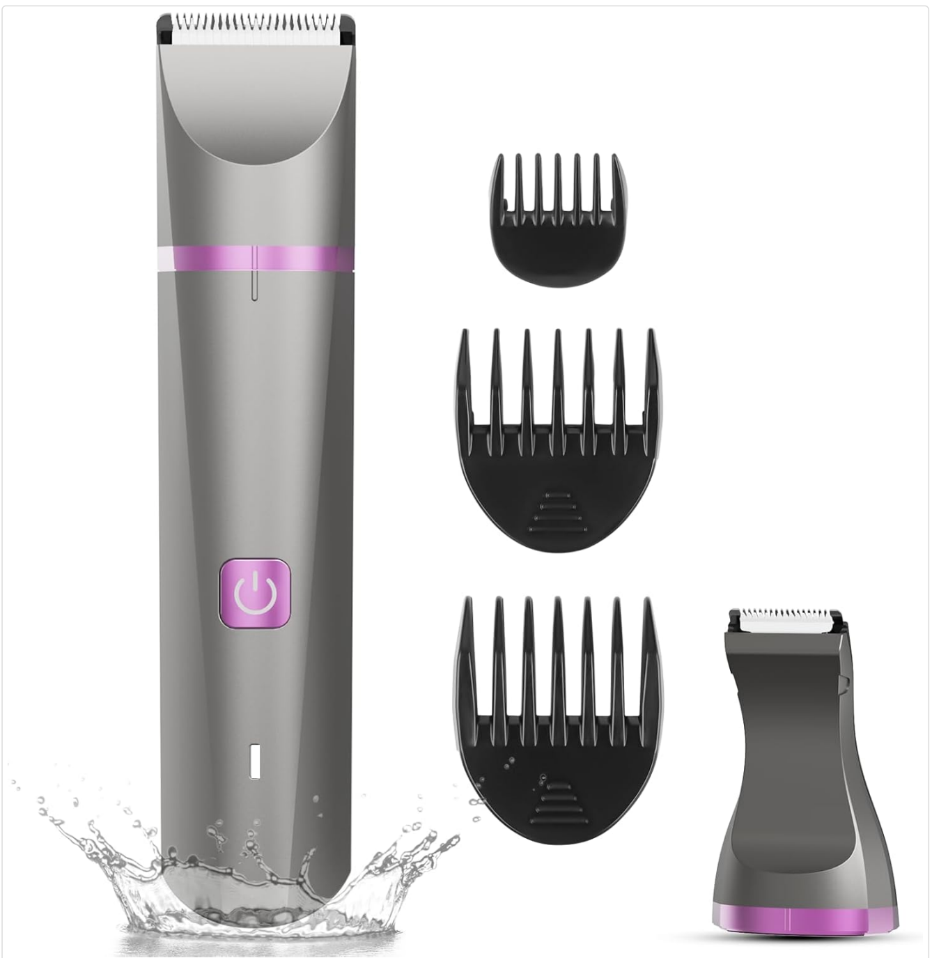
Image: The main trimmer unit, showing its waterproof capability with water splashing around the base, along with the three different