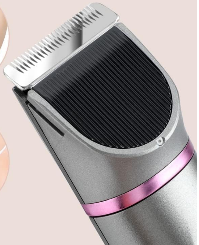
Image: A visual guide demonstrating the application of the trimmer for various body parts, including face, sideburns, legs, arms, armpits, and the bikini area, highlighting the versatility of the body hair trimmer and cutlass detail trimmer.