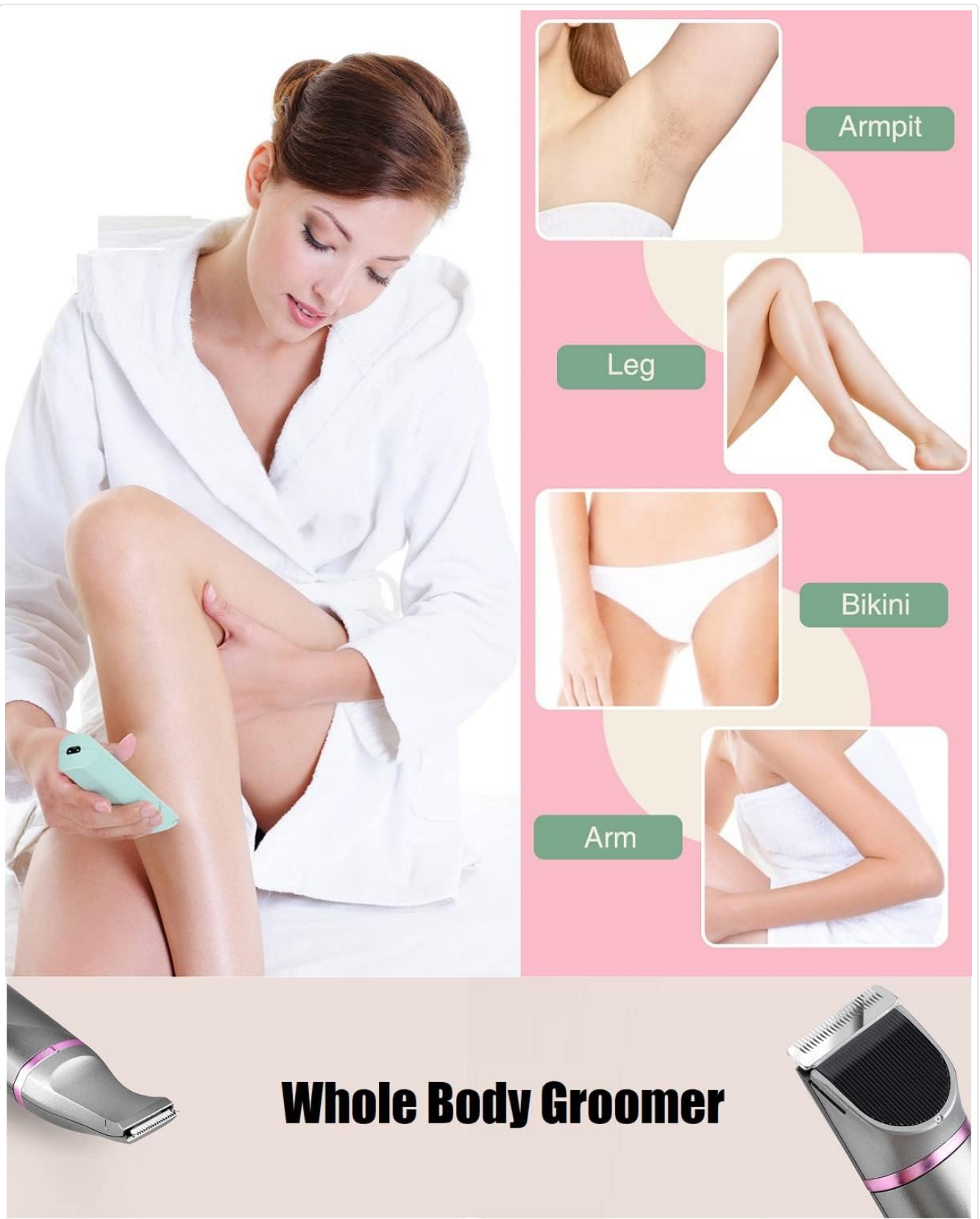
Image: A woman demonstrating the use of the trimmer on her leg, accompanied by inset images illustrating its effectiveness for armpit, leg, bikini, and arm areas, promoting it as a whole body groomer.