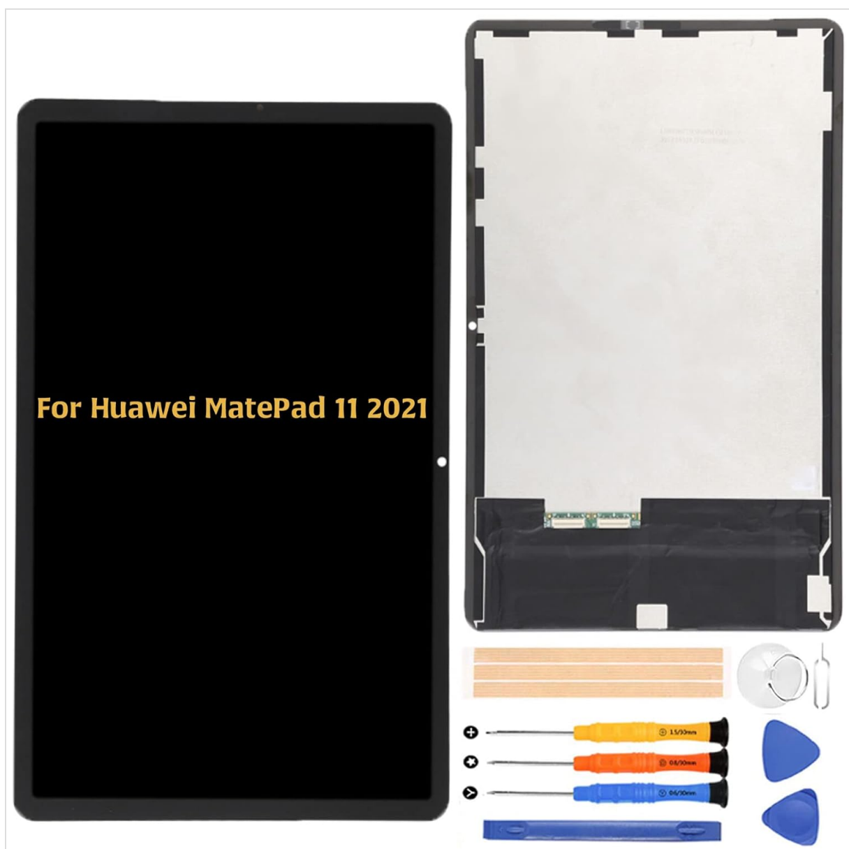
Image: A-MIND LCD Touch Digitizer Assembly for Huawei MatePad 11 2021, shown alongside the complimentary repair tool kit.