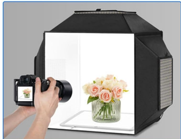
Match with light box