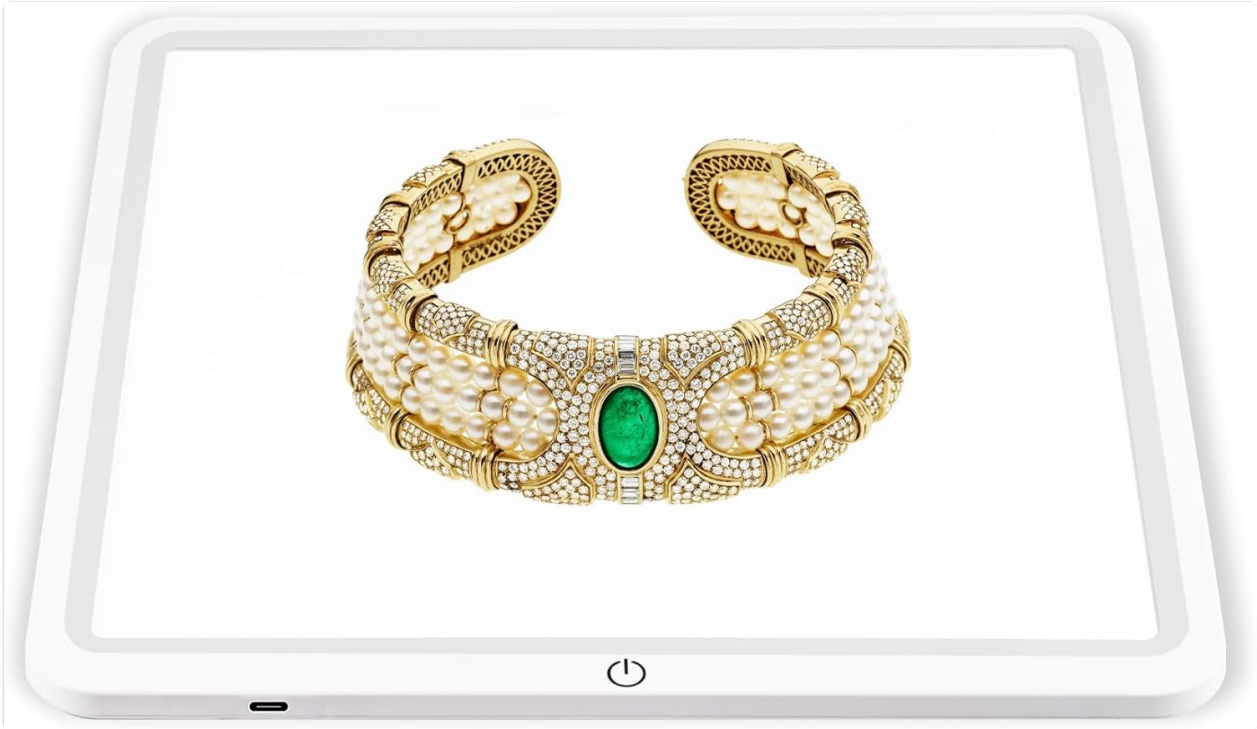
Image 2.1: Contents of the product package, showing the Shadowless Light Panel and its Type-C USB cable.