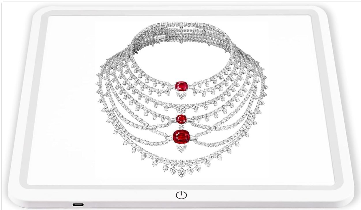
Image 1.1: The Selens Shadowless Bottom Light Panel, showcasing its illuminated surface with a jewelry item.

The Selens Shadowless Bottom Light Panel is designed to provide diffused and even illumination for product photography, eliminating shadows and reflections. This ultra-thin LED panel is suitable for various small products such as jewelry, cosmetics, and crafts, enhancing the clarity and quality of your photographs. This manual provides essential information for the proper setup, operation, and maintenance of your Shadowless Bottom Light Panel.