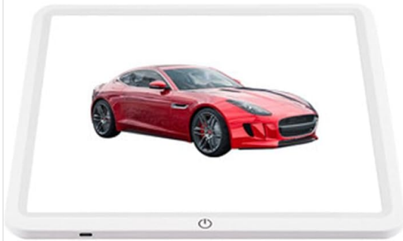
Shadowless bottom light