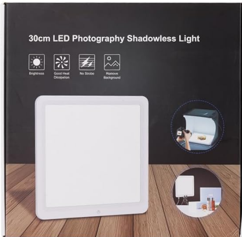
Package x 1