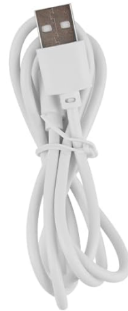
Type C Cable x 1