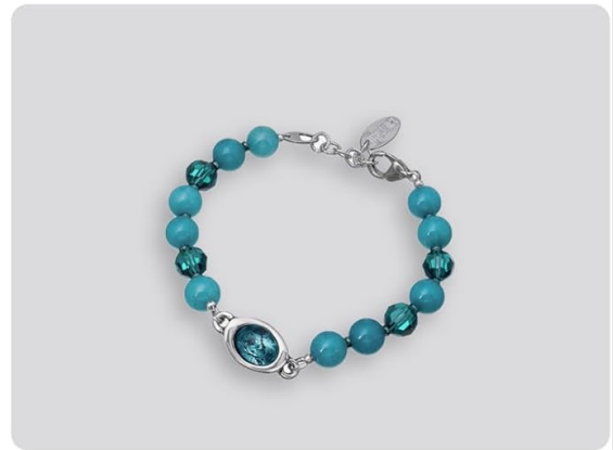
With Shadowless Light