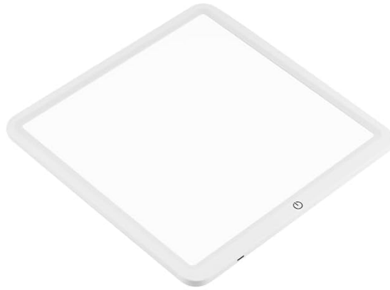
Shadowless Light x 1