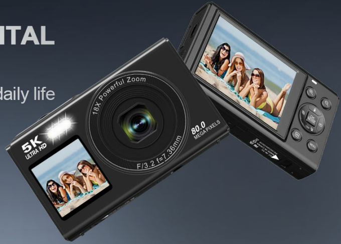
Image: The camera's screen showing the 5K UHD video recording feature, indicating its high-resolution video capabilities.