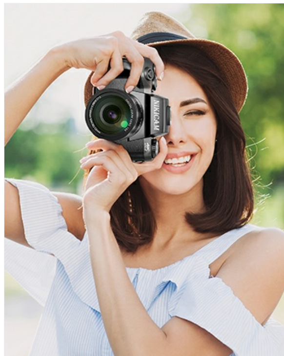
Image: A user holding the NIKICAM K8 camera, highlighting its compact design and user-friendly interface for photography.