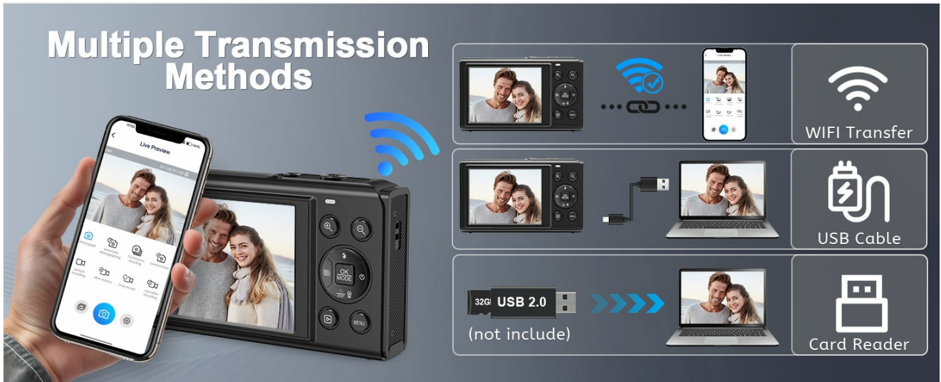
Image: A detailed diagram illustrating the layout and functions of the NIKICAM K8 Digital Camera's buttons and features.

Familiarize yourself with the camera's buttons and their respective functions: