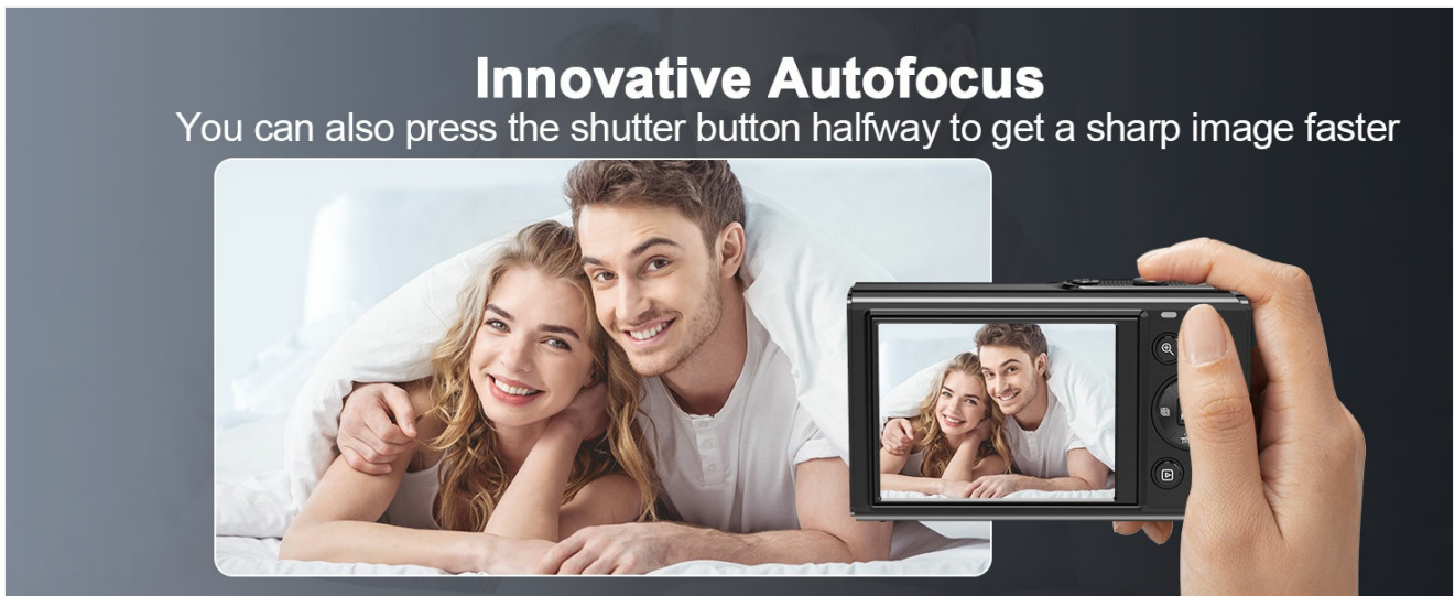
Image: Examples of camera features in use, including autofocus, built-in flash, smile capture, pause function, and playback mode.