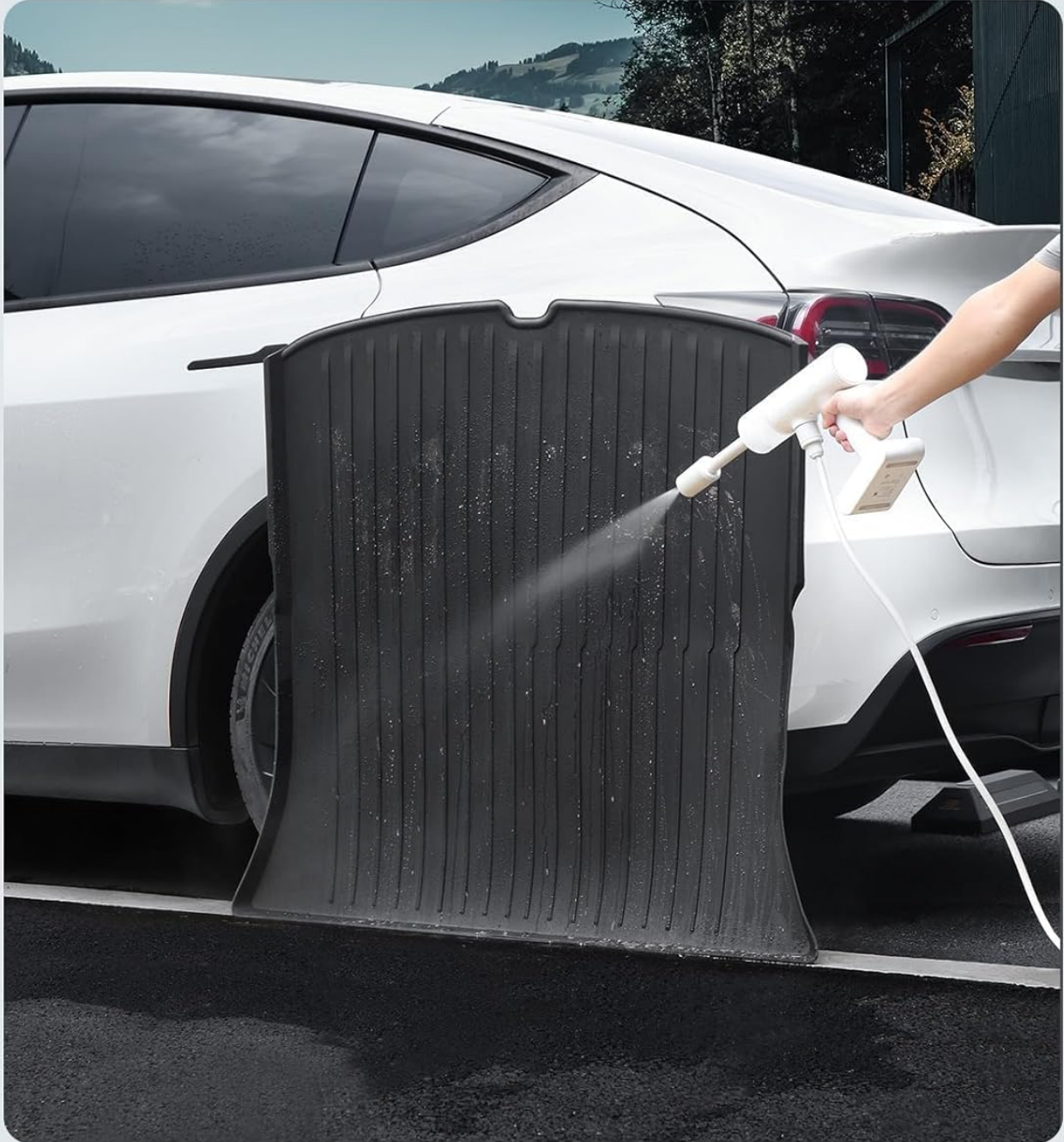
Image: Visual representation of the cargo liner's all-weather protection, scratch resistance, and durability against deformation.