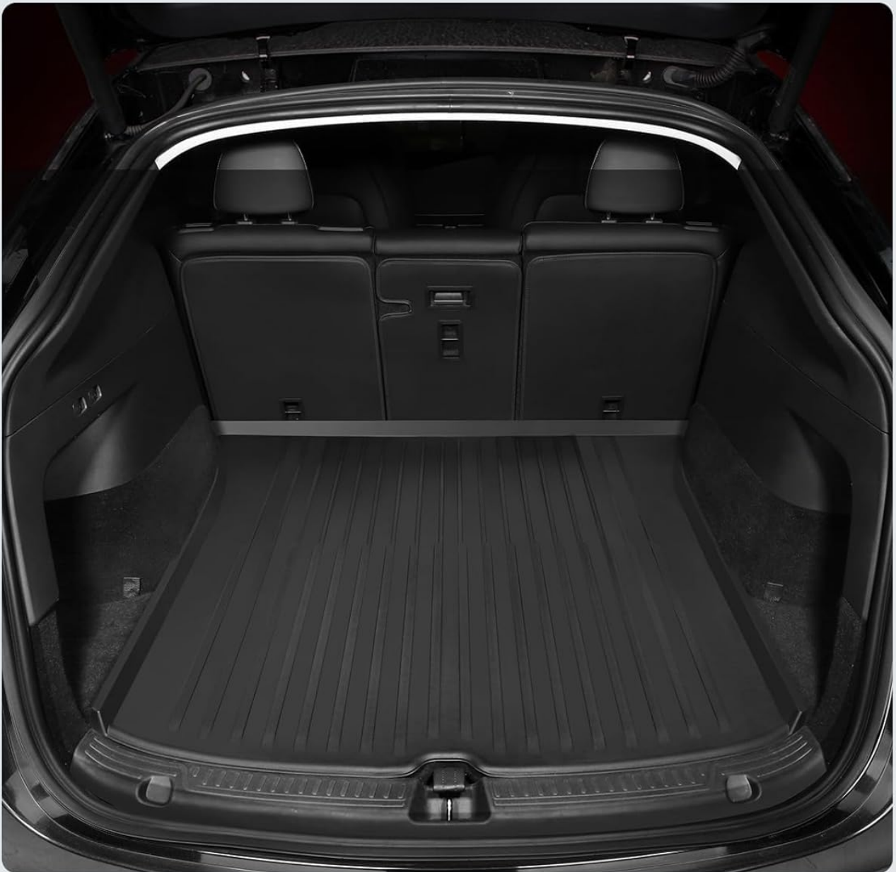
Image: The BASENOR cargo liner correctly installed in the rear trunk of a Tesla Model Y.