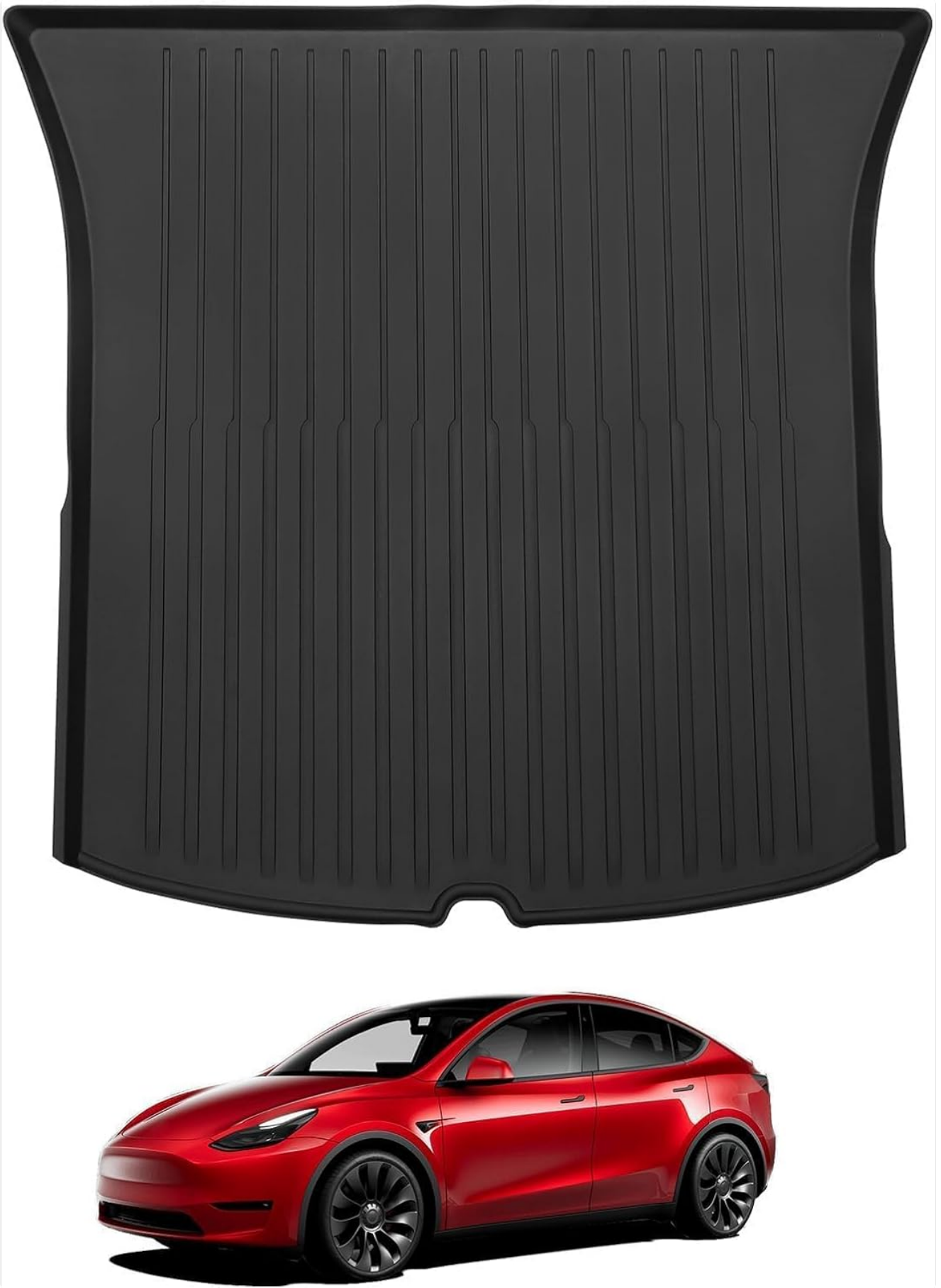
Image: The BASENOR TPE Rear Cargo Liner, showcasing its custom shape and textured surface.