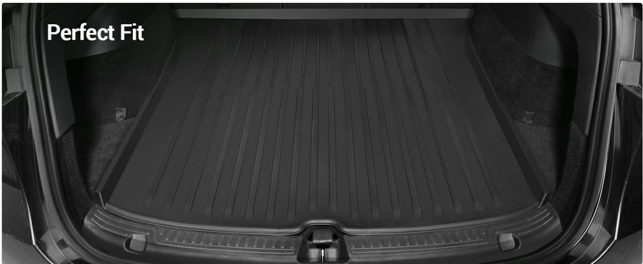
Image: A comparison showing the trunk floor before and after the installation of the BASENOR cargo liner, highlighting cleanliness and protection.