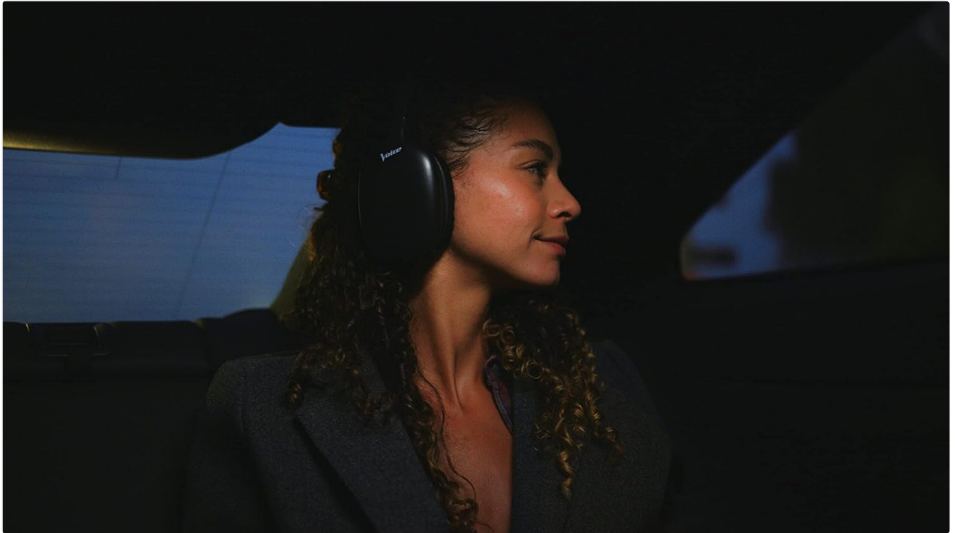
Figure 5: User enjoying audio with the headphones, highlighting comfort and usability.

Video 1: Demonstrates the adjustable and padded comfort, built-in mic, and connectivity to Google or Siri for The Voice Hollywood Wireless Headphones.