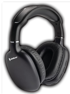
Figure 2: Front view of the headphones.

The Hollywood Wireless Headphones feature an ergonomic design for extended comfort and intuitive controls for ease of use. The over-ear cups provide a comfortable fit, and the adjustable headband ensures a secure fit for various head sizes. The tri-fold design allows for compact storage and portability.