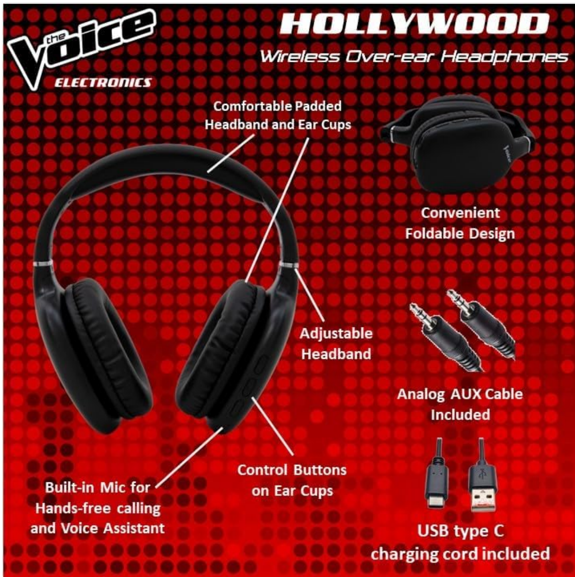
Figure 1: Included components and key features of the headphones.