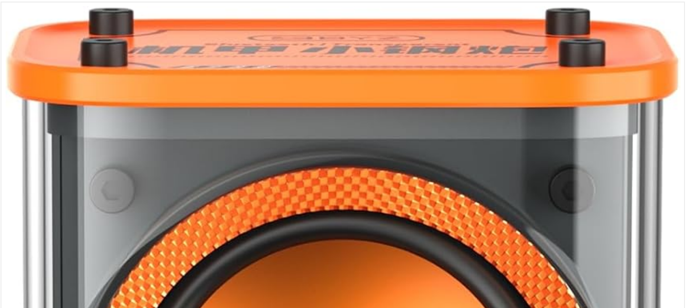
Figure 2: Internal structure and transparent shell design.