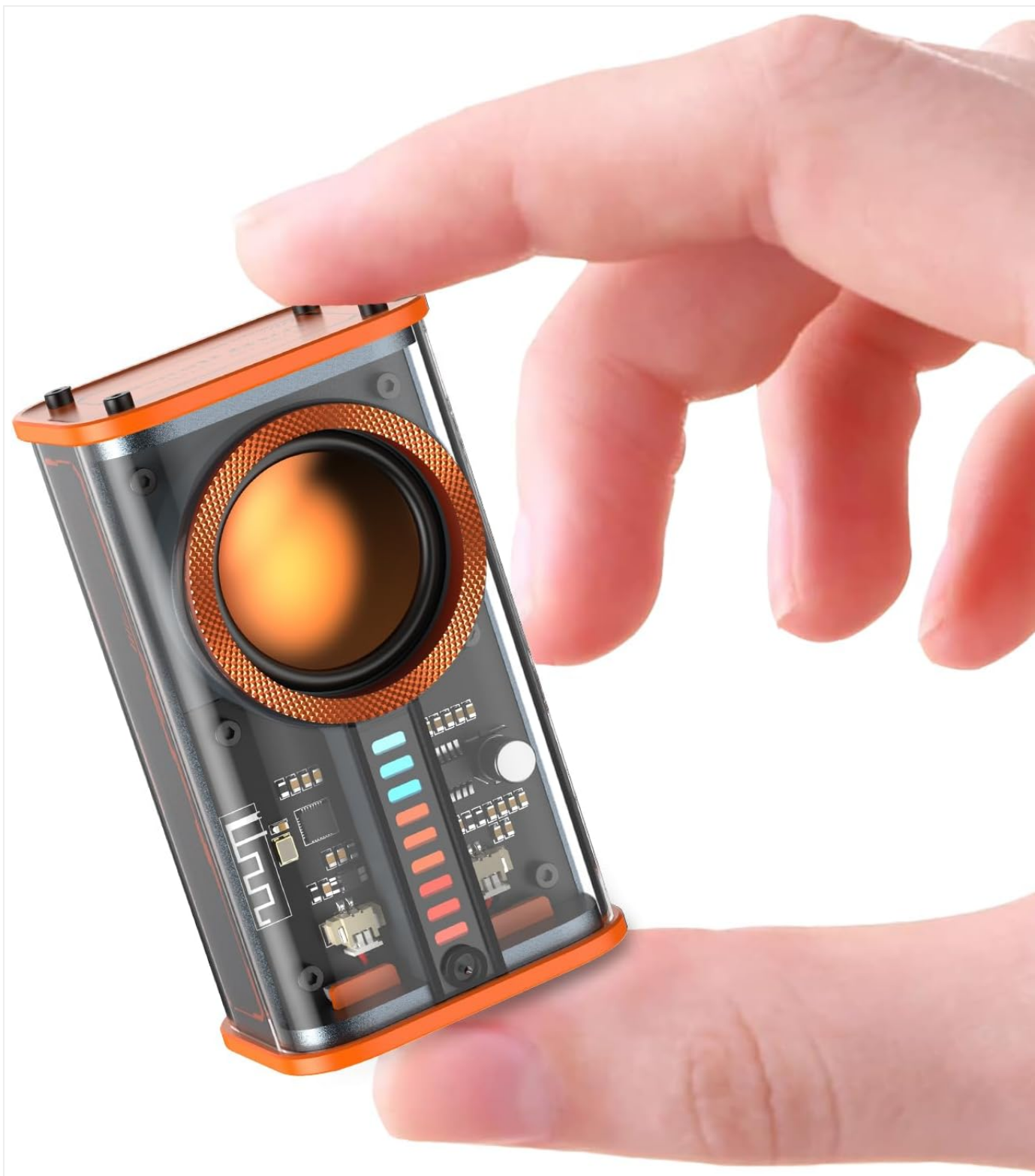
Figure 1: Compact design of the BSZHI Mini Transparent Wireless Bluetooth Speaker.