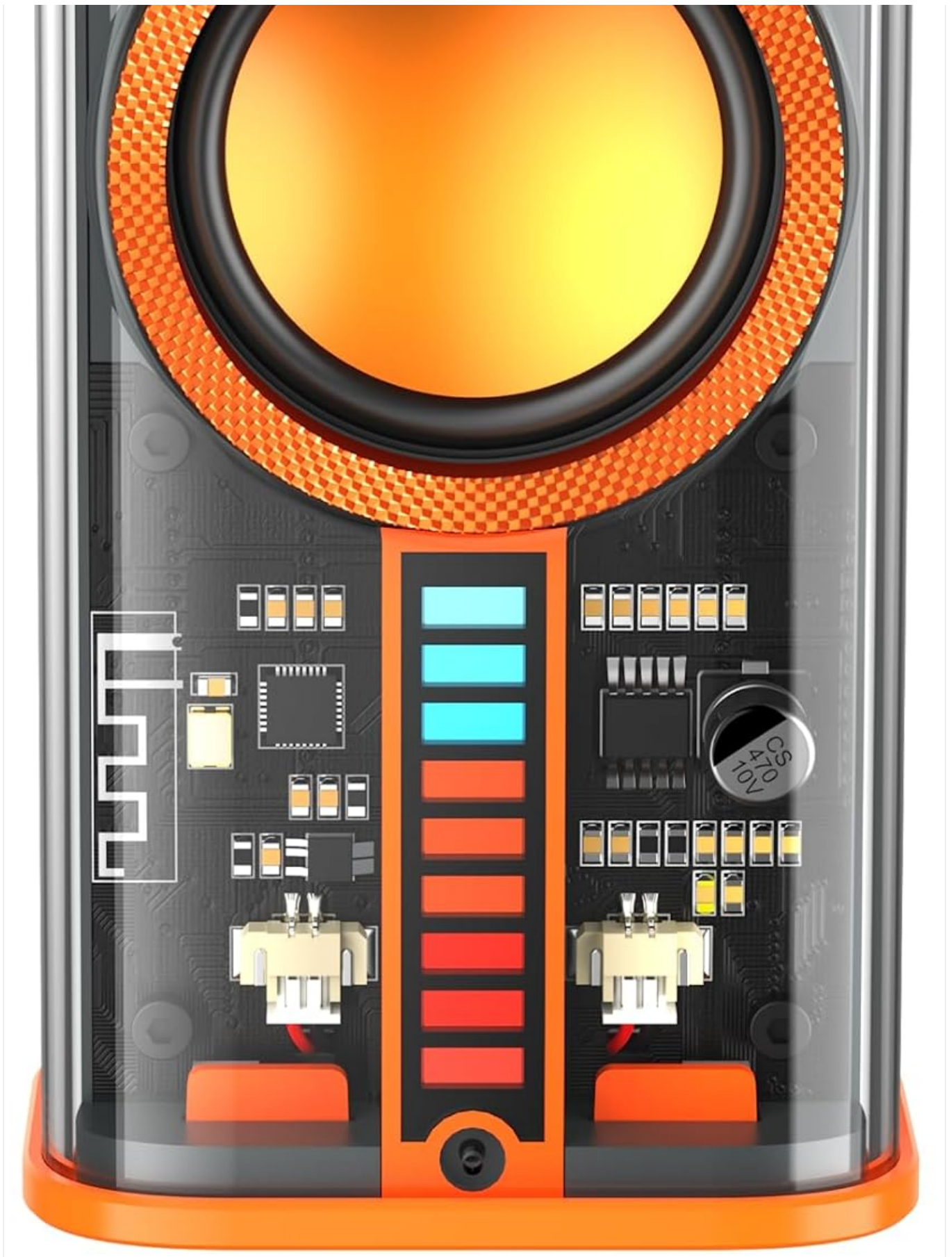
Figure 3: Detailed view of the speaker's front panel and internal components.