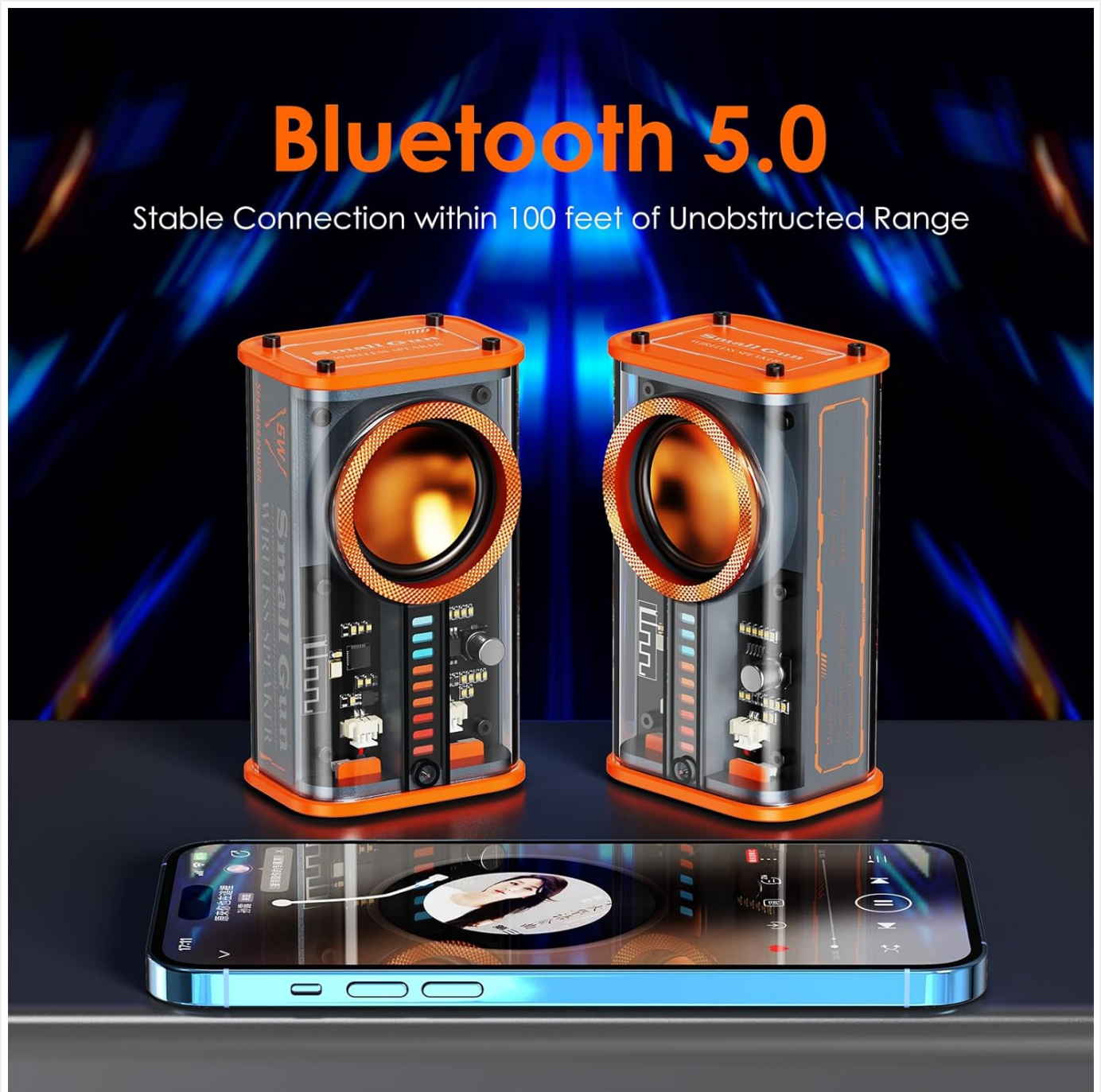
Figure 5: Bluetooth 5.0 connectivity for stable audio streaming.