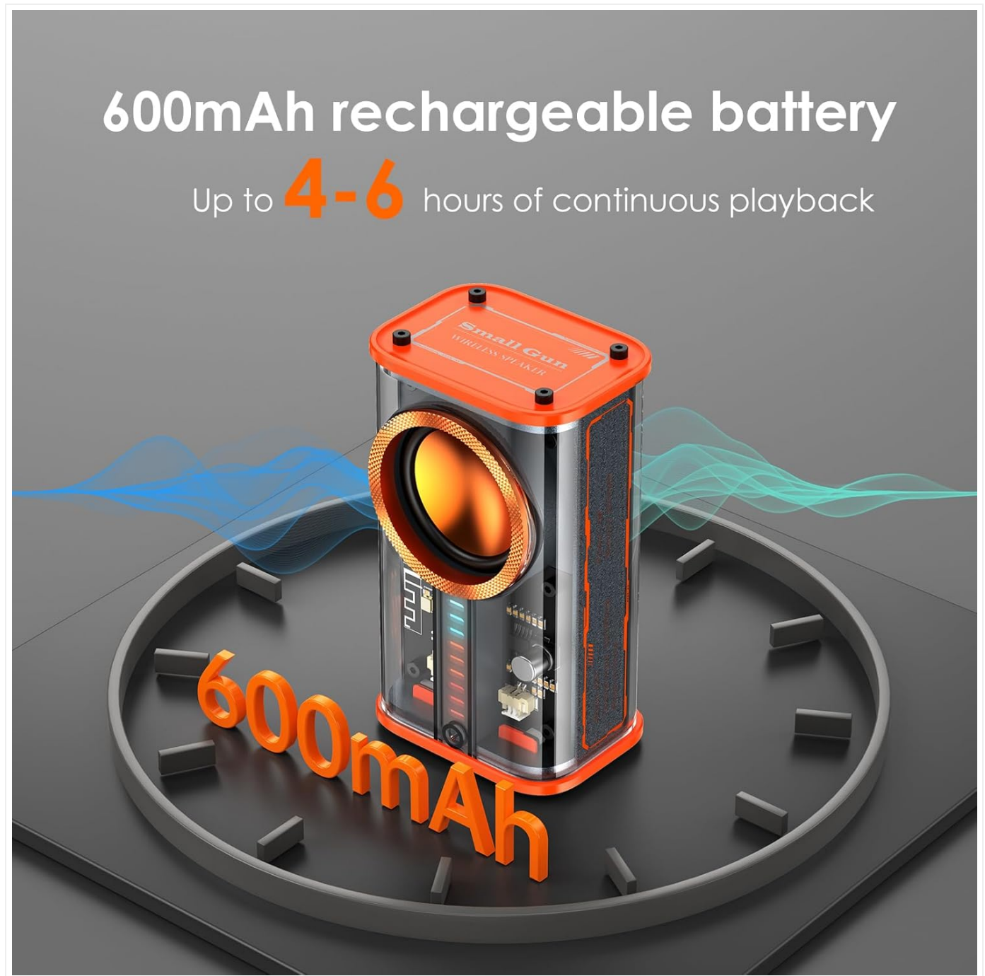
Figure 4: Battery capacity and estimated playback time.