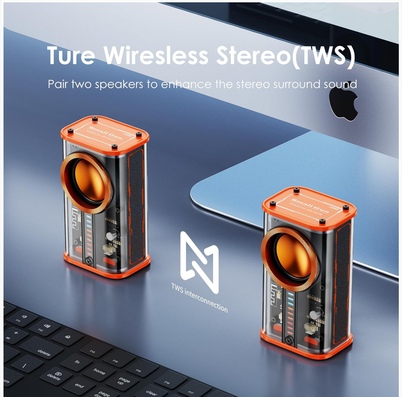
Figure 6: TWS pairing for enhanced stereo sound.