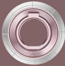
SYNCWIRE N55 Strong Magnets

The magnetic strength is up to 50N with metal ring adapter