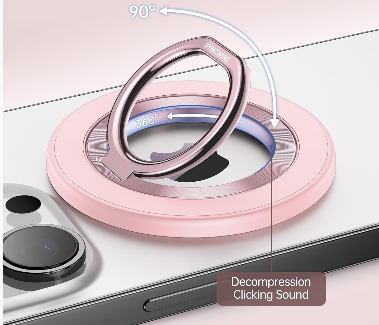
Image: A smartphone with the Syncwire ring holder demonstrating its flexible 360° rotation and 90° flip capabilities, along with a 'Decompression Clicking Sound' feature.