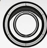
Others N52 Normal Magnets

Image: A visual comparison highlighting the superior magnetic strength of the Syncwire N55 Strong Magnets versus N52 Normal Magnets, with a phone securely attached to the ring holder.