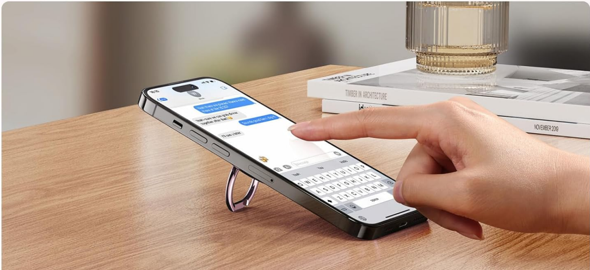
Image: A smartphone is shown with the ring holder extended, functioning as a stable kickstand for both horizontal and vertical viewing on a desk.