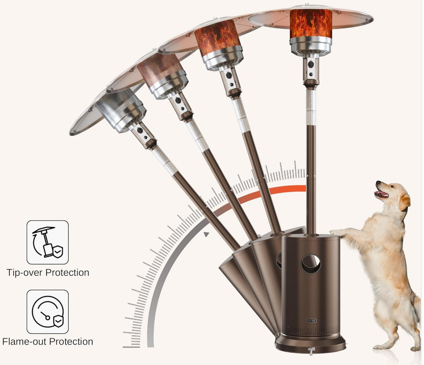
Figure 2: Illustration of the Tip-over Protection System, showing the heater automatically shutting off when tilted.