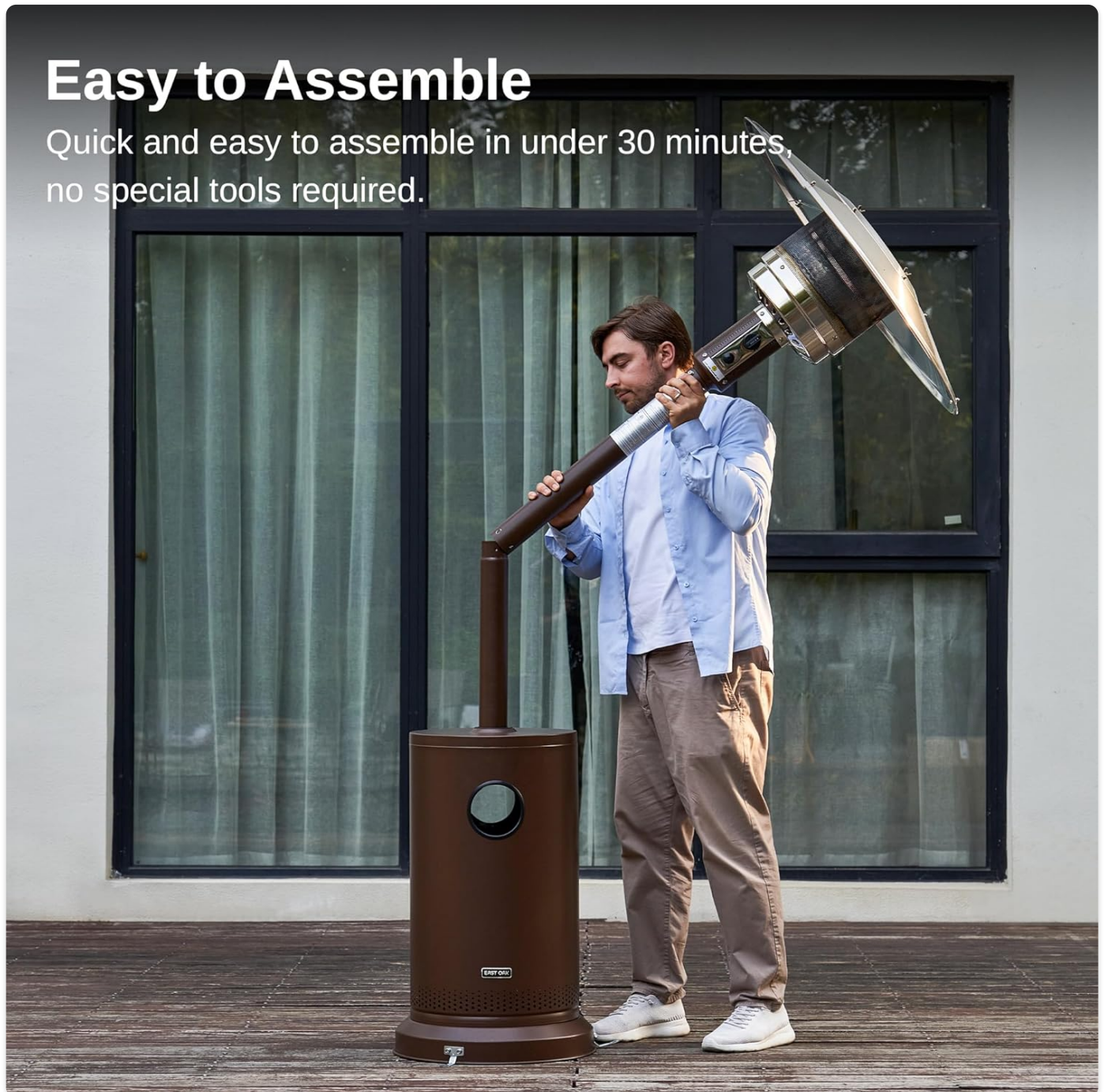
Figure 4: Assembly process showing a person attaching the main pole to the base.

Your browser does not support the video tag.