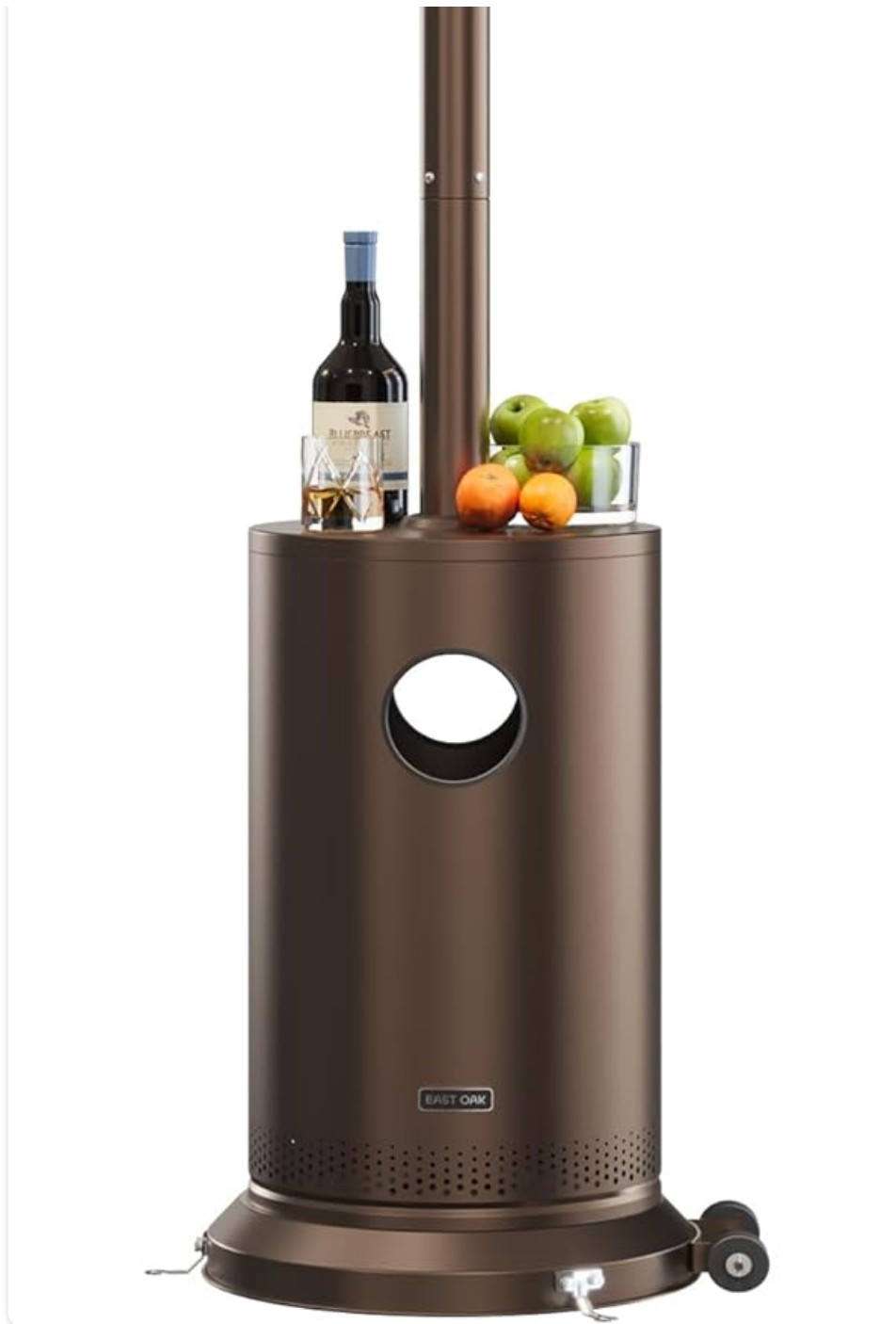
Figure 1: Overview of the EAST OAK 50,000 BTU Patio Heater in bronze finish.