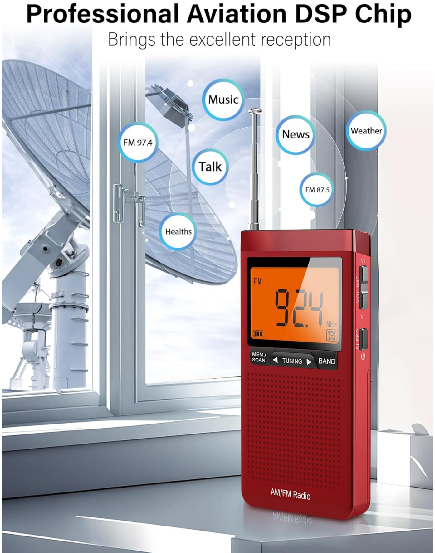
Figure 4: Front panel controls and LCD screen. This image shows the front of the red radio, clearly displaying the large LCD screen with a frequency reading (e.g., 92.4 MHz), and the control buttons below it, including MEM./SCAN, TUNING arrows, and BAND.