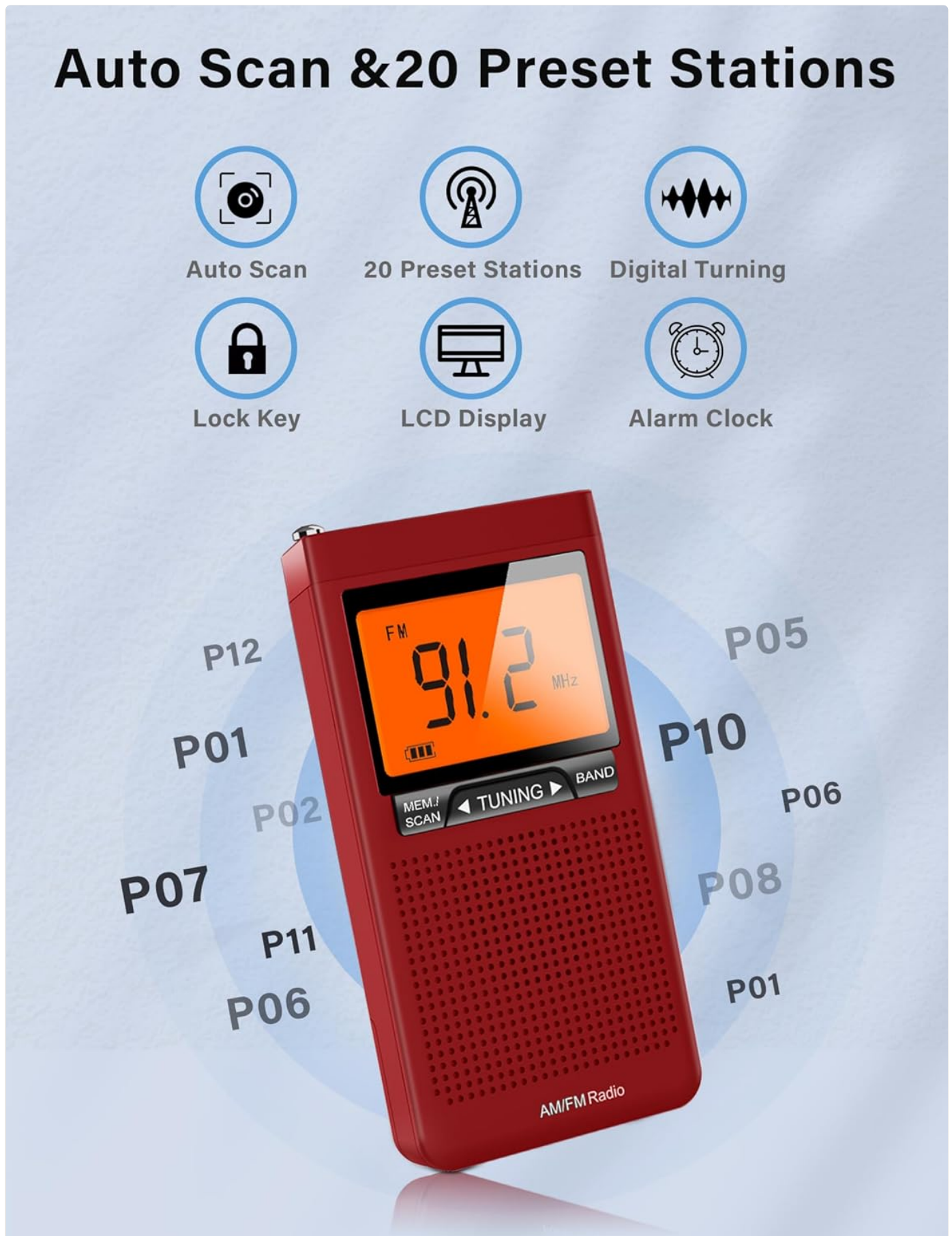
Figure 5: Auto Scan and Preset Stations. This image visually represents the radio's ability to auto-scan and store up to 20 preset stations,