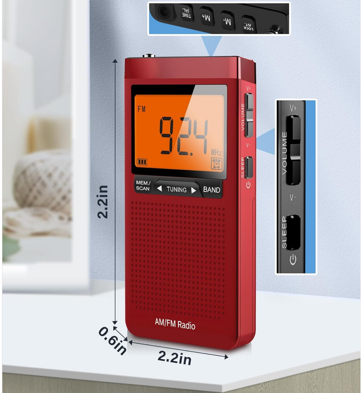
Figure 3: Side controls for volume and power. This image provides a close-up of the right side of the red radio, highlighting the 'VOLUME V+' and 'V-' buttons, and the 'SLEEP' and power switch.