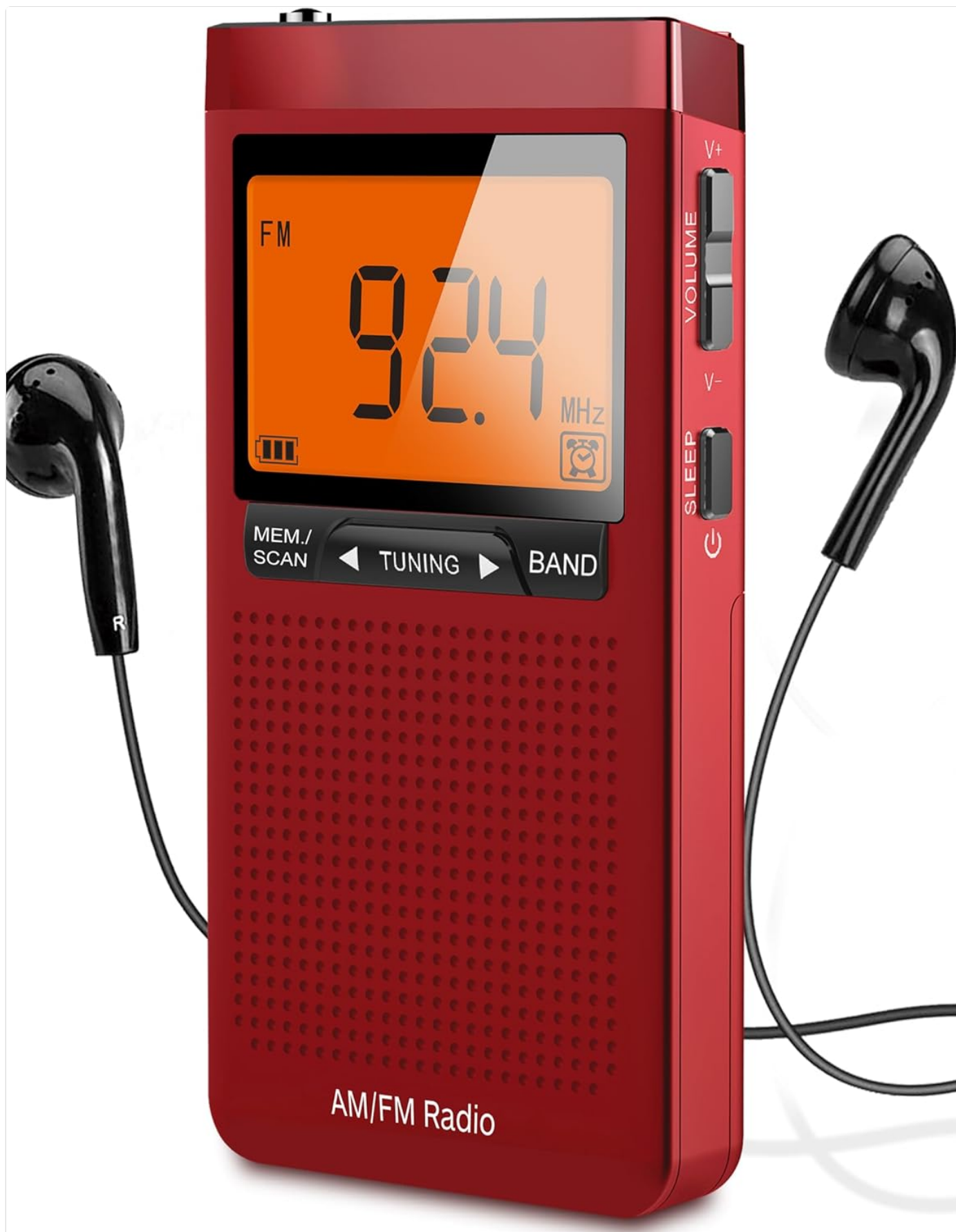
Figure 2: Radio with earphones connected. The image displays the red portable radio with the included black stereo earphones plugged into the 3.5mm jack on the top, ready for use.