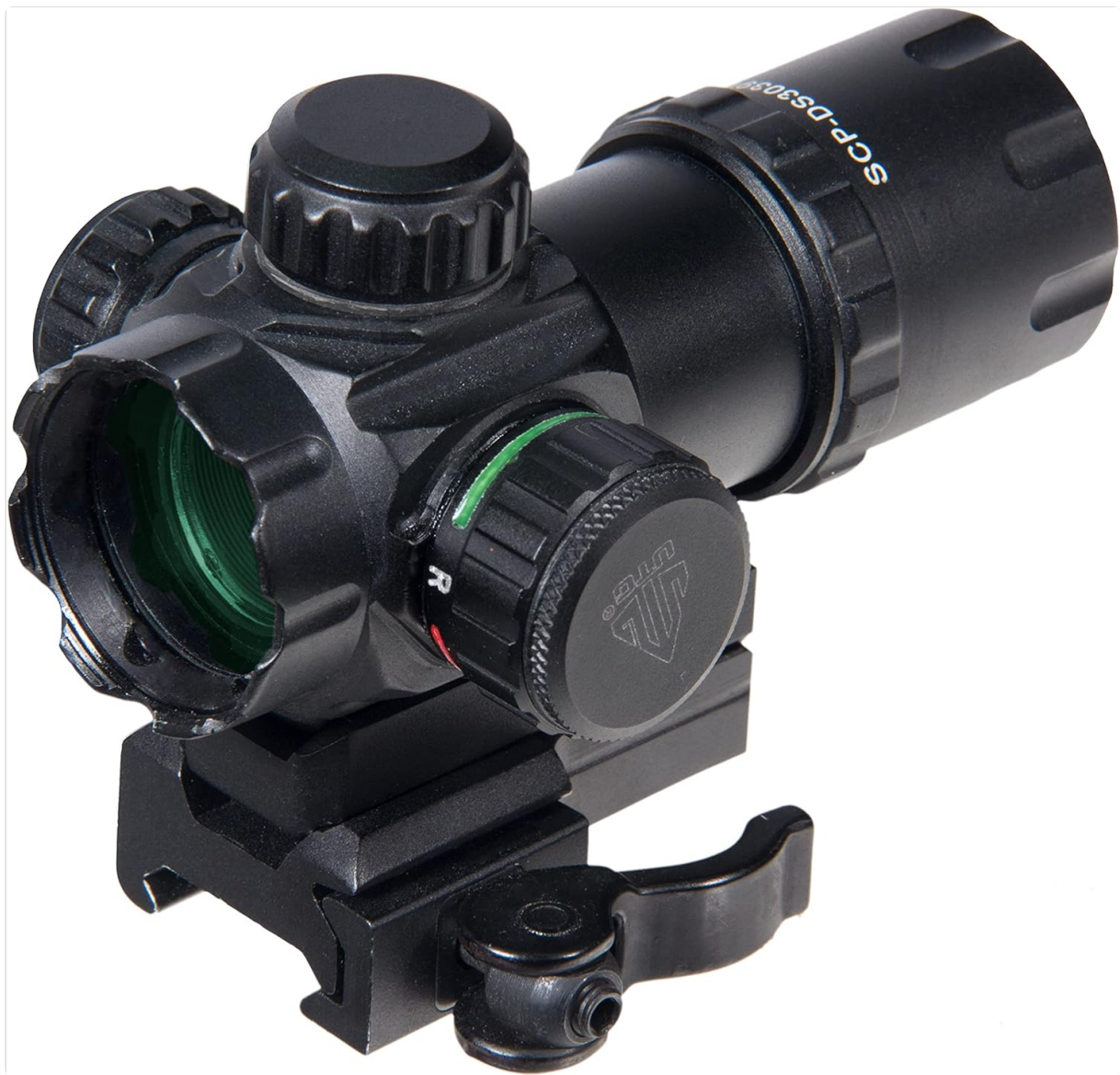
Image: Main view of the UTG Red/Green Dot Sight, showing the overall design and adjustment knobs.