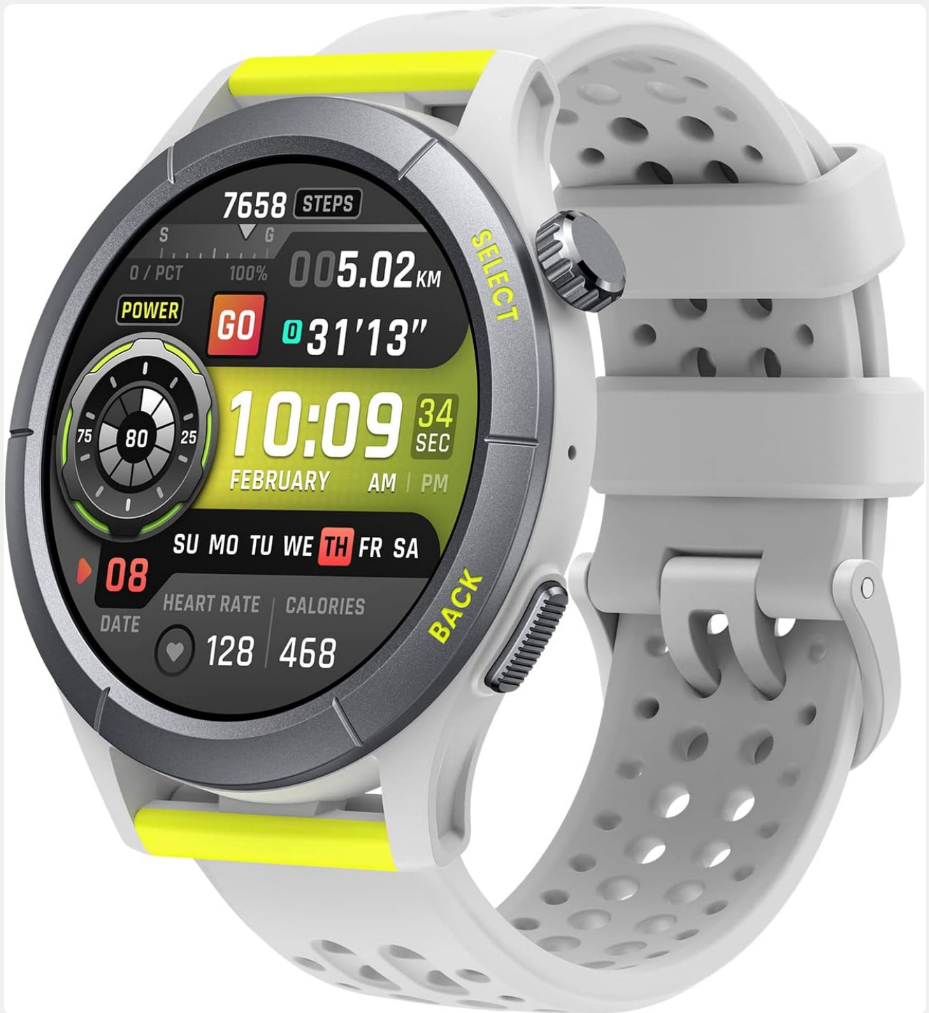
The Amazfit Cheetah Smart Watch, designed for optimal performance and comprehensive health tracking.