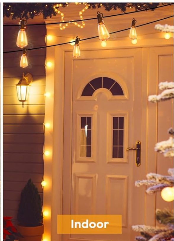
Image: An outdoor patio area illuminated by the string lights, demonstrating a typical installation layout with lights strung across the space.