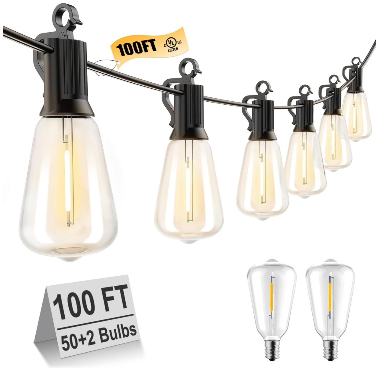
Image: Brighttown 100FT Outdoor String Lights, showcasing the full length of the string with 52 clear Edison-style bulbs, including two spare bulbs.