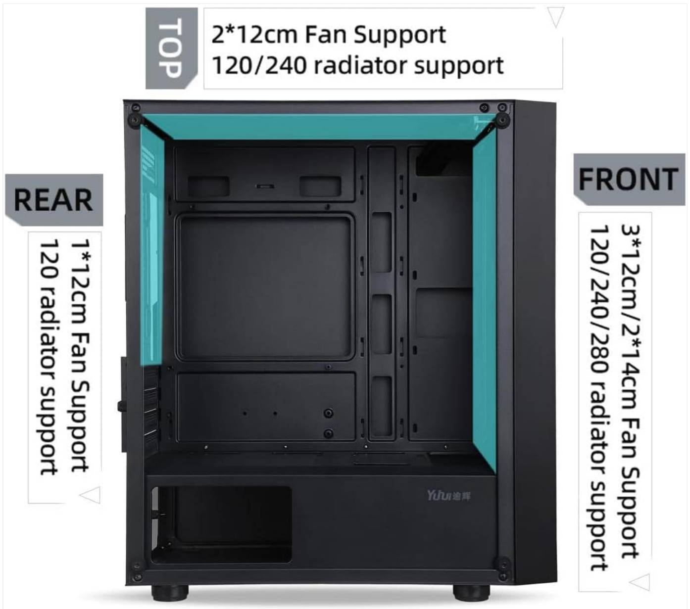
Image: Diagram detailing the fan and radiator support locations and sizes for the front, top, and rear of the SAMA M203 case.