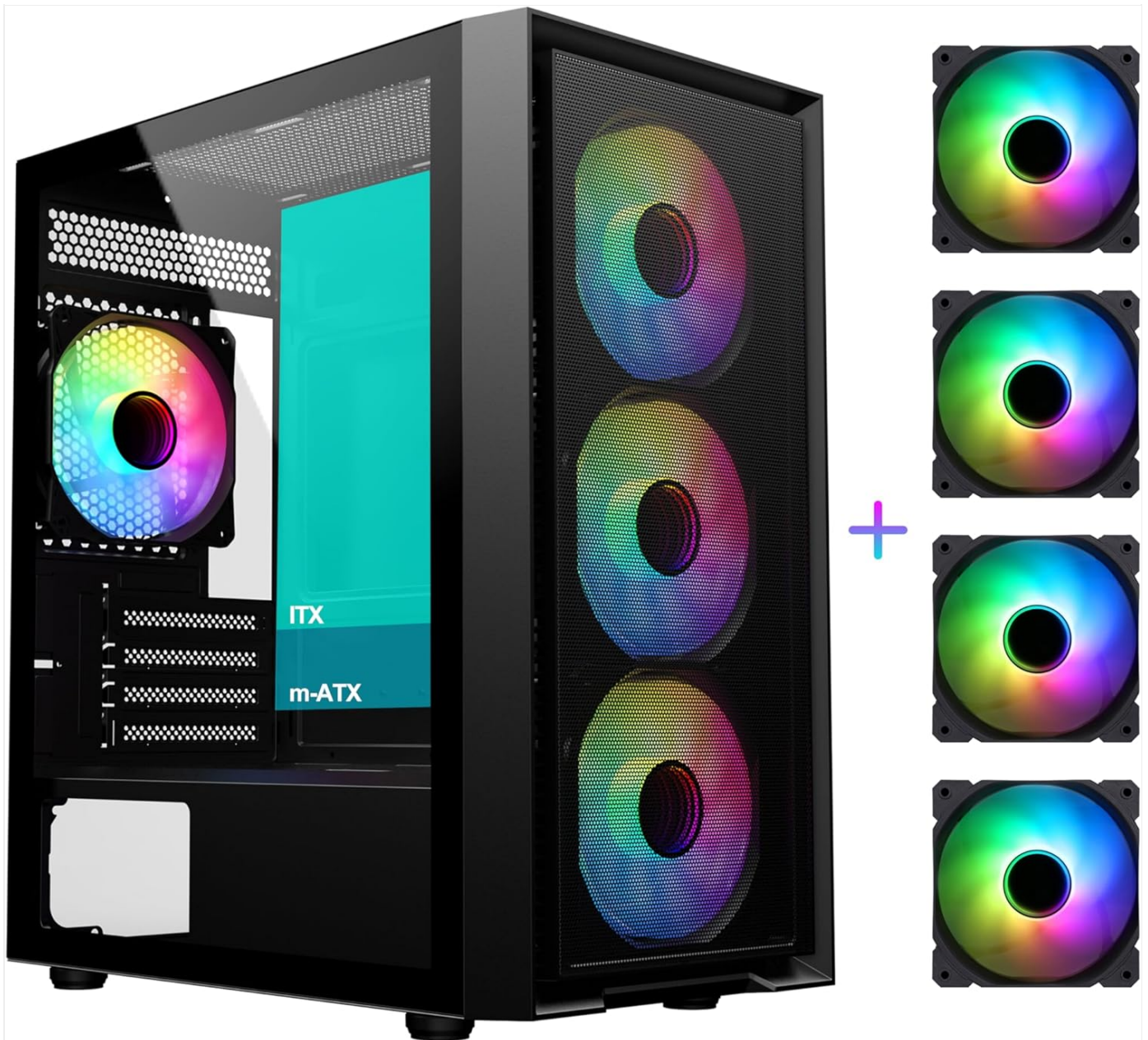
Image: Diagram illustrating the vertical M-ATX and ITX motherboard compatibility within the SAMA M203 case.

The SAMA M203 supports vertical M-ATX and ITX motherboards. Install the necessary standoffs for your motherboard form factor. Carefully align your motherboard with the standoffs and the rear I/O shield opening, then secure it with screws.