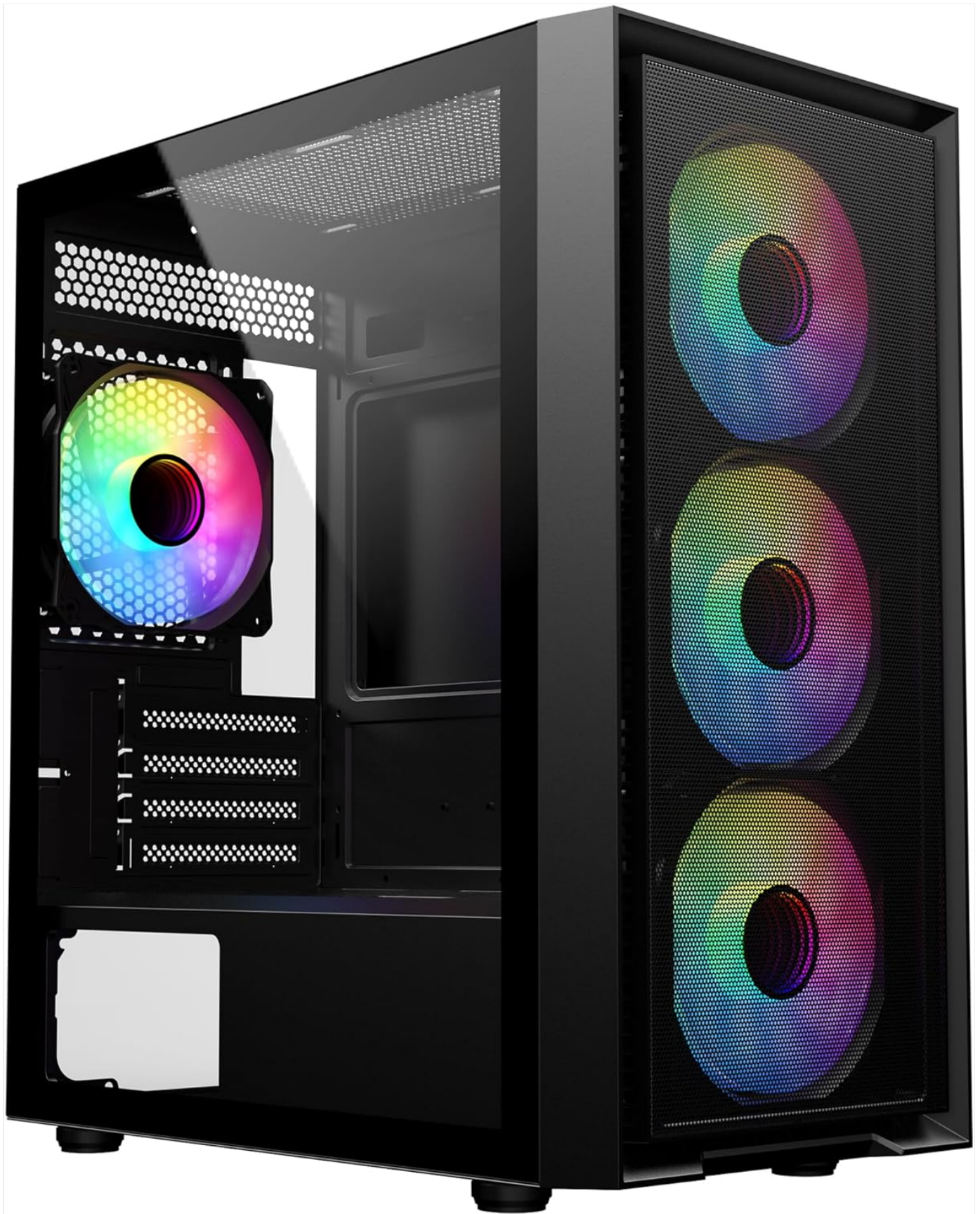
Image: Front-angled view of the SAMA M203 computer case, showcasing the tempered glass side panel and three front-mounted F-RGB fans, along with one rear F-RGB fan.