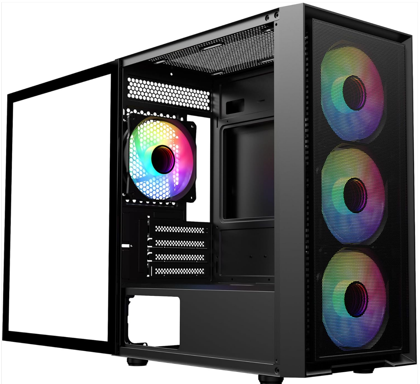
Image: The SAMA M203 computer case with its tempered glass side panel removed, revealing the interior for component installation.

Before installing components, ensure the case is placed on a stable, flat surface. Carefully remove the tempered glass side panel by unscrewing the four thumb screws and gently pulling it away from the chassis. It is recommended to lay the case on its side during component installation.