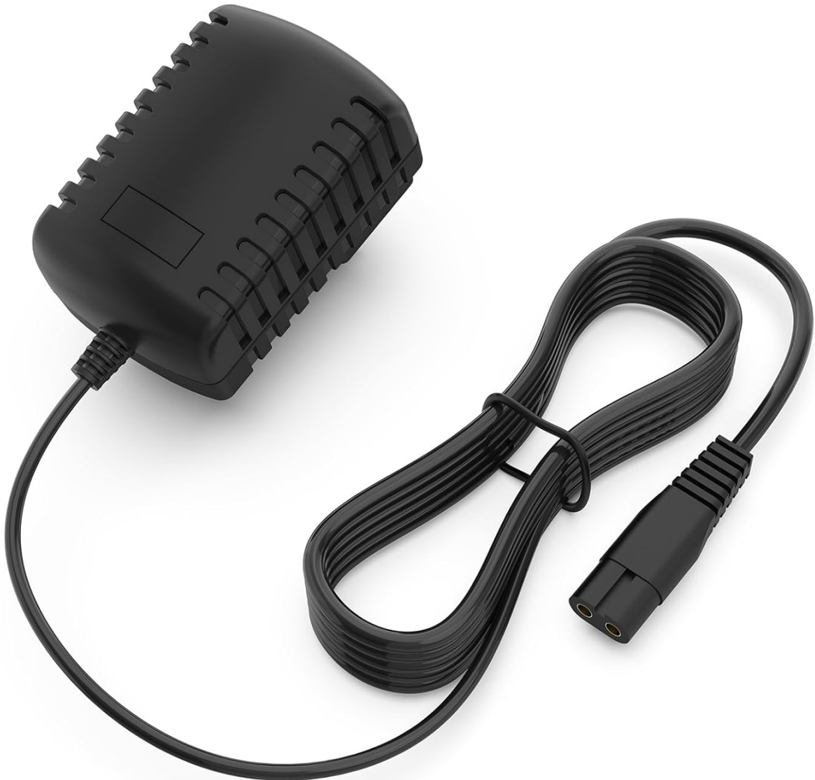
Image: The VOJSALDR D4.5V-1 charger with text overlays indicating its input (AC 100V-240Volt) and output (DC 4.5V class 2 power supply).