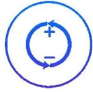
Short Circuit Protection