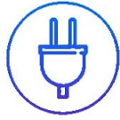
Over Charge Protection