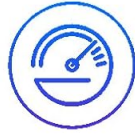
Over Load Protection