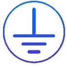
Over Current Protection