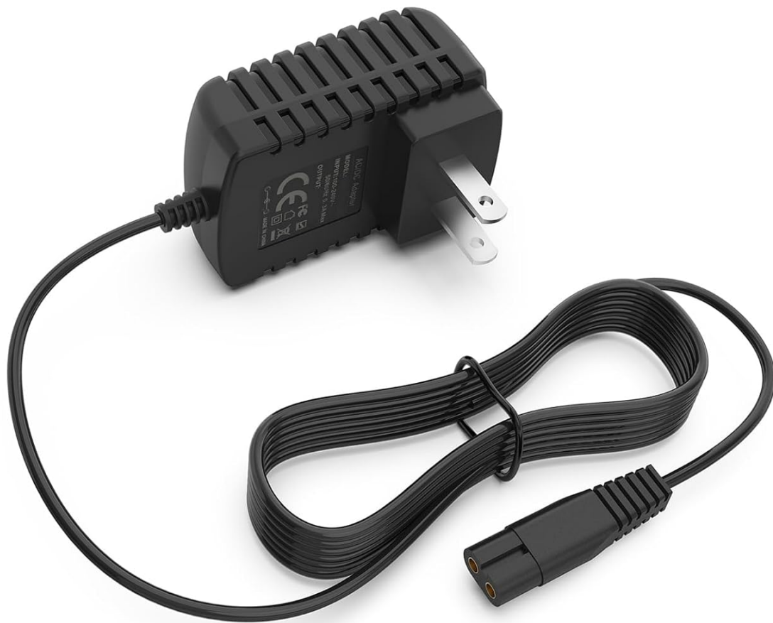
Image: The VOJSALDR D4.5V-1 charger shown alongside a list of compatible Andis cordless clipper and trimmer models, including 73000, 73060, 73095, 73130, 73500, and 73515.

4.5V Shaver charger for Andis SPA045120DU 73102 Cordless Envy Li 395059 EnvyLi LCL 73000 73105 73106 73005 73010 73045 73050 73060 73095 77511 Supra Li 5 SupraLi LCL-2 73500 73035 73505 Pulse Li 5 PulseLi 73515 Cordless Clipper Trimmer