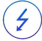
Over Voltage Protection