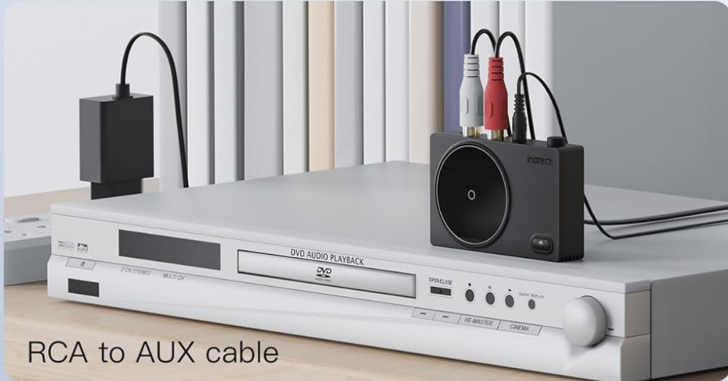
RCA to AUX cable