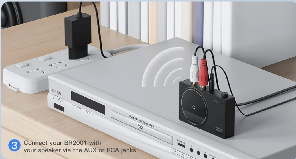
Image: Step-by-step guide demonstrating how to connect the BR2001 to power, connect to a speaker via AUX/RCA, and pair with a smartphone via Bluetooth.