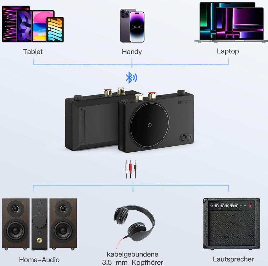
Image: A visual representation of the Inateck BR2001's wide compatibility, connecting Bluetooth devices like tablets, phones, and laptops to home audio systems, wired headphones, and speakers.

Machen Sie Ihre nicht-bluetoothfähigen Lautsprecher/Heimstereo/Headset bluetooth-fähig