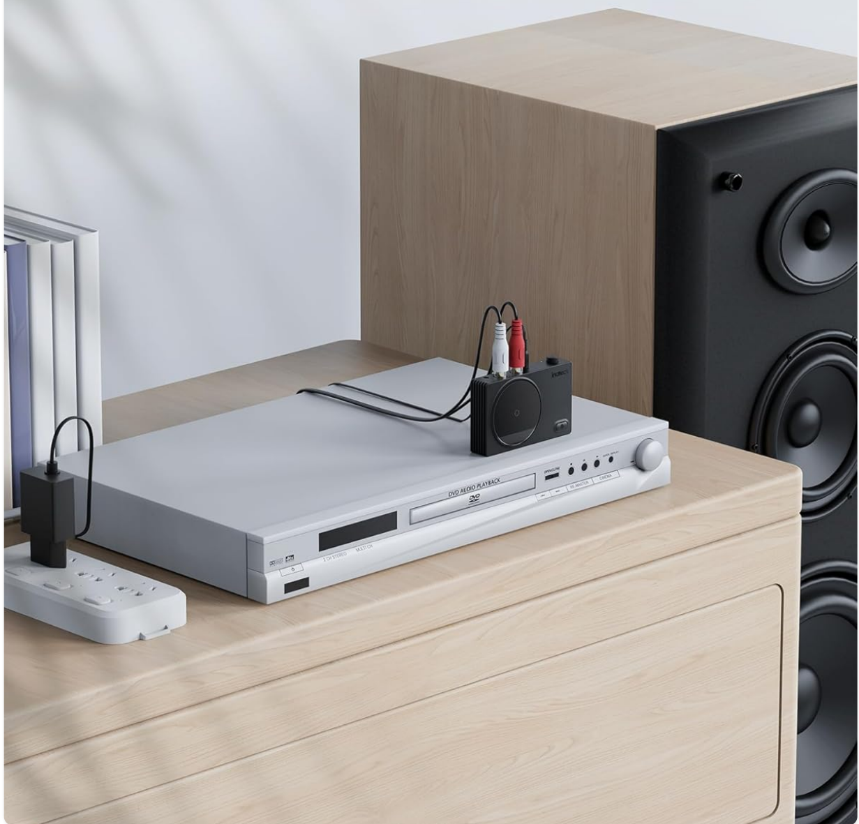
Image: The Inateck BR2001 connected to a stereo system, enabling wireless music playback from a smartphone, bringing older speakers to life.

Plug the jack into the stereo, and pair it with your phone. Start your day with soft music