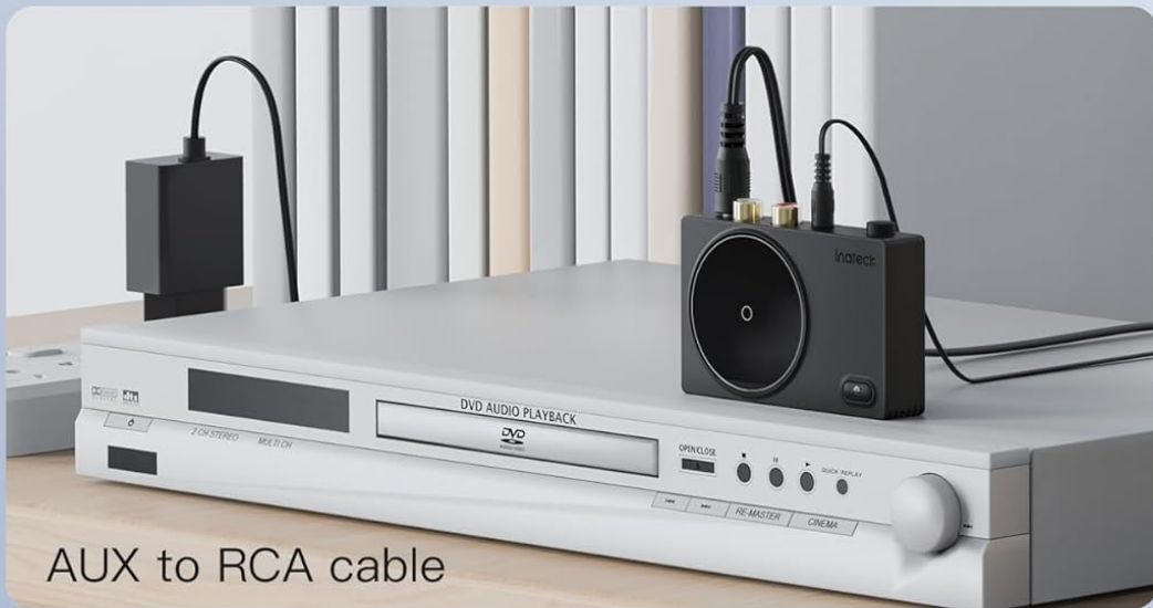
AUX to RCA cable

Image: The Inateck BR2001 receiver with its bidirectional transmission cable connected, illustrating both RCA to AUX and AUX to RCA configurations.