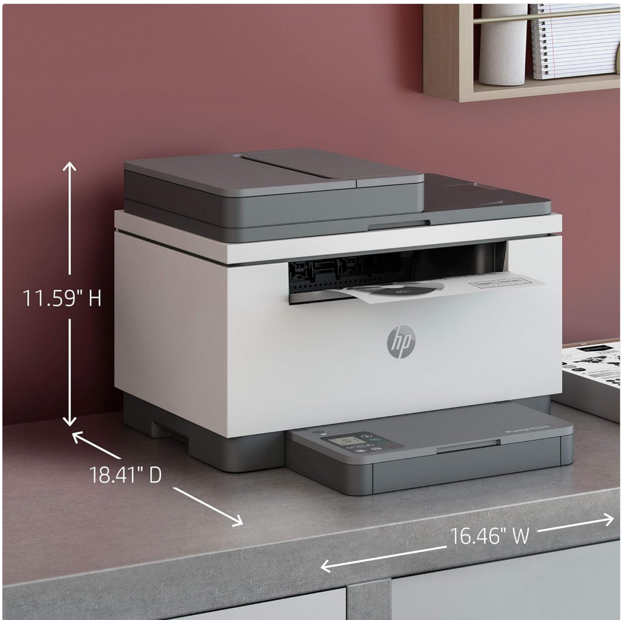
Figure 6.1: Product Dimensions