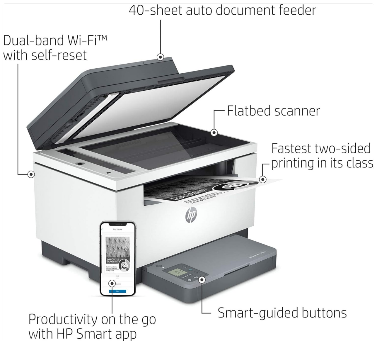
Figure 3.3: Printer Features Overview