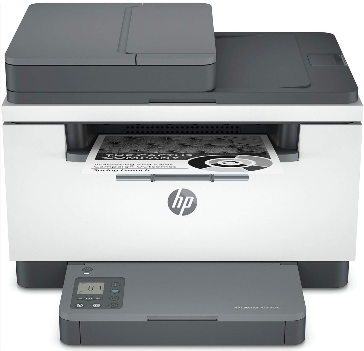
Figure 1.1: HP LaserJet MFP M234sdw Printer