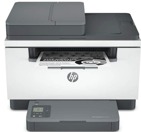
HP LaserJet MFP M234sdw