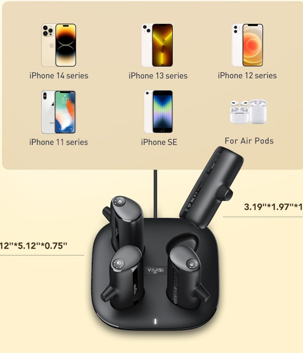
Image 3.1: Diagram illustrating the compatibility of the VIYISI G007P power banks with various iPhone models (14, 13, 12, 11, SE, XR, XS, 8 series) and AirPods.