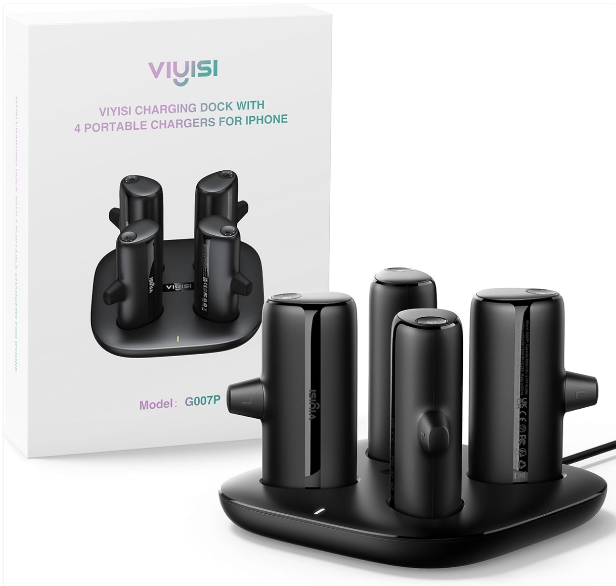
Image 2.1: The VIYISI G007P Portable Power Bank Kit in its retail packaging, displaying the charging station and power banks.