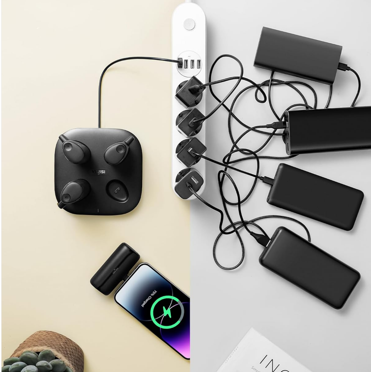
Image 5.1.1: The VIYISI G007P charging station with all four mini power banks docked and charging, illustrating an organized charging setup.

Charges 4 powerbanks simultaneously with charging dock