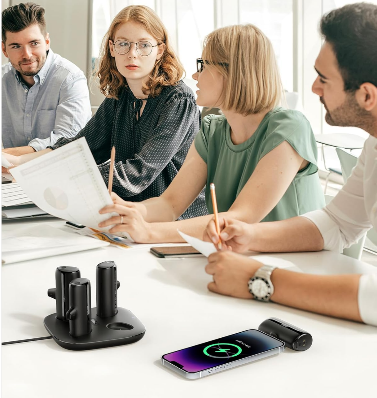
Image 5.2.1: A mini power bank connected to an iPhone, demonstrating 20W fast charging capability.