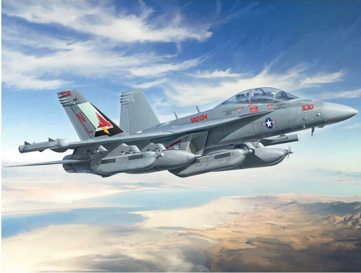
Image: Front view of the Italeri EA-18G Growler 1:48 Plastic Model Kit box, showcasing the aircraft model.