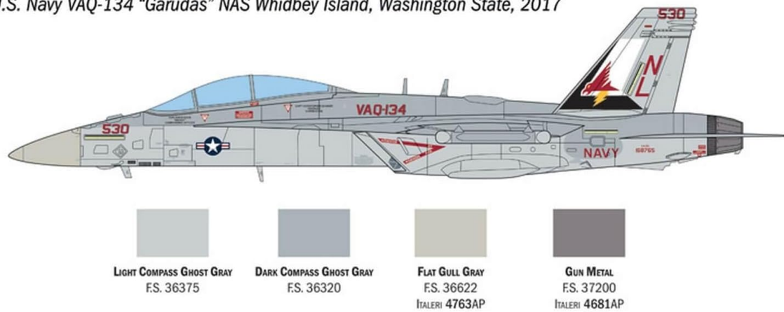
Version A - Boeing EA-18G Growler, s/n 168765, U.S. Navy VAQ-134 "Garudas" NAS Whidbey Island, Washington State, 2017

Image: Paint scheme for Version B - Boeing EA-18G Growler, s/n 168274, U.S. Navy VAQ-137 "Rooks" NAS Whidbey Island, Washington State, 2018. Recommended colors include Light Compass Ghost Gray (F.S. 36375), Dark Compass Ghost Gray (F.S. 36320), and Gun Metal (F.S. 37200).