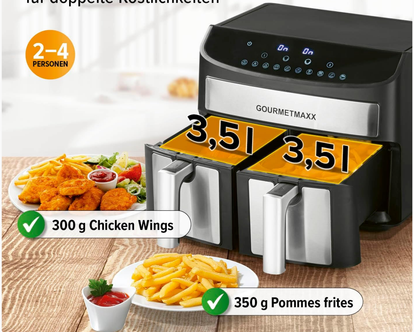
Image: The dual chambers filled with different foods, illustrating the capacity suitable for 2-4 persons.