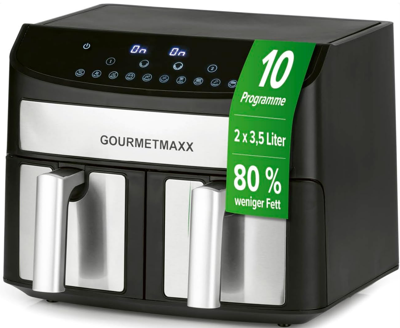
Image: The GOURMETmaxx Dual-Chamber Hot Air Fryer, showcasing its sleek design, digital control panel, and two independent cooking baskets.