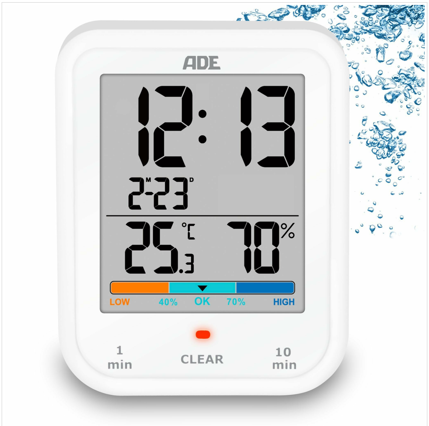
Image: Front view of the ADE CK2304 Digital Bathroom Clock, displaying time, date, temperature, and humidity readings on its large LCD screen.