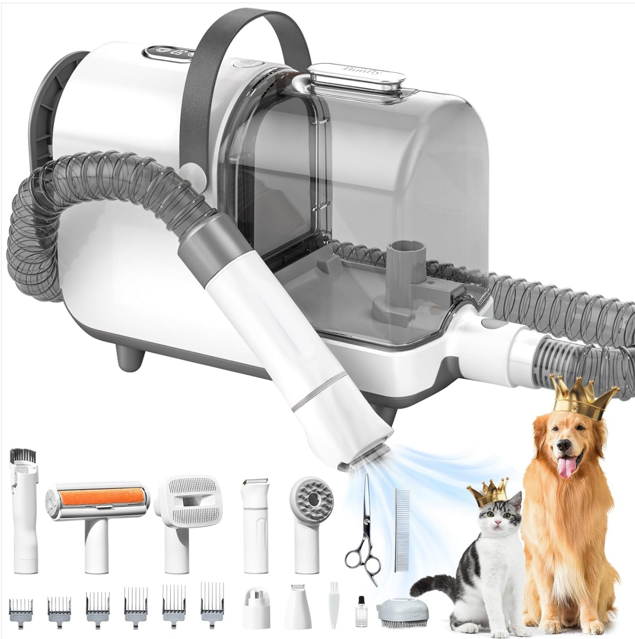
Image: The Bunfly Dog Grooming Kit, showcasing the main vacuum unit, hose, and all 16 included grooming tools and accessories.