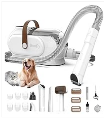
Image: A golden retriever lying down, appearing relaxed while being massaged with the soothing massage comb attachment.