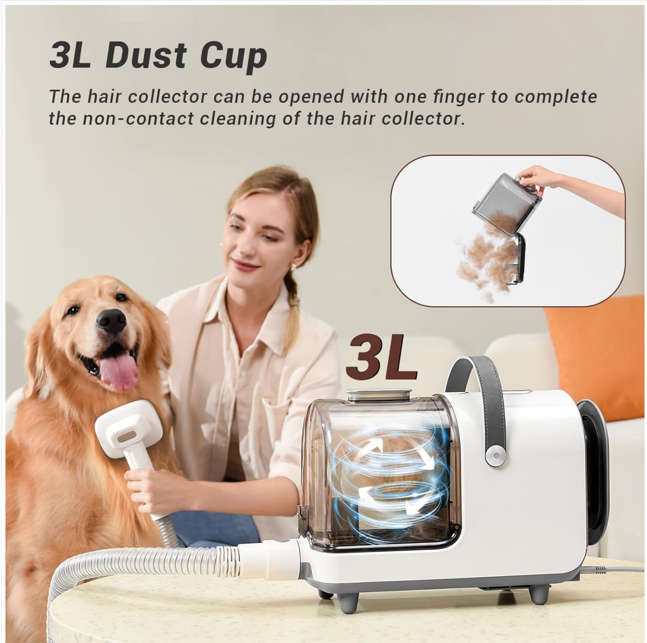
Image: Illustration of the 3L dust cup, demonstrating its large capacity and the simple, non-contact method for emptying collected pet hair.

Equipped with a 3L dust cup, the Bunfly grooming kit can handle grooming for multiple pets without frequent emptying. The hair collector is designed for non-contact cleaning, allowing you to empty it with a single finger.