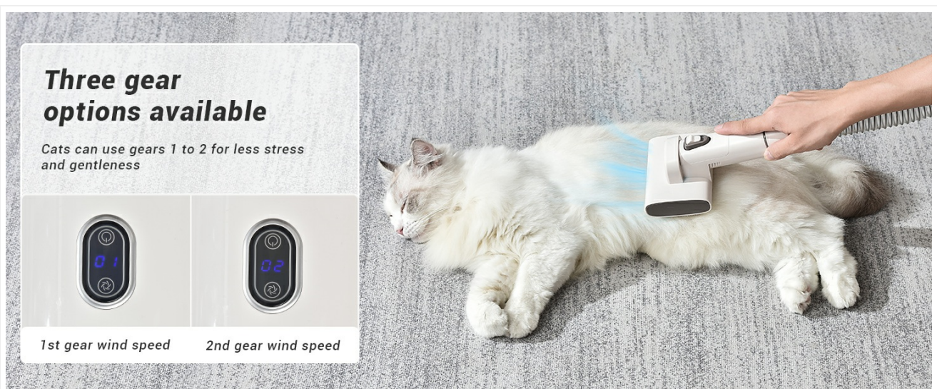
Image: A visual guide to the three gear options for suction, suggesting lower settings for cats and sensitive pets.

The device features 3 adjustable suction levels. For sensitive pets or cats, it is recommended to start with lower settings (Gear 1 or 2) for less stress and gentleness.