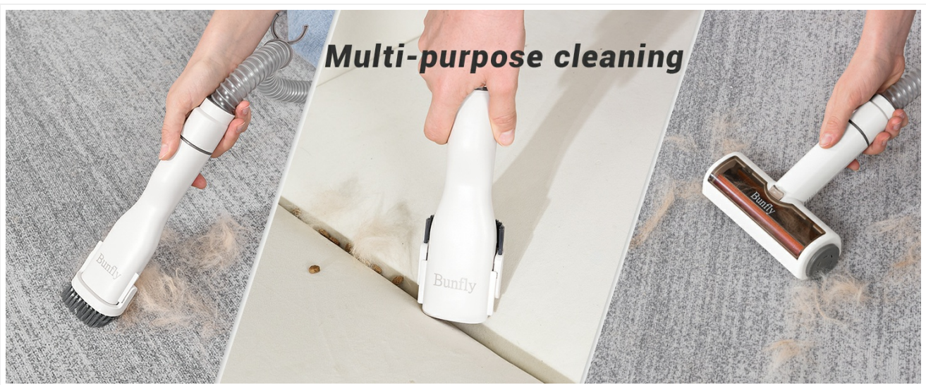
Image: A collage demonstrating the use of different attachments for multi-purpose cleaning, including a crevice tool and a hair roller.

Utilize the 2-in-1 flat suction tool, pet hair roller brush, and other attachments for cleaning pet hair from furniture, carpets, and other surfaces.