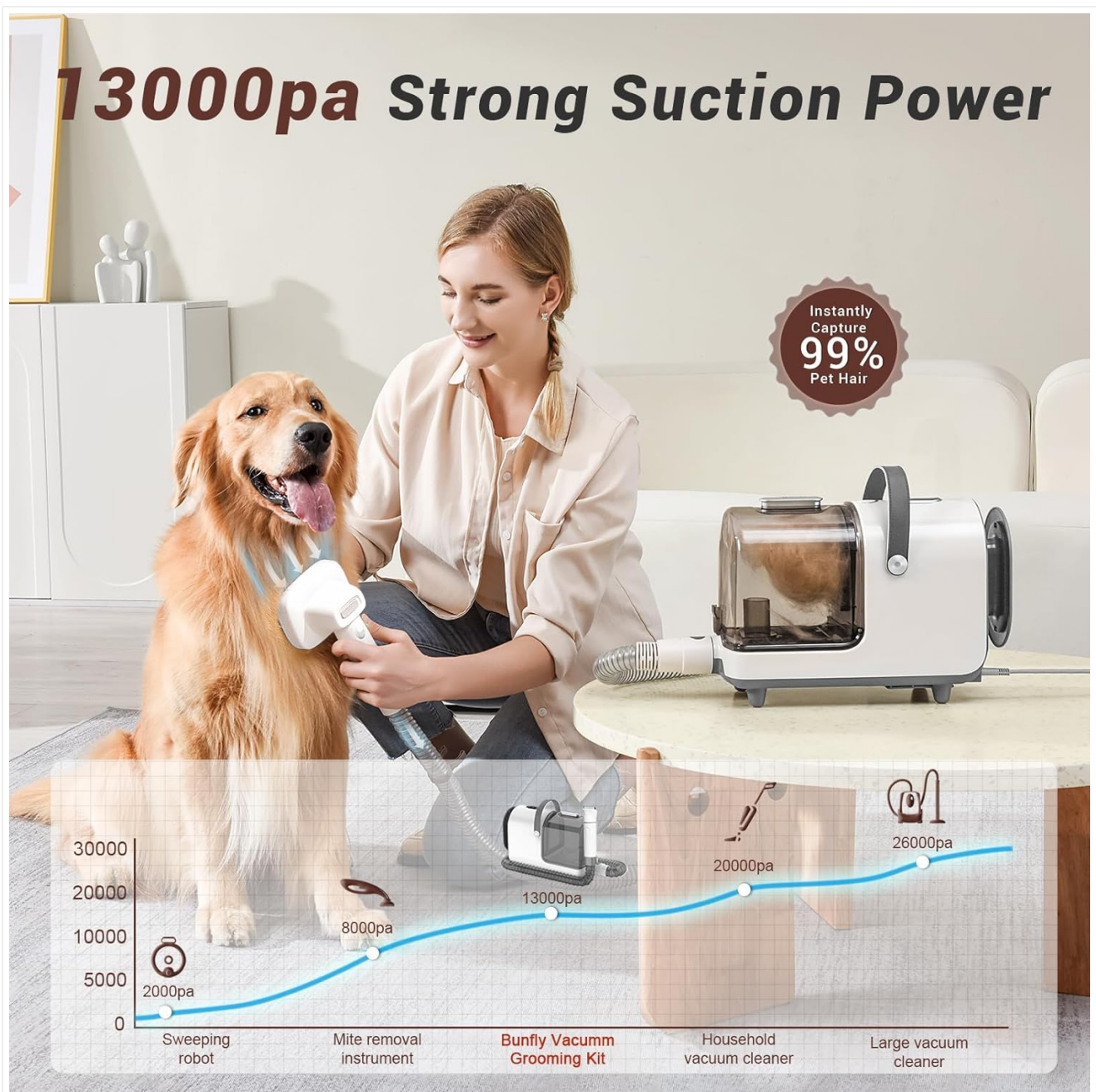
Image: Visual representation of the 13000Pa strong suction power, showing how it instantly captures pet hair.

The Bunfly grooming kit features a powerful vacuum design with suction up to 13,000Pa, capturing 99.99% of pet hair directly into the dust cup. This minimizes mess and keeps your grooming area clean.