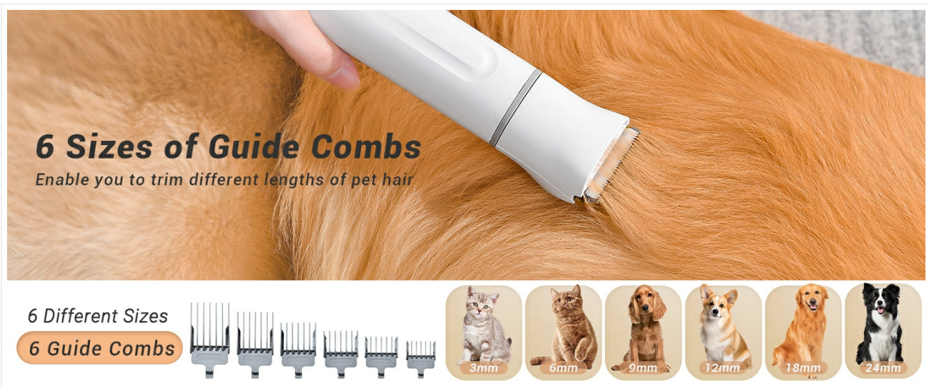
Image: A golden retriever being groomed with the electric trimmer attachment, demonstrating its use on the body.

Attach the desired guide comb (available in 6 sizes: 3mm, 6mm, 9mm, 12mm, 18mm, 24mm) to the electric hair clipper for precise hair length. Ensure the pet's hair is dry. Press the power button on the clipper and trim hair evenly. The clipper also includes a detail blade head for intricate areas and a nail grinding head for paw care.