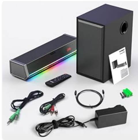
Image 3.1: Contents of the Smalody Soundbar Speaker System package.