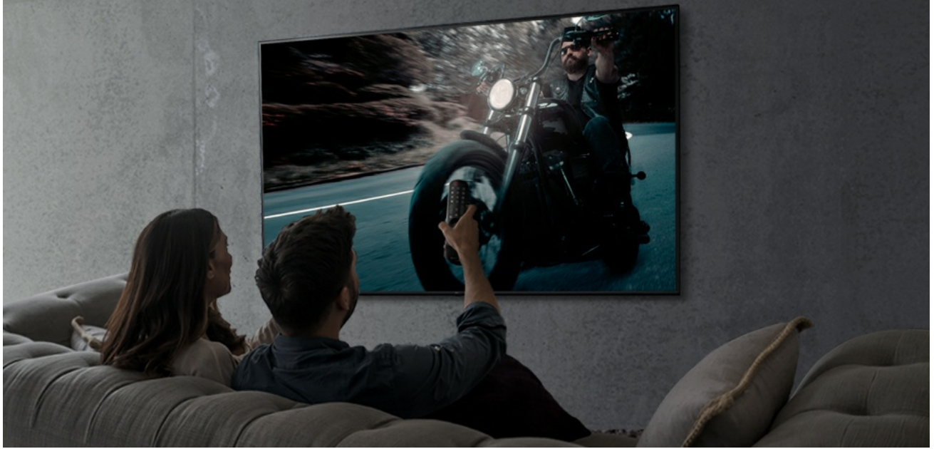
Figure 5.2: Immersive cinema experience at home.

Assista em 4K e desfrute de uma experiência de visualização como se estivesse no cinema.