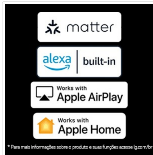
Figure 4.3: Smart Assistant and Connectivity options.