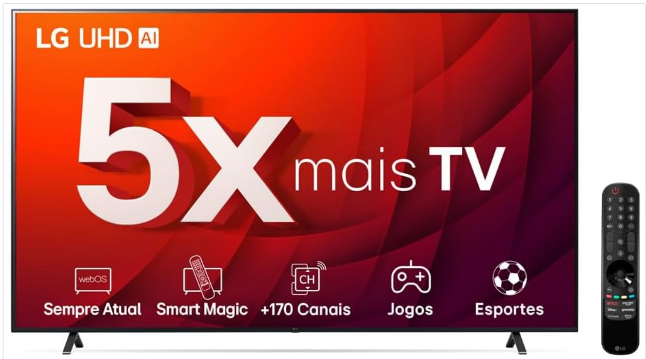
Figure 3.1: Front view of the LG 55UR8750PSA Smart TV.