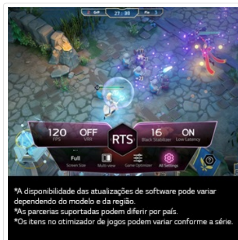
Figure 4.4: Game Panel and Optimizer settings.