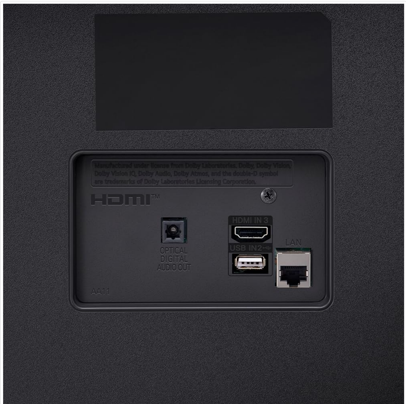
Figure 3.3: Rear view of the LG 55UR8750PSA showing connectivity ports.