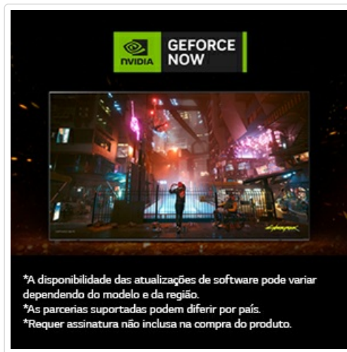
Figure 4.5: Cloud Gaming with GeForce NOW.