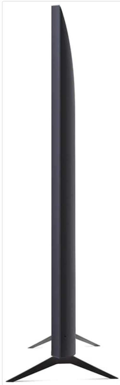
Figure 3.2: Side profile of the LG 55UR8750PSA Smart TV.