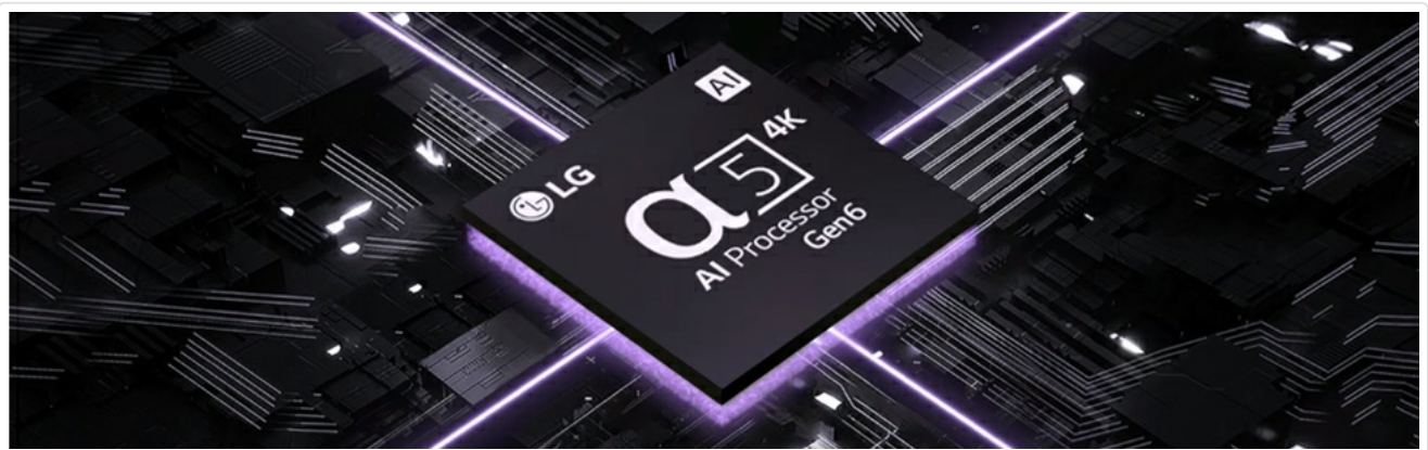
Figure 5.1: LG α5 AI Processor Gen6.