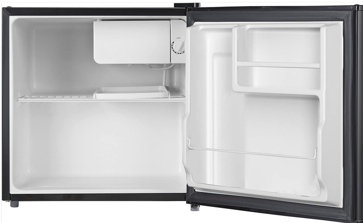
Figure 3.3: Interior view of the Philco PFG50P Frigobar, focusing on the thermostat. This image shows the location of the temperature control dial and the extra-cold compartment.