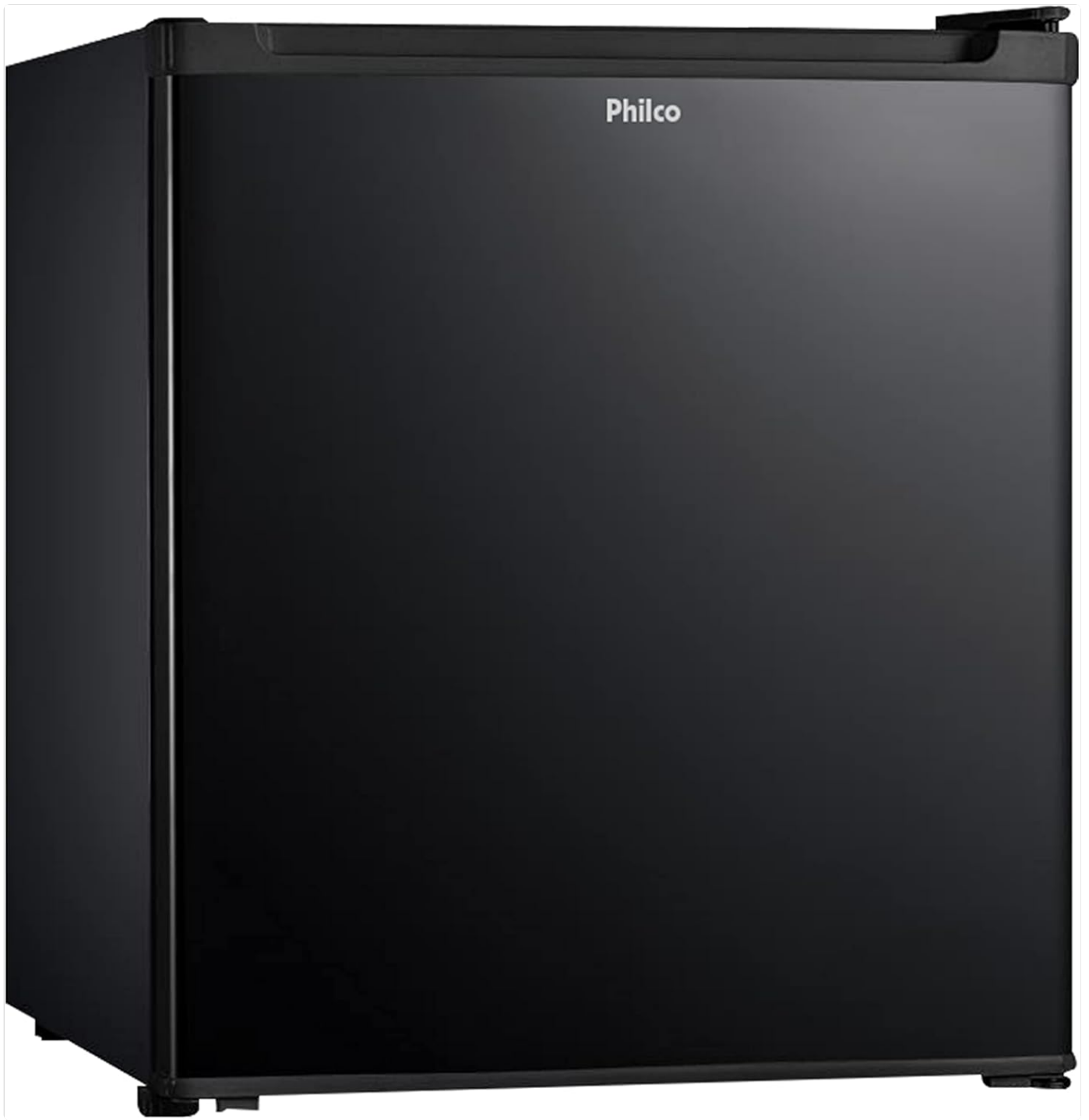
Figure 3.1: Front view of the Philco PFG50P Frigobar. This image shows the sleek black exterior and compact design of the appliance.