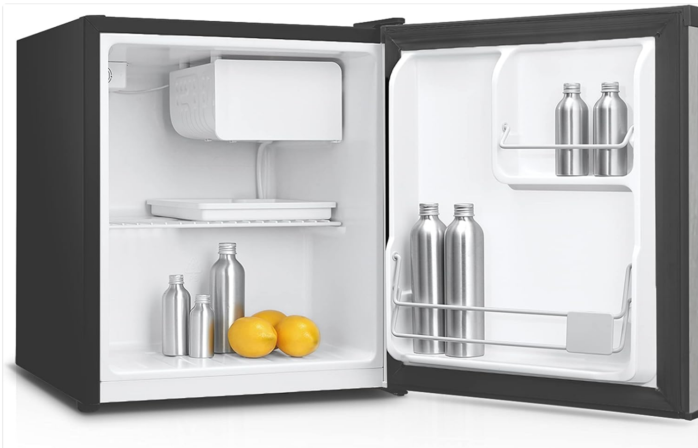
Figure 3.2: Interior view of the Philco PFG50P Frigobar with example contents. This image highlights the internal layout, including the removable shelf and door compartments for bottles and cans.