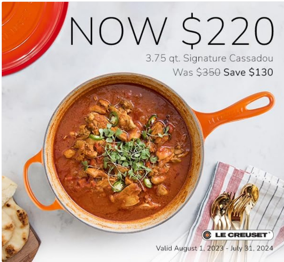
Figure 4: The Cassadou in use, cooking a chicken dish.