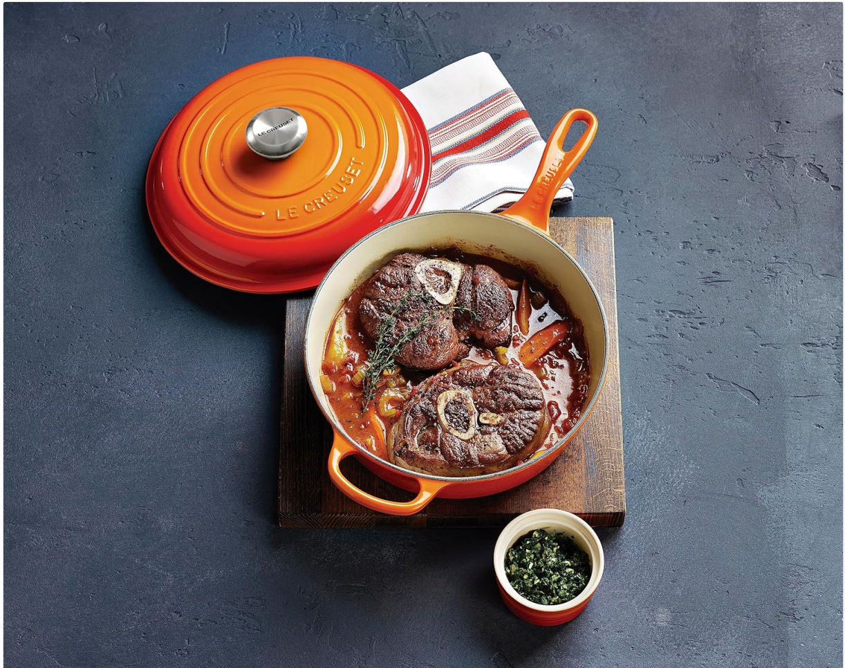
Figure 5: The Cassadou used for braising meat with vegetables.