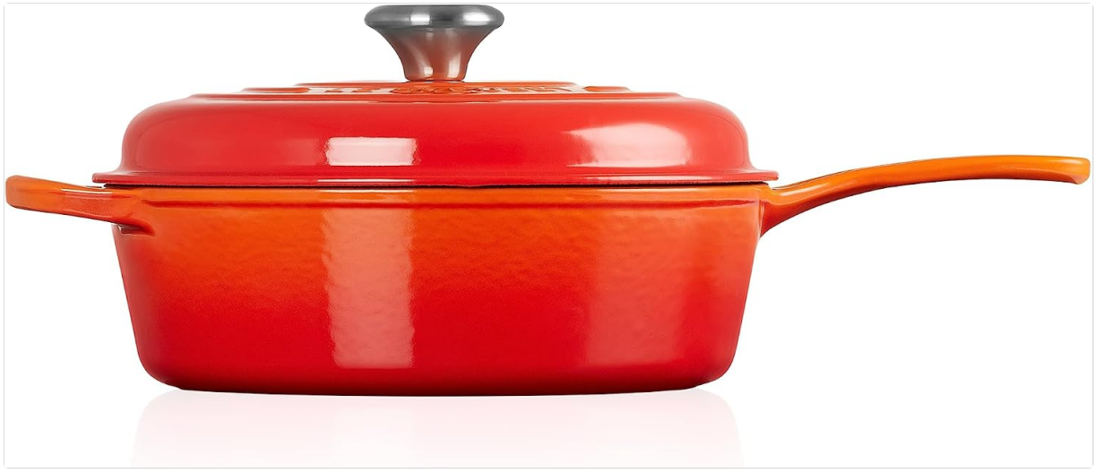
Figure 1: Front view of the Le Creuset Signature Cassadou in Flame color.