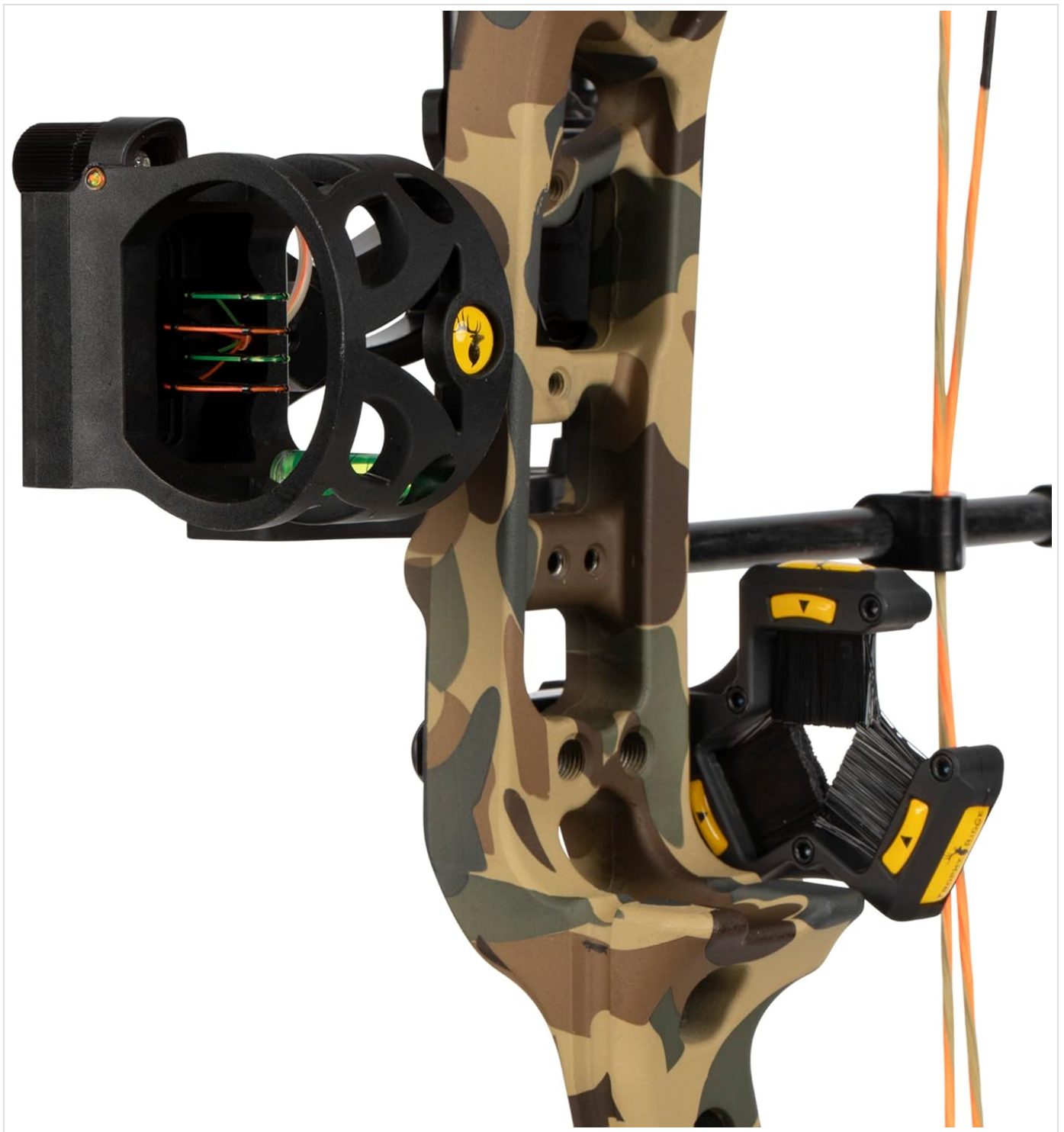
Figure 5: The stabilizer and wrist sling attached to the bow, enhancing stability and handling.