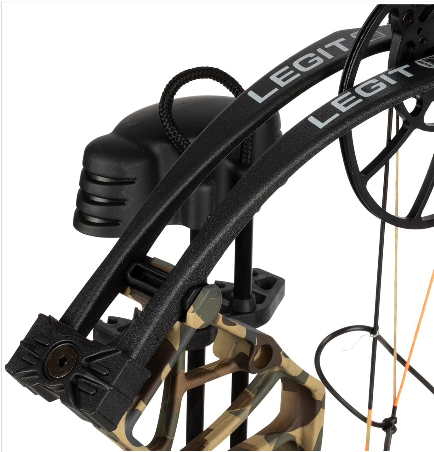
Figure 4: The Whisker Biscuit arrow rest, designed for full arrow containment.