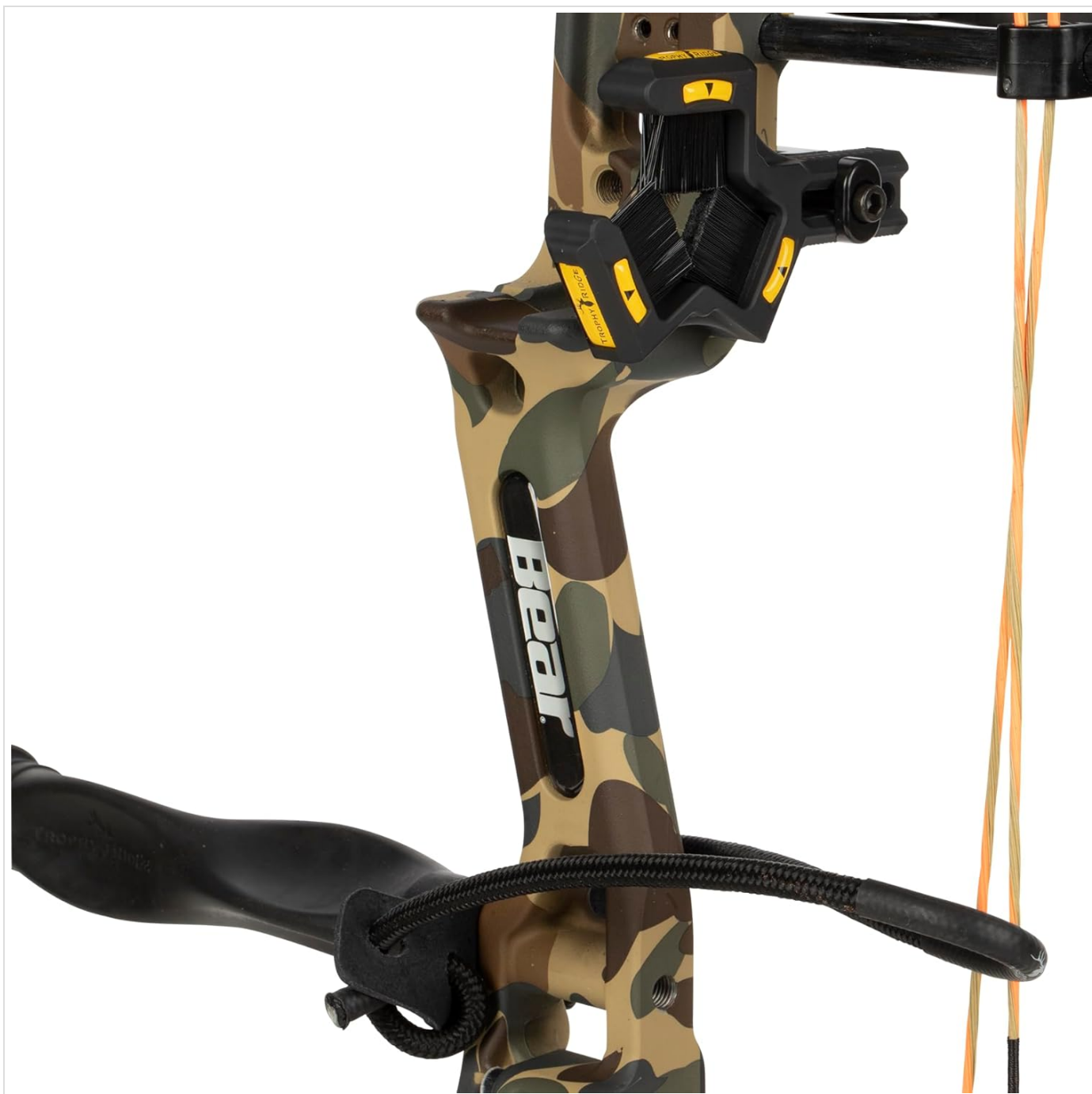
Figure 7: Regularly check all fasteners on the riser and accessories for tightness.