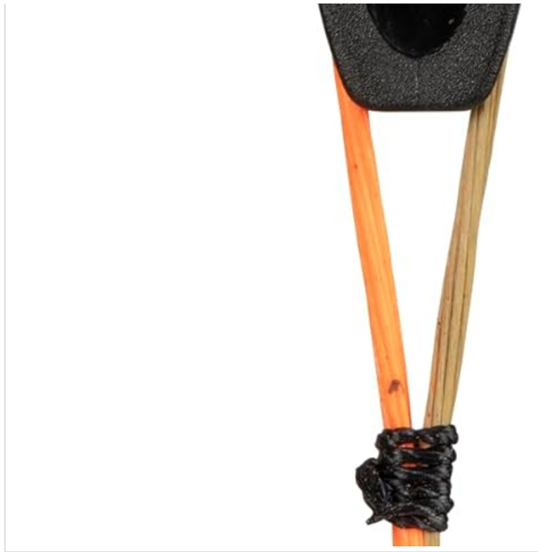
Figure 6: Inspect the cam system and string for wear and proper alignment.