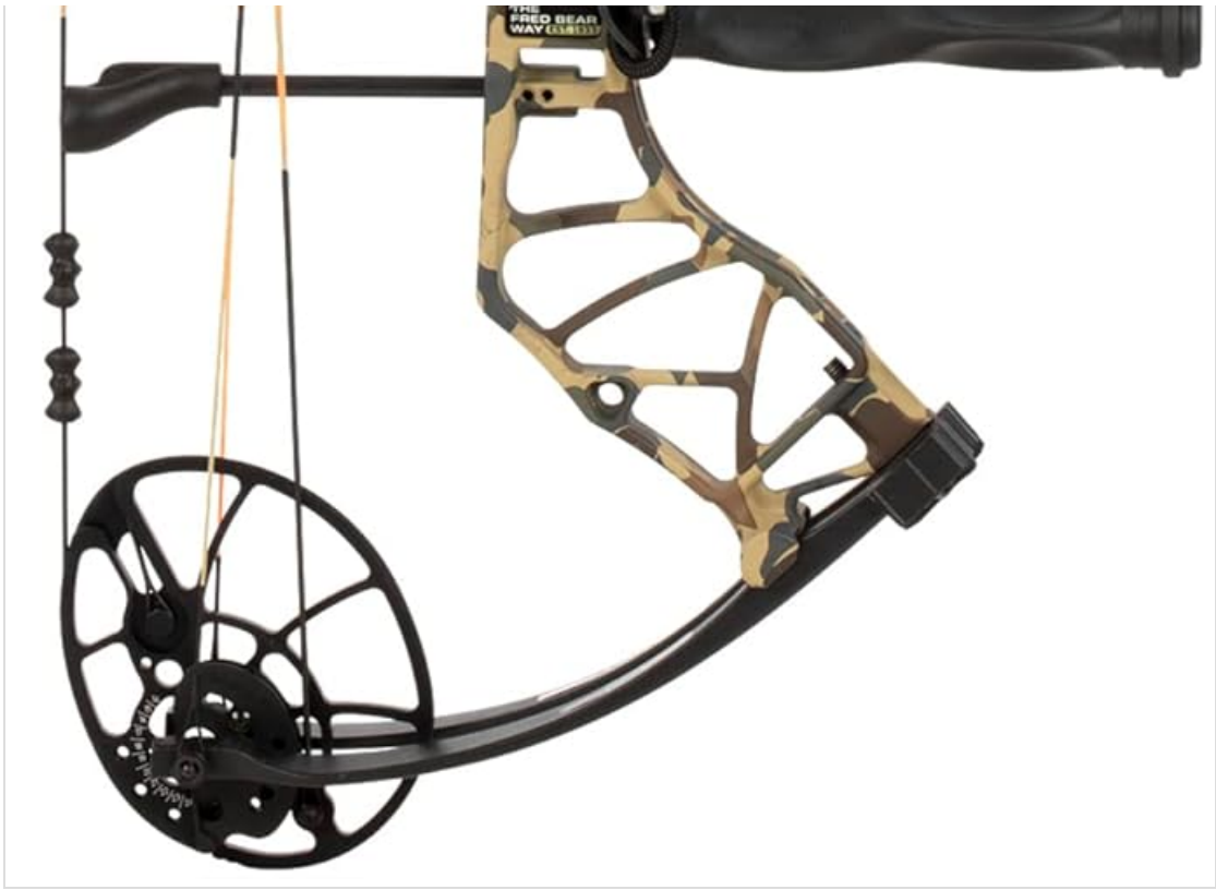
Figure 2: The Legit bow fully equipped with its included accessories, ready for use.