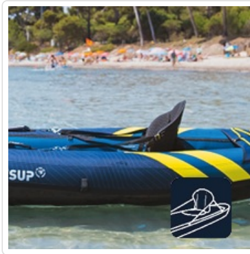
Image 5: Detail of the front transport handle on the kayak, facilitating carrying.

The kayak is equipped with fabric handles for easy transport once inflated.