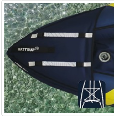
Image 6: The front deck of the kayak equipped with bungee cords for securing small items.