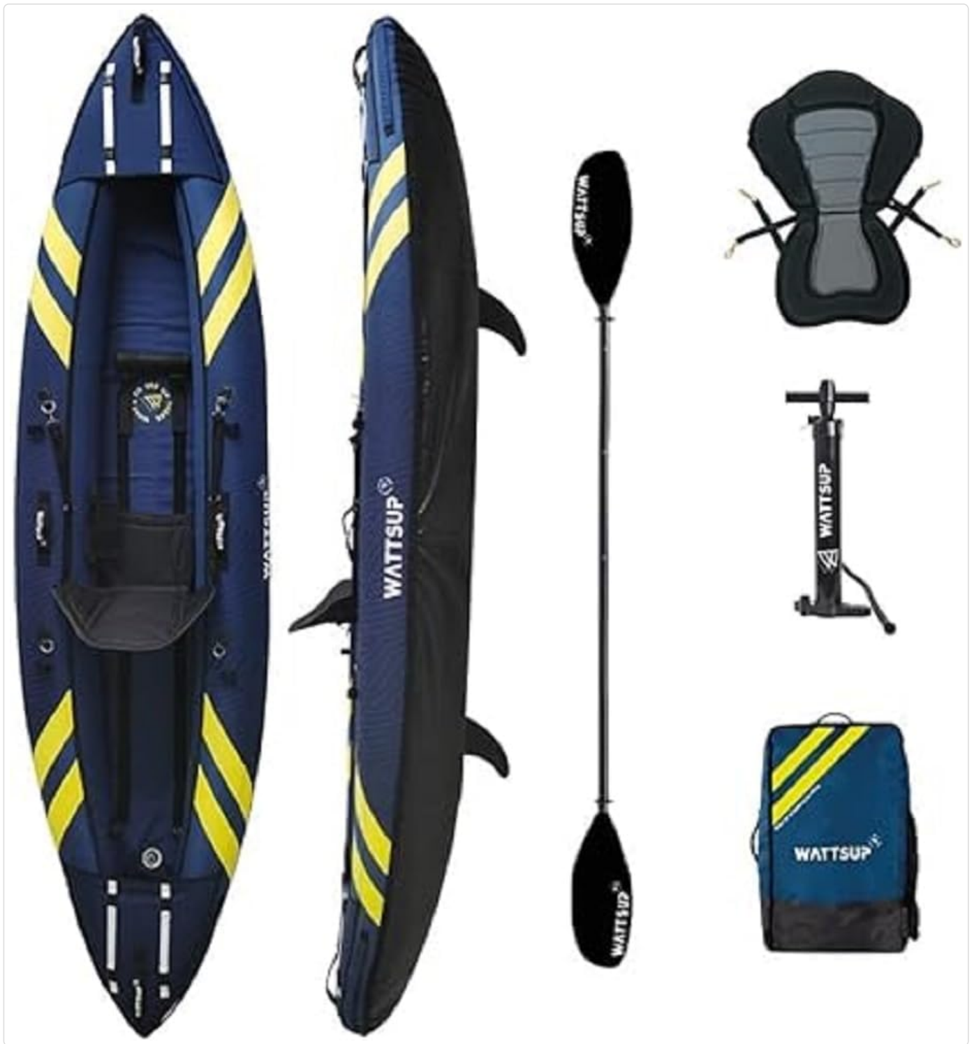
Image 1: All components of the Watsup CRUCIAN 1-Person Inflatable Kayak package, including the kayak, paddle, seat, pump, and transport bag.