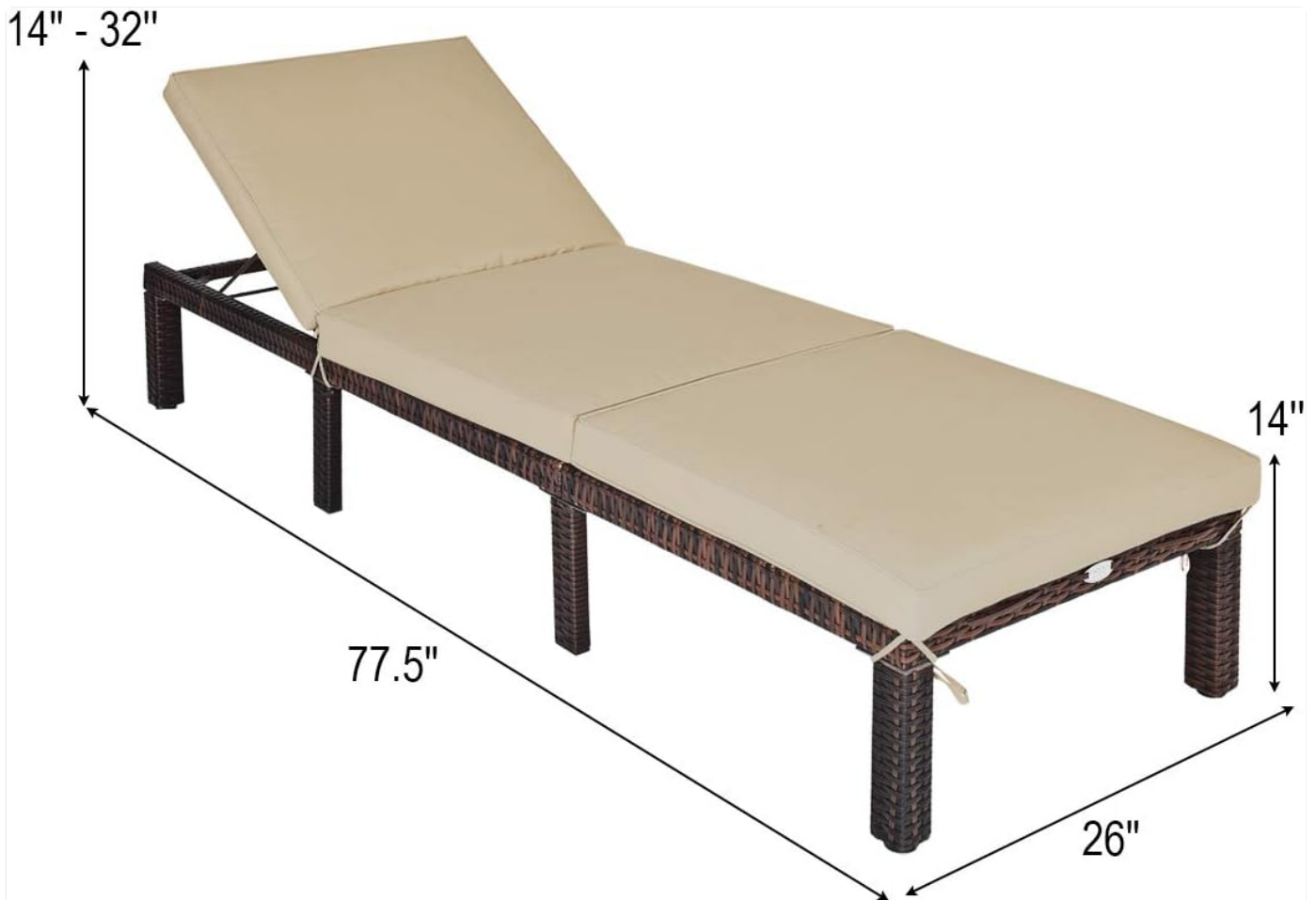
Figure 3: Product dimensions indicating a length of 77.5 inches, width of 26 inches, and adjustable height from 14 to 32 inches.