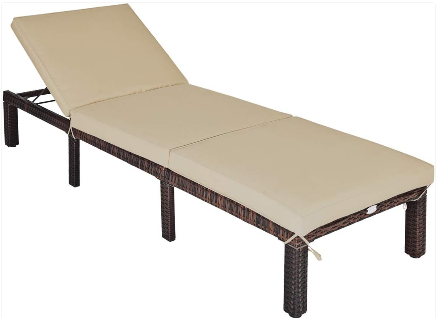
Figure 1: The COSTWAY Patio Rattan Lounge Chair, featuring a brown rattan frame and a comfortable beige cushion.