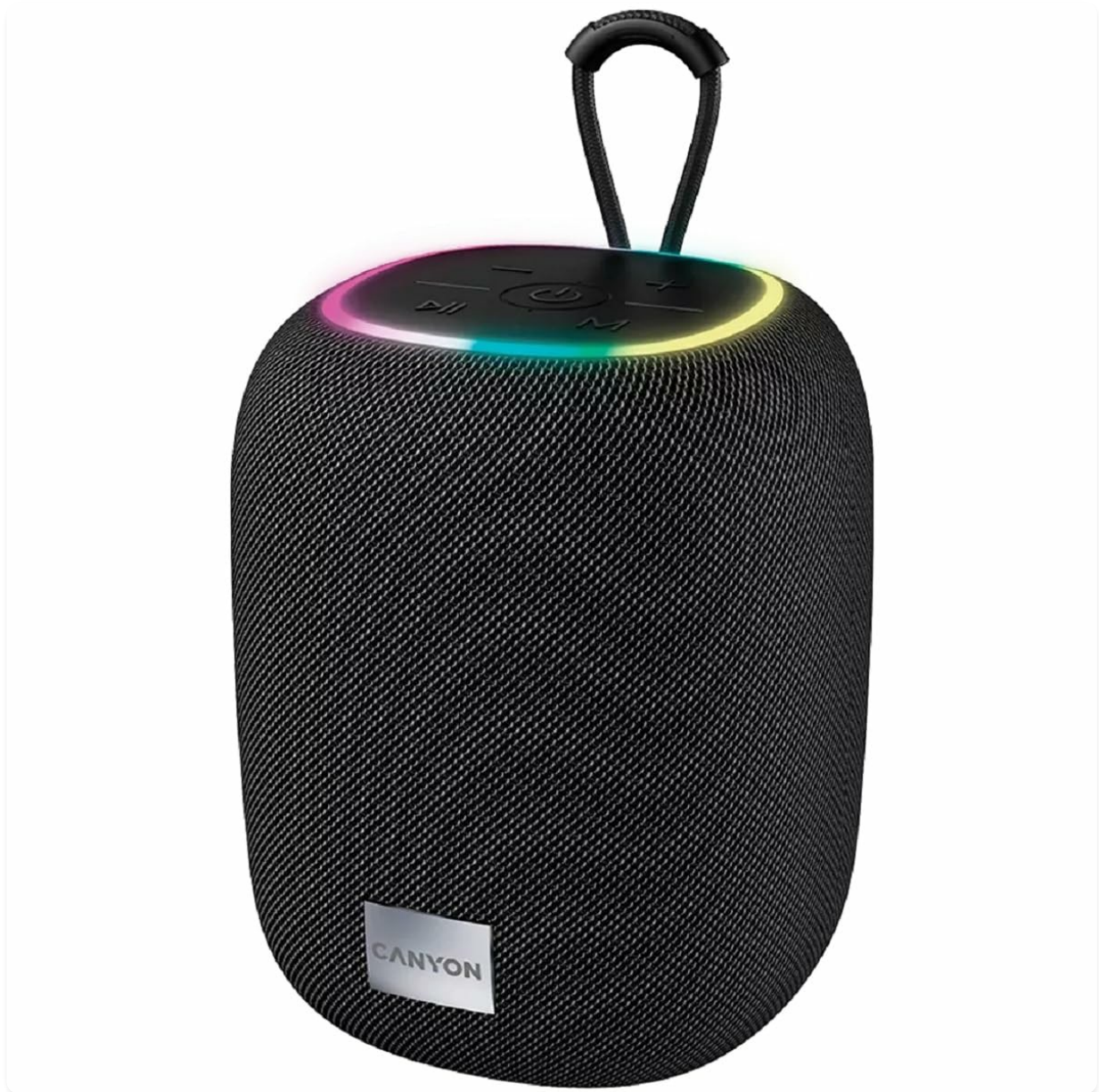
Image 1: Top view of the CANYON BSP-8 speaker, showing the control buttons, RGB backlight, and integrated hanger.

Familiarize yourself with the speaker's components and controls.