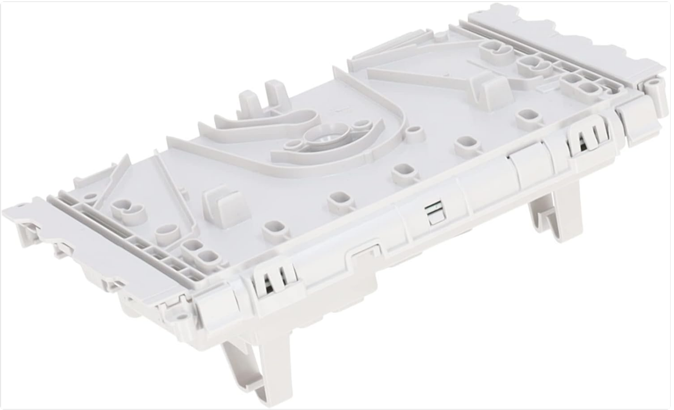
Figure 4: Underside of the control unit.