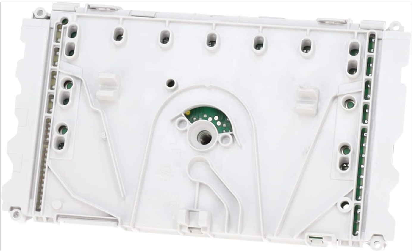
Figure 5: Bottom view of the control unit.