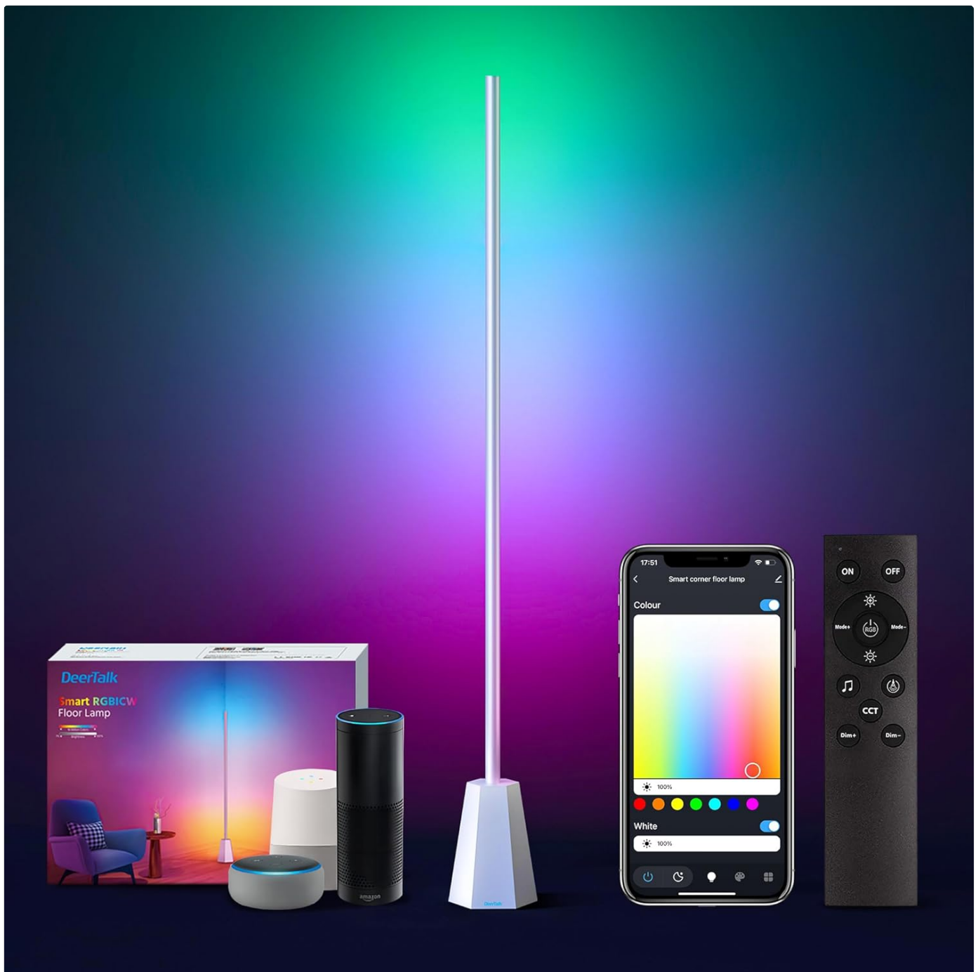
Image: The DeerTalk Smart RGBWIC LED Floor Lamp, showing the main lamp unit, remote control, and a smartphone displaying the control app. Also visible are smart home devices like Amazon Echo and Google Home, indicating compatibility.