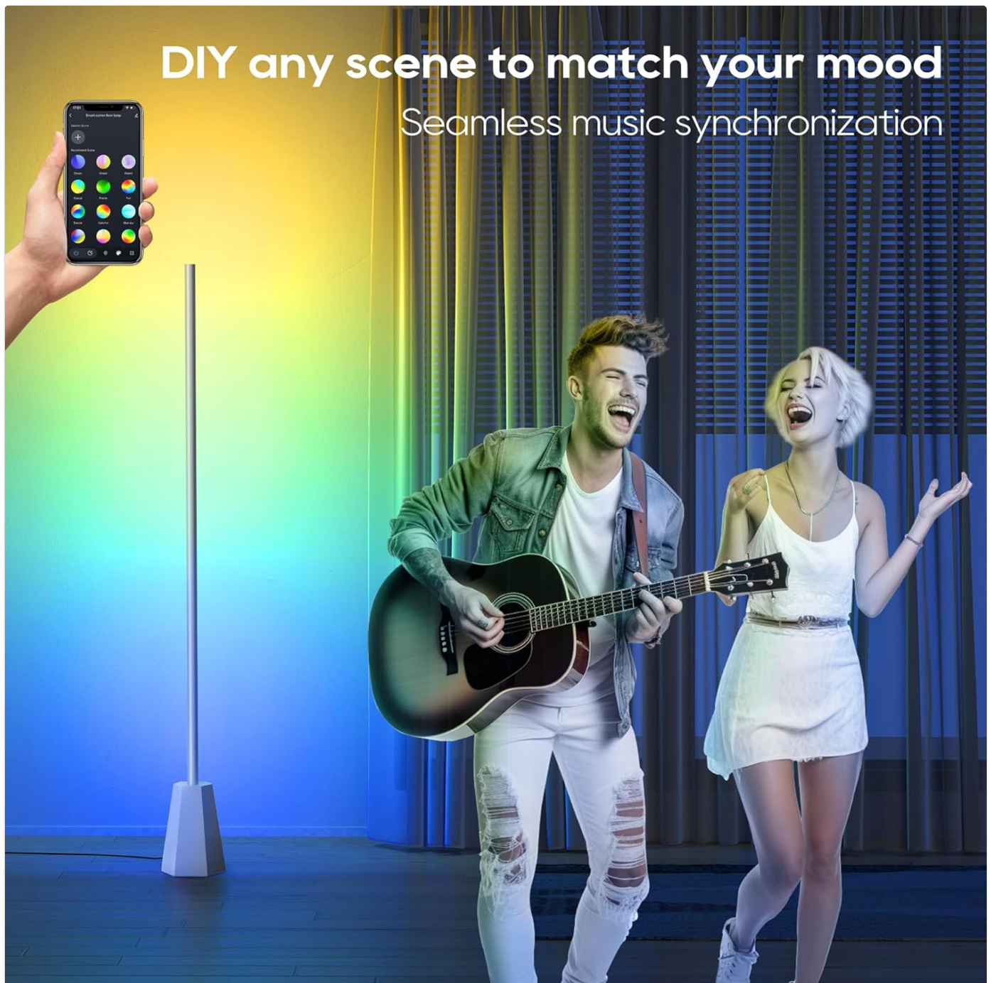
Image: A smartphone screen showing various DIY scene modes within the app, allowing users to customize lighting to match their mood. The image also depicts seamless music synchronization, with a couple enjoying music and the lamp's dynamic lighting.