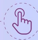
Image: A detailed view of the RF Remote Control with numbered functions (Indicator, Turn on, Brightness+, Adjust color/mode, Music sync, Color/mode, White light brightness+, Turn off, Adjust color/mode, music sync sensitivity-, Brightness-, Warm white, Warm/clear white, White light brightness-). Also shown is the Touch Button Control on the lamp's base for turning on/off and adjusting color/mode.