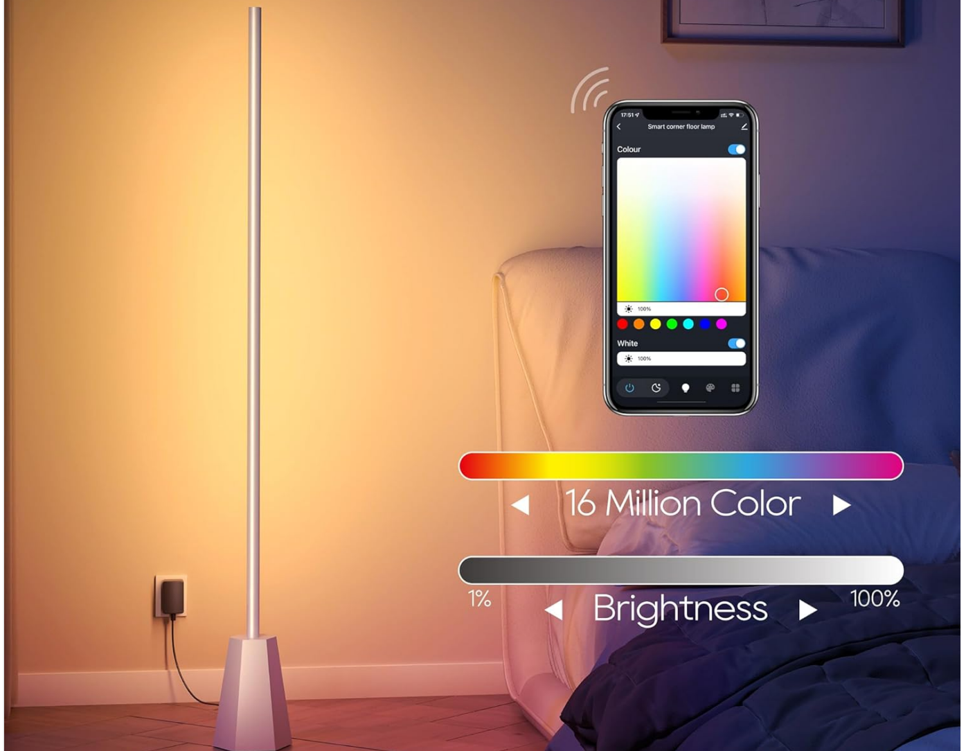
Image: A smartphone screen displaying the lamp's control app, showing a color wheel for 16 million color selection and a slider for brightness adjustment from 1% to 100%. The image also highlights the lamp's 1700 lumens brightness.