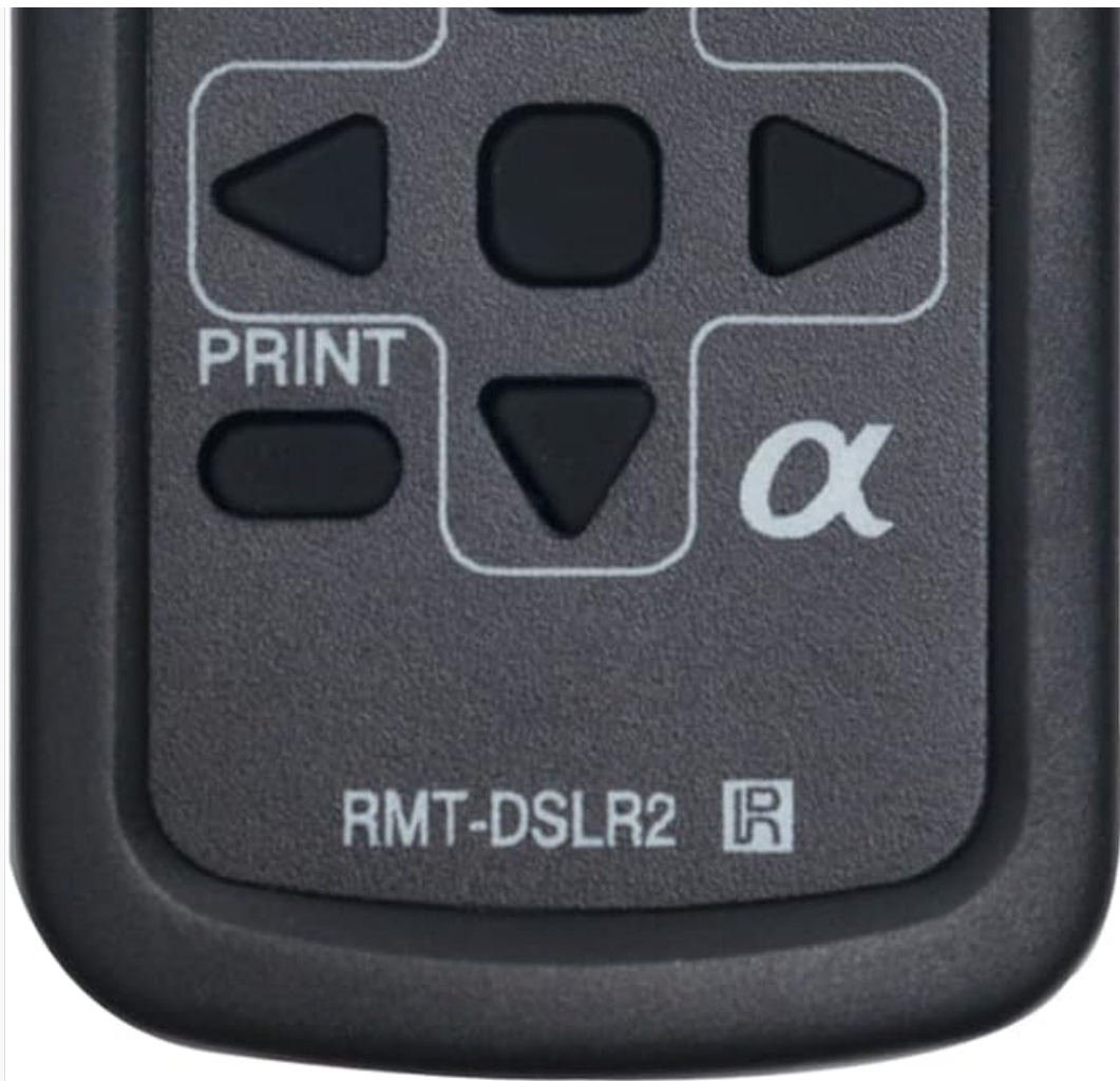
Image: Front view of the ALLIMITY RMT-DSLR2 Wireless Remote Commander, displaying its various buttons and their labels.