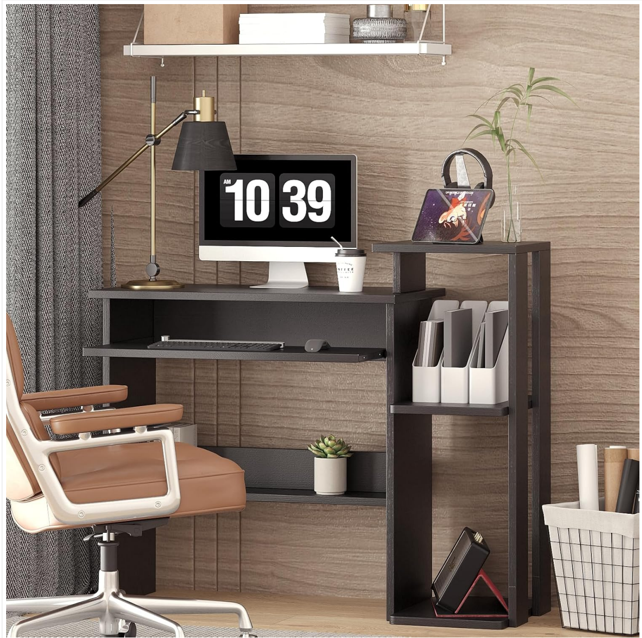
Image Description: The ALISENED Computer Desk is shown in a modern home office setup, featuring a monitor, laptop, keyboard, and various office accessories. The integrated shelves and monitor stand help keep the workspace organized and clutter-free.

Video Description: This video highlights the main features of the ALISENED Computer Desk, including its compact design, monitor stand, keyboard tray, storage shelves, CPU stand, and integrated power outlets. It showcases how these features contribute to an organized and efficient workspace.