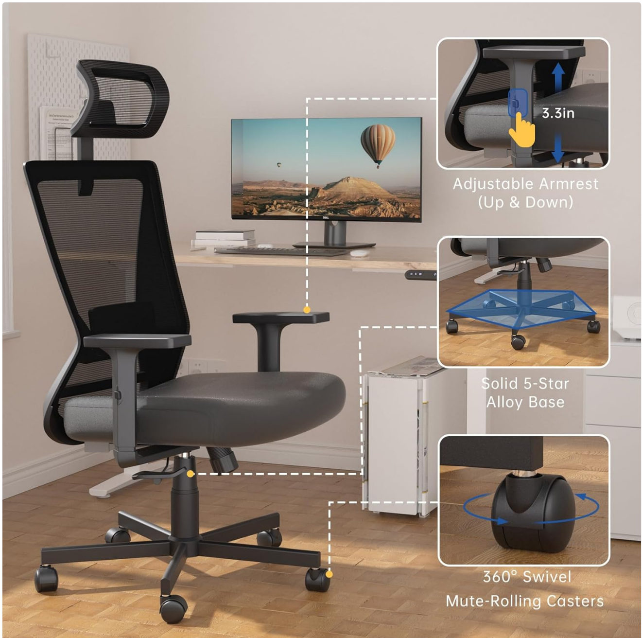
Figure 3.1: The adjustable armrest, showing its vertical movement capability.

The 2D armrests can be adjusted vertically. Press the button located on the side of each armrest and move the armrest up or down to your desired height. Release the button to lock the armrest in position.