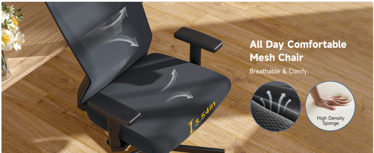
Figure 1.3: Detail of the breathable mesh seat and high-resiliency foam cushion for enhanced comfort.