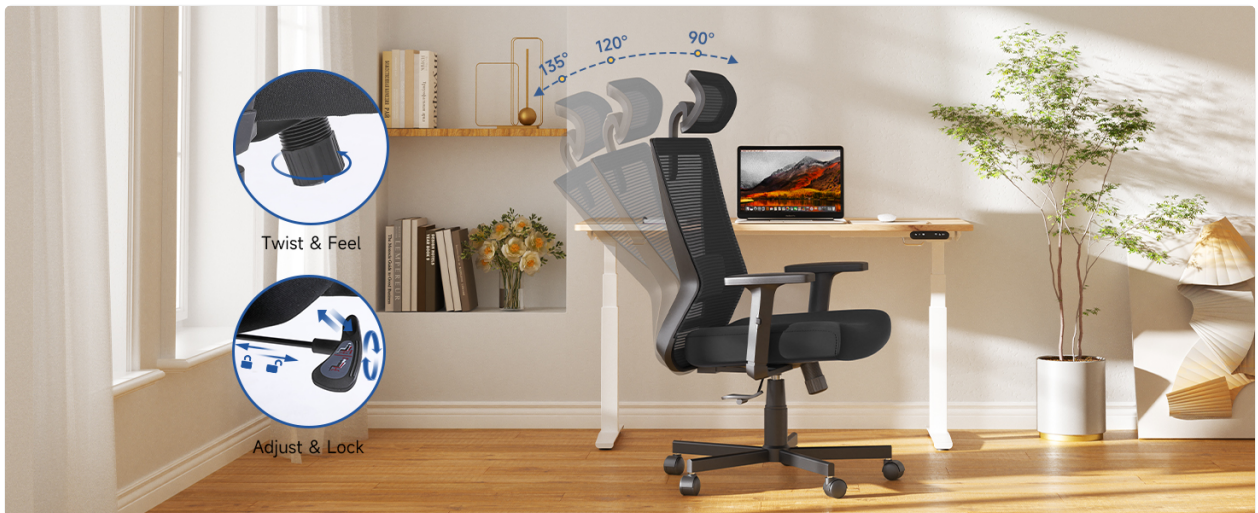
Figure 1.4: Illustration of the chair's tilt and rocking capabilities, including adjustment and lock mechanisms.