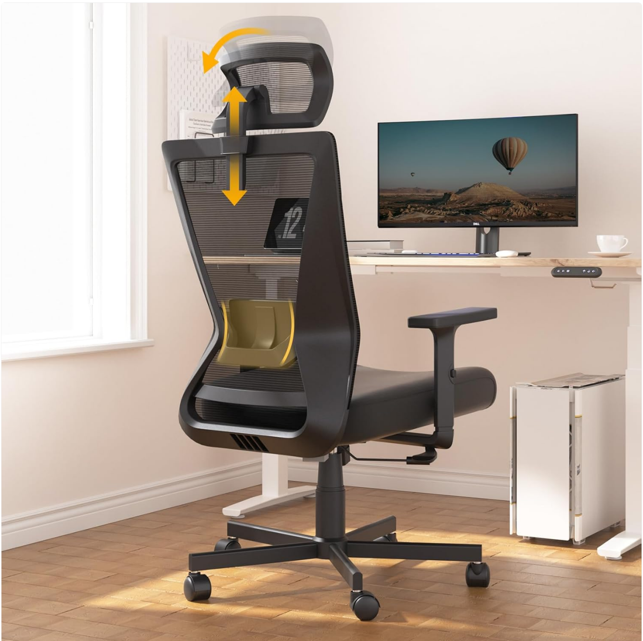
Figure 1.1: The Dripex Ergonomic Office Chair, showcasing its adjustable headrest and lumbar support features.