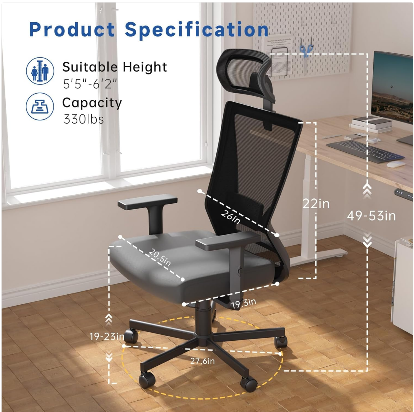
Figure 6.1: Detailed product dimensions and specifications.