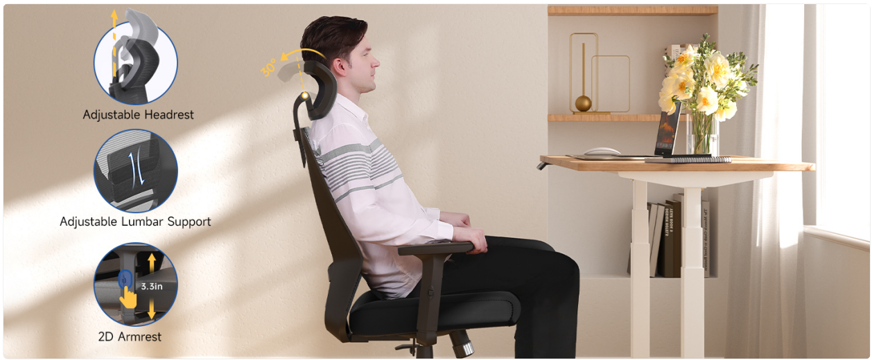
Figure 1.2: Visual representation of the adjustable headrest, lumbar support, and 2D armrest.