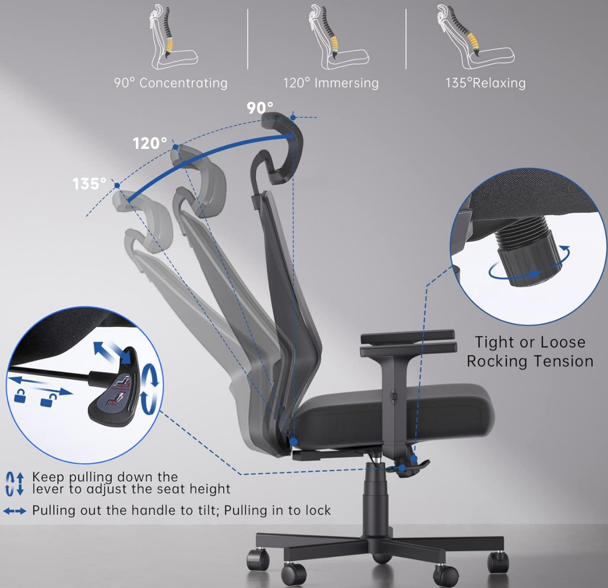
Figure 3.4: Visual guide for operating the tilt and rocking functions, including tension adjustment.