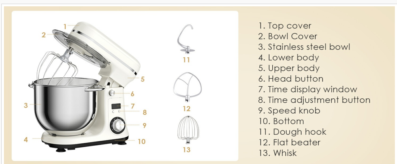
Figure 3: Detailed view of mixer parts and controls.