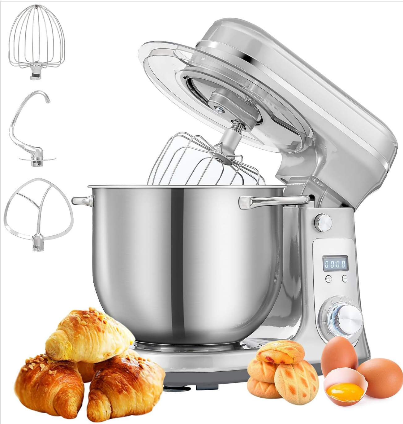
Figure 1: Biolomix Electric Stand Mixer with accessories and food items.