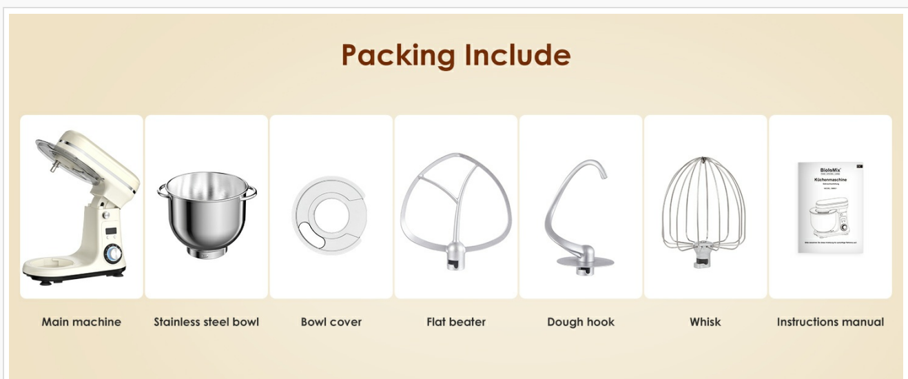
Figure 2: Included components of the Biolomix Stand Mixer.