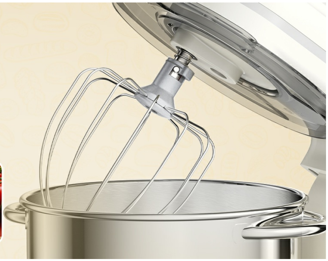
Figure 7: Whisk for whipping.

Your browser does not support the video tag.