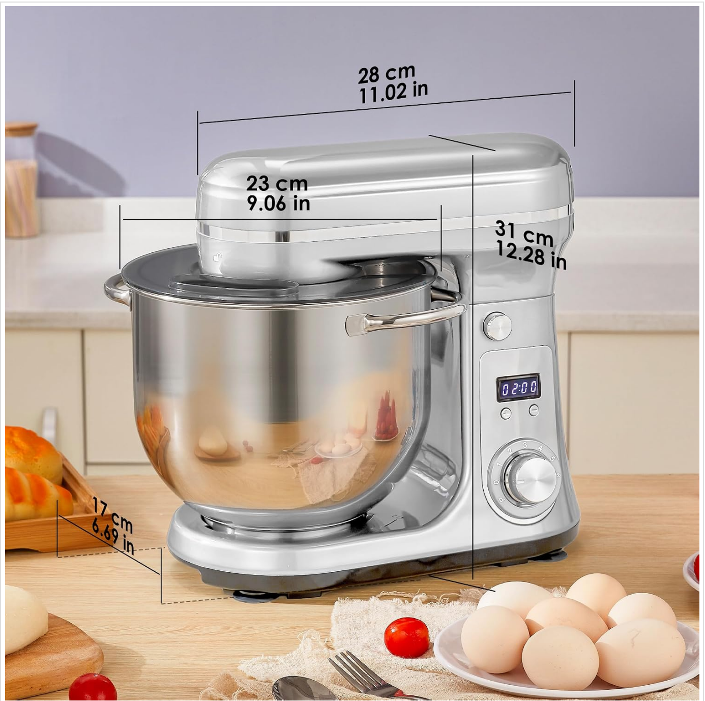
Figure 10: Product dimensions.