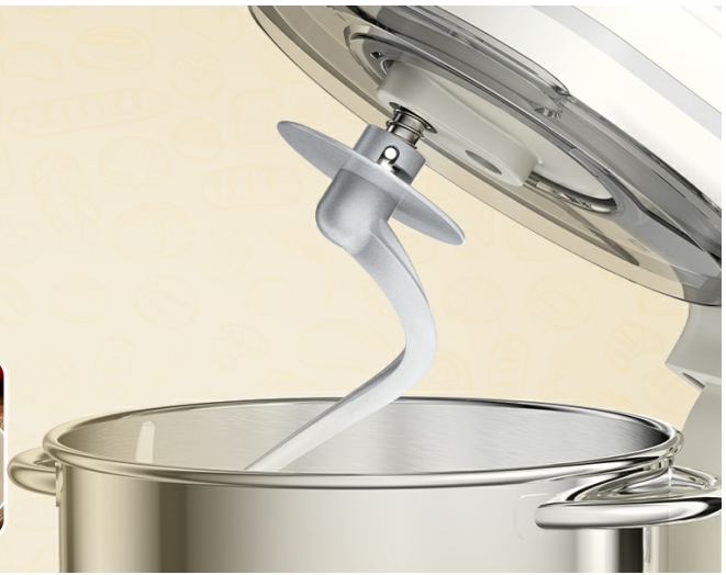
Figure 5: Dough Hook for kneading.

Your browser does not support the video tag.