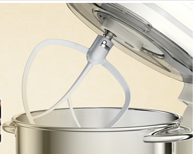
Figure 6: Flat Beater for mixing.