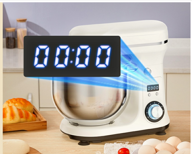
Figure 8: LCD Screen and Timer for precise control.

The intuitive LCD Screen&timer allows for easy control and settings adjustment. you can adjust and observe the status of your food at any time while you are cooking it.