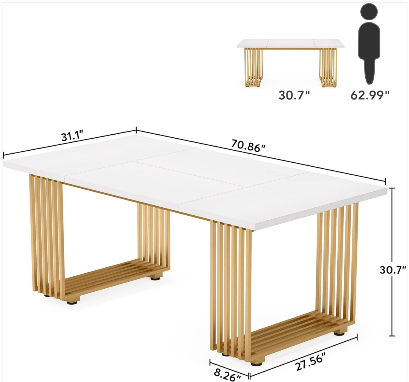
Image: Detailed dimensions of the Tribesigns Modern Dining Table, showing length, width, and height measurements.