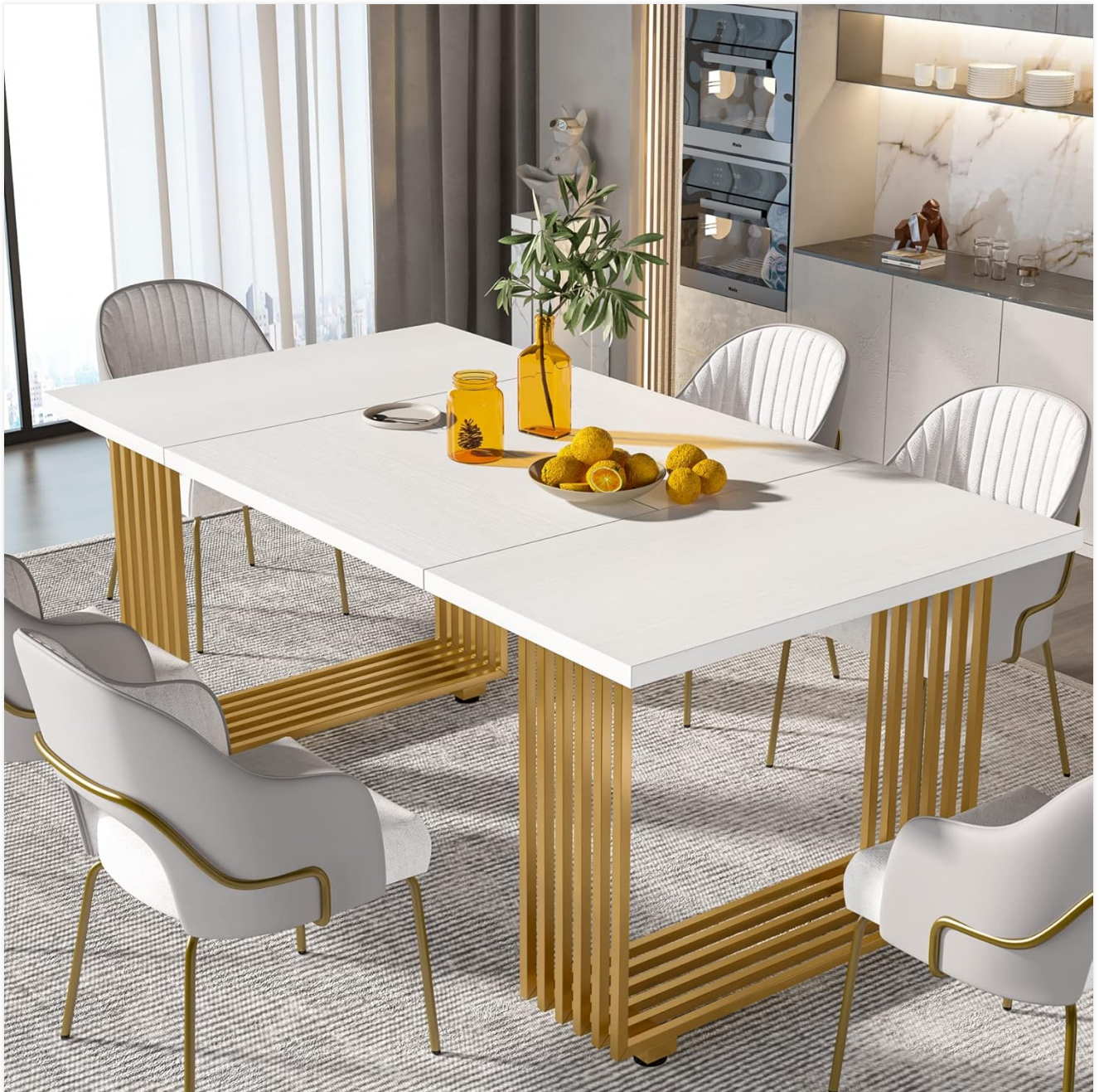
Image: The Tribesigns Modern Dining Table, showcasing its white tabletop and golden metal legs, set in a contemporary dining room.