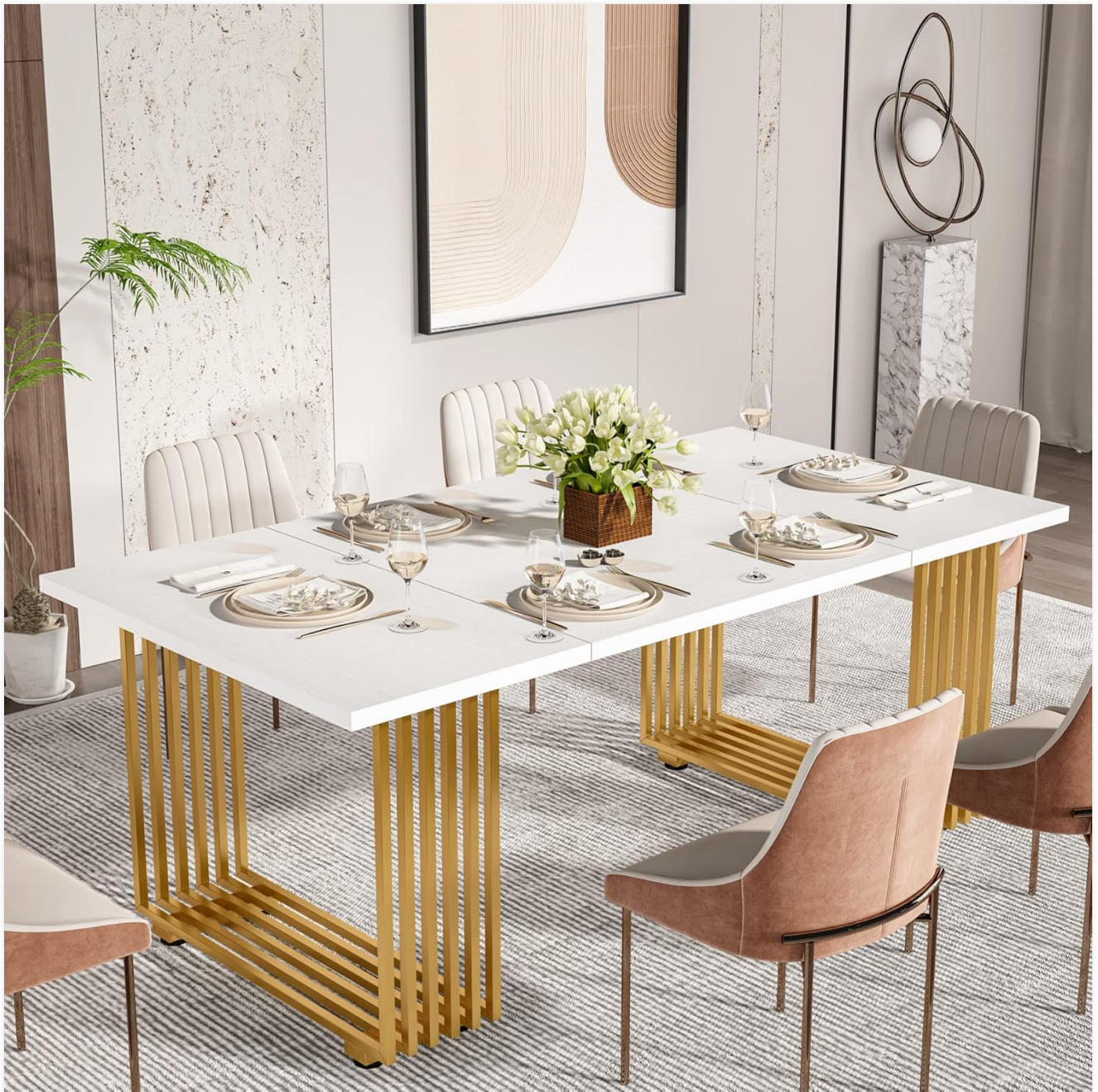
Image: The Tribesigns dining table beautifully set for a meal, demonstrating its capacity and aesthetic appeal.