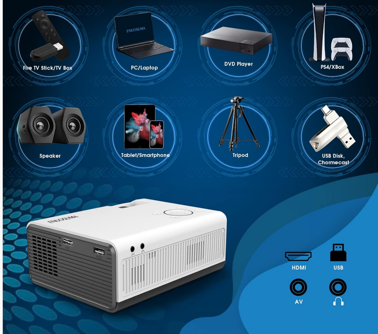
Figure 3.4: Projector Rear and Side Ports

The projector features various input ports including HDMI, USB, and AV, along with a headphone jack for audio output. The top panel includes navigation buttons and power controls. Focus and keystone correction dials are located on the side.