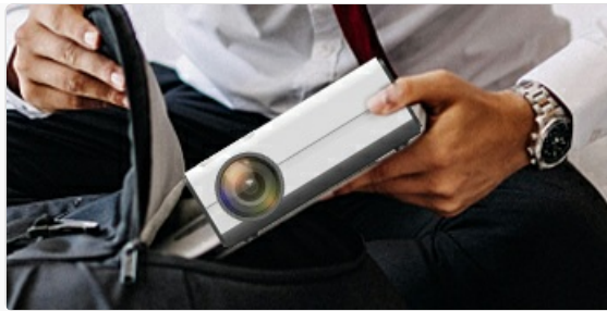
Figure 5.1: Compatible Devices and Connection Types