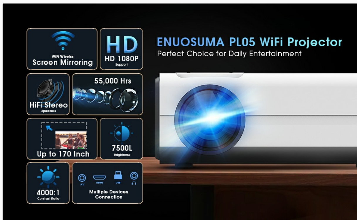
Figure 5.2: Wired vs. Wireless Projection

The projector supports both wired (via USB for iOS) and wireless screen mirroring for smartphones and tablets, as well as Windows Cast and DLNA.