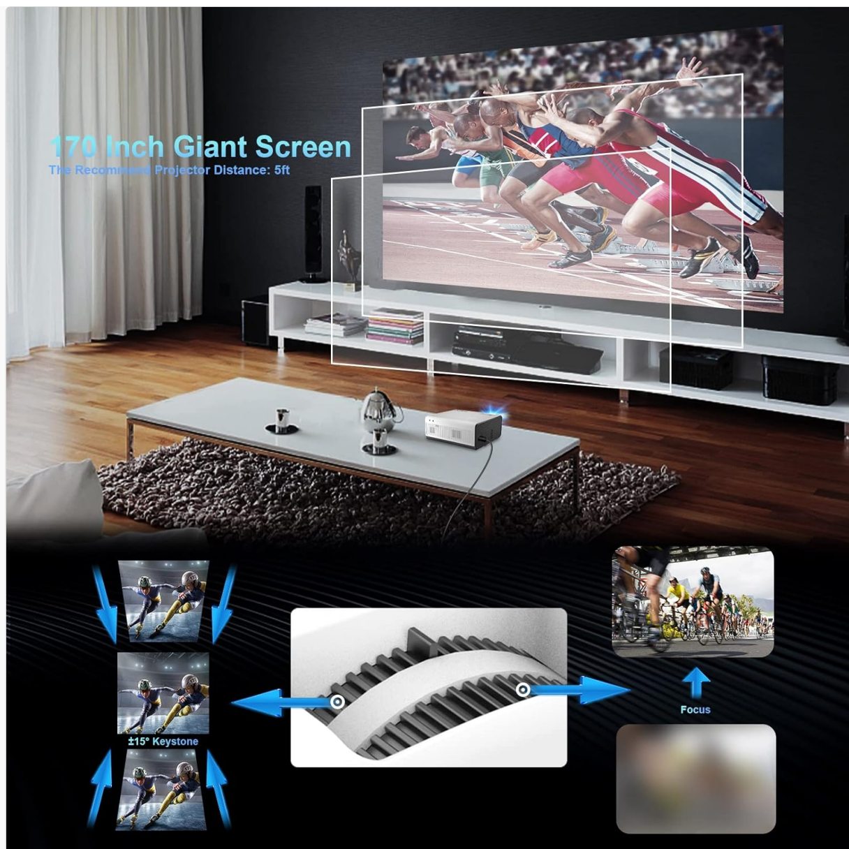
Figure 4.1: Projector Placement and Screen Size