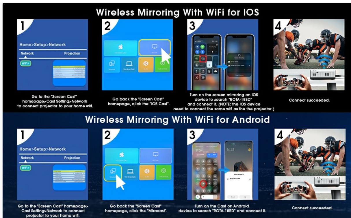
Figure 5.3: Wireless Mirroring Setup for iOS and Android