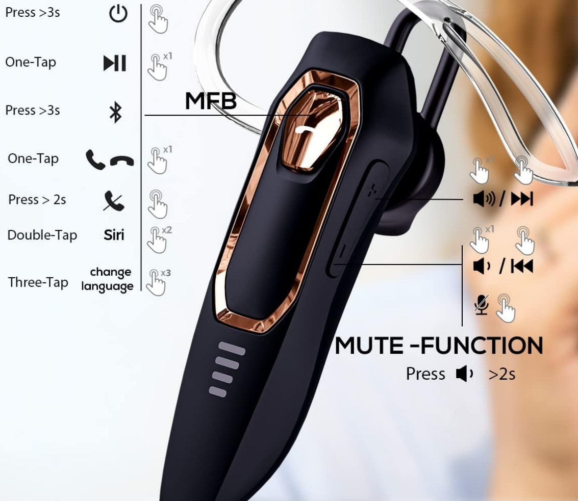
Figure 2: Earpiece controls and functions.