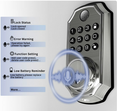
Image: Comparison of voice guidance features, emphasizing clarity and ease of use.