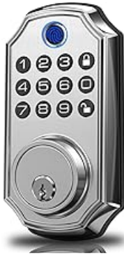
Image: Visual representation of the multiple unlock methods available.