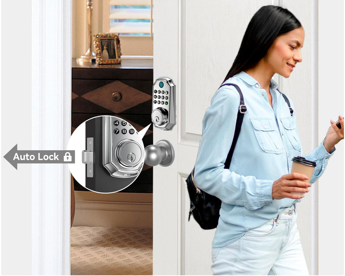
Image: Illustration of the auto-lock feature, securing the door automatically.