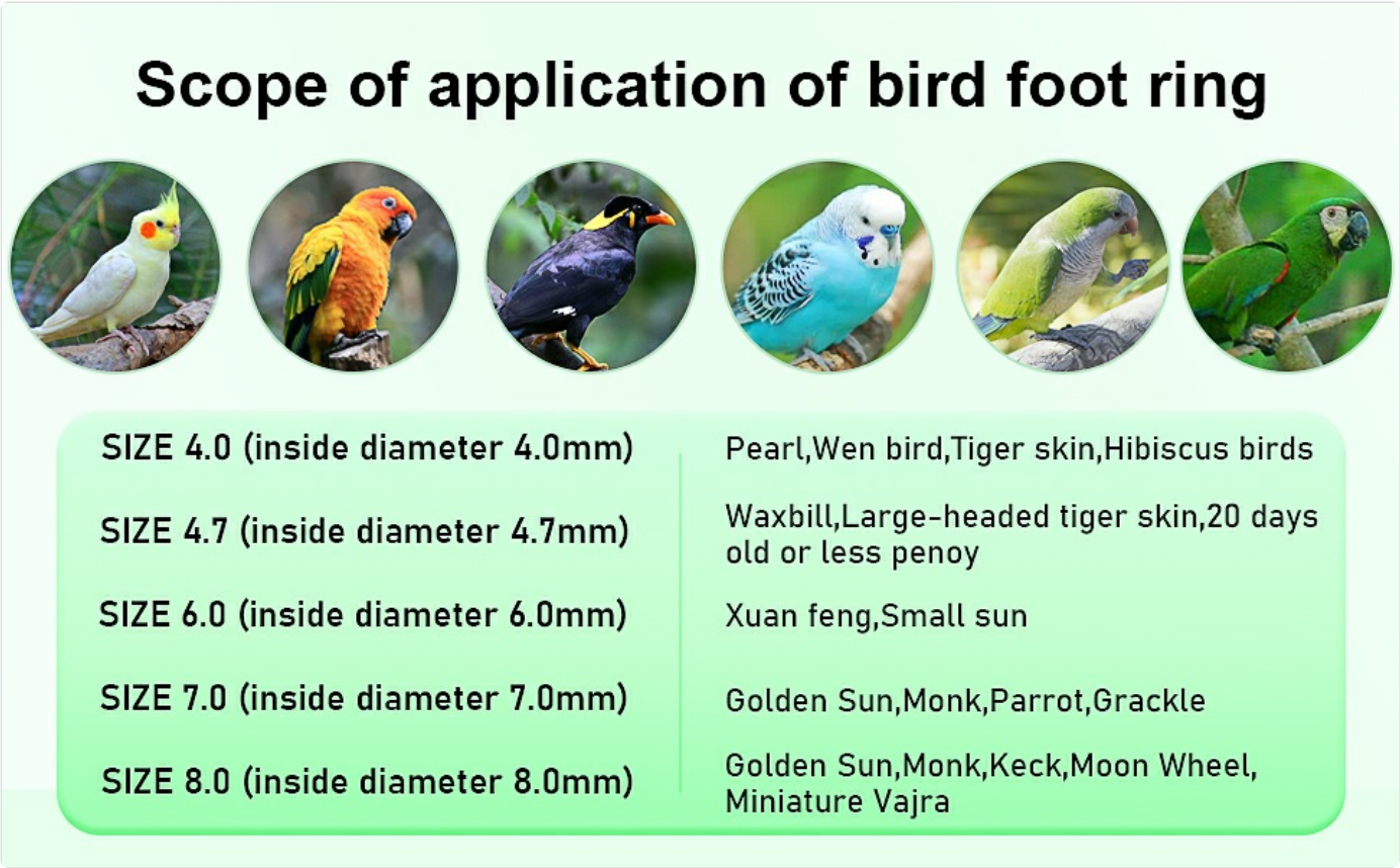
Image: A detailed chart outlining various inner diameters of bird rings and the corresponding bird species they are suitable for, such as Pearl, Waxbill, Golden Sun, and others.

The following table provides guidance on suitable bird species for different ring sizes. Please measure your bird's leg carefully before selecting a ring size.