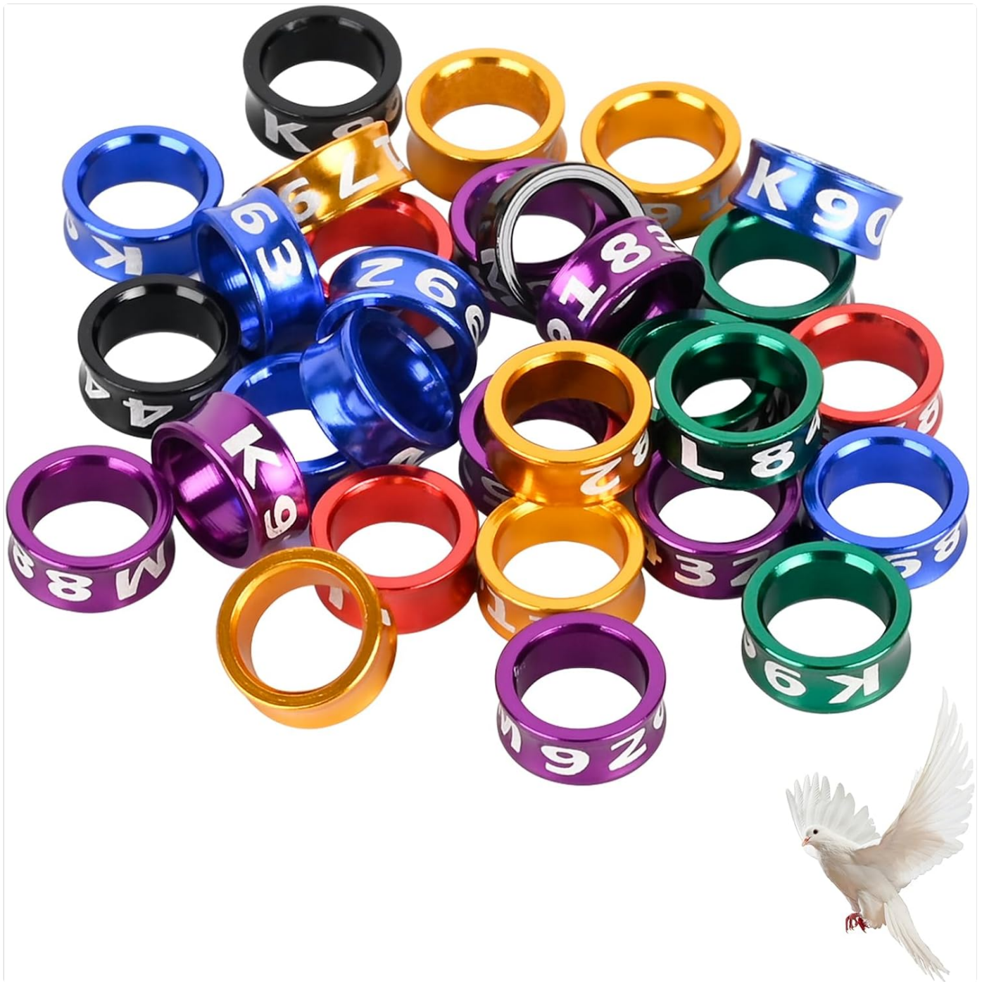
Image: A collection of multicolor aluminum bird leg rings, showing various sizes and engraved markings.