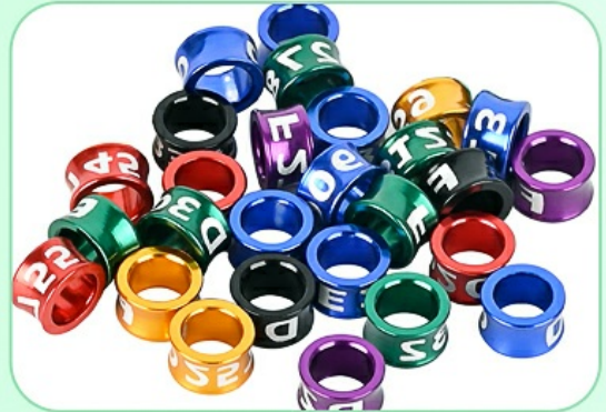
Image: Visual representation of the key features of the bird leg rings, including material quality and identification benefits.