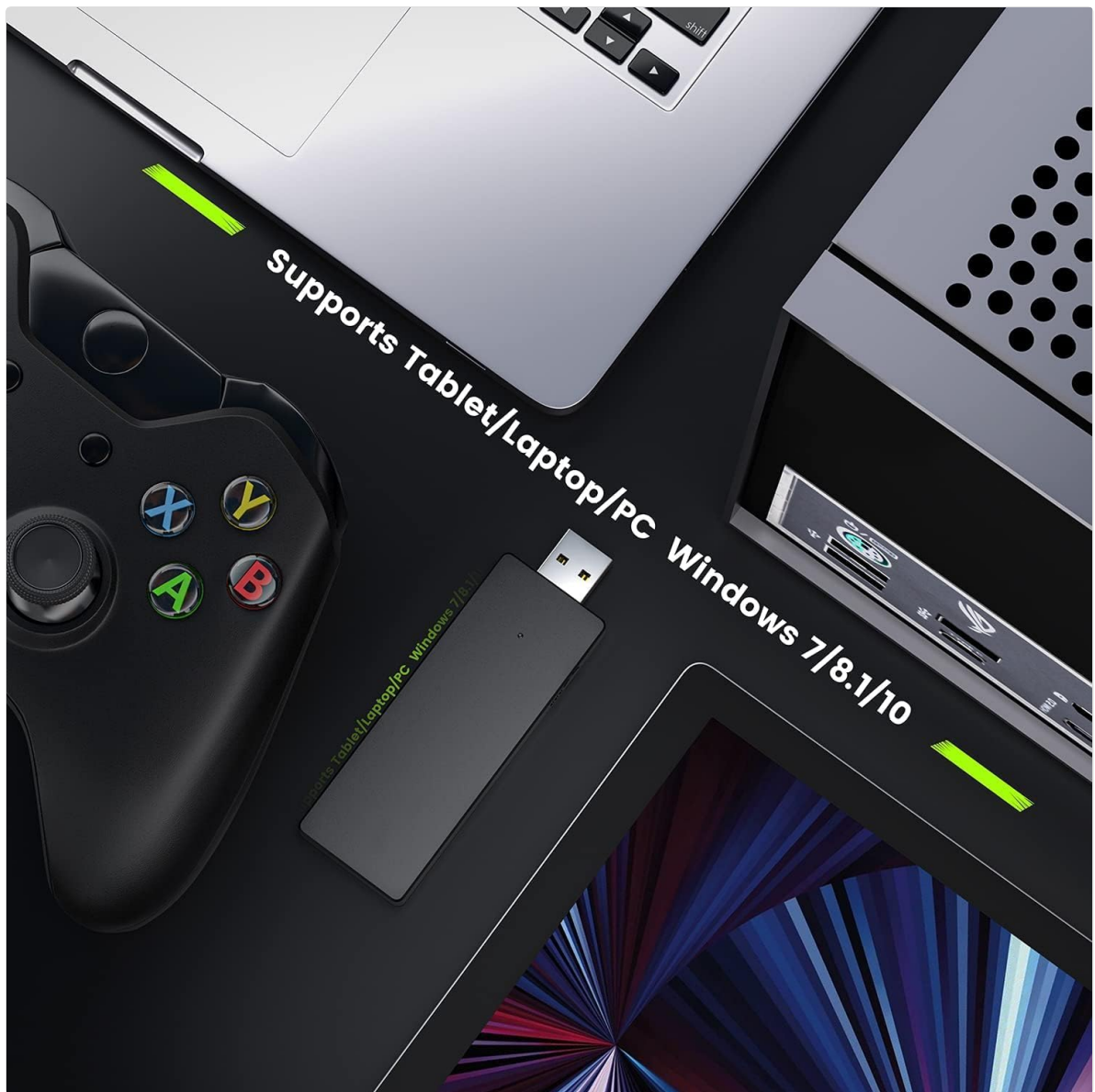
Image 7: The adapter shown connected to a laptop, with text indicating support for Tablet/Laptop/PC running Windows 7, 8.1, or 10.