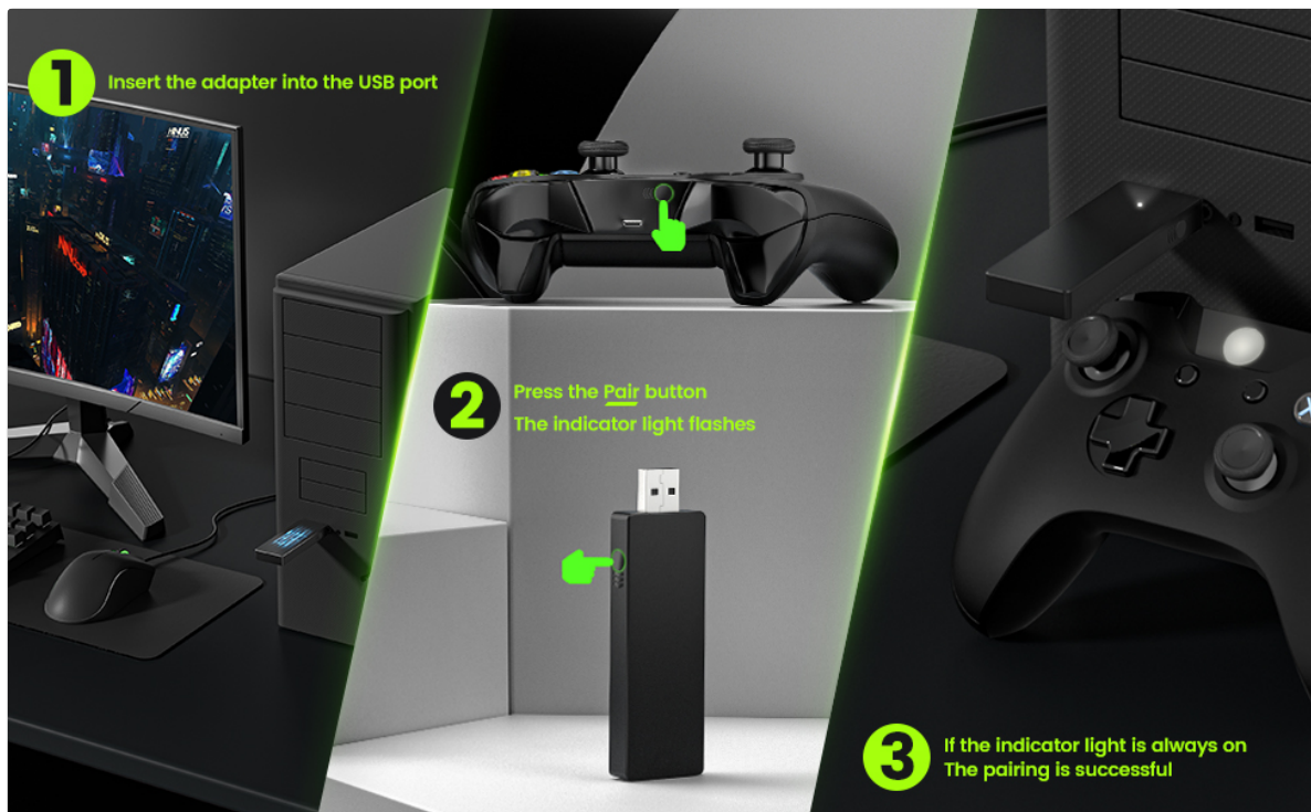
Image 5: Visual guide for the pairing process: 1. Insert adapter into USB port. 2. Press the pair button (indicator light flashes). 3. If the indicator light is always on, pairing is successful.

The adapter is compatible with official Xbox One, Xbox One S, Xbox One X, and Xbox One Elite controllers. It is not compatible with Xbox 360 controllers.