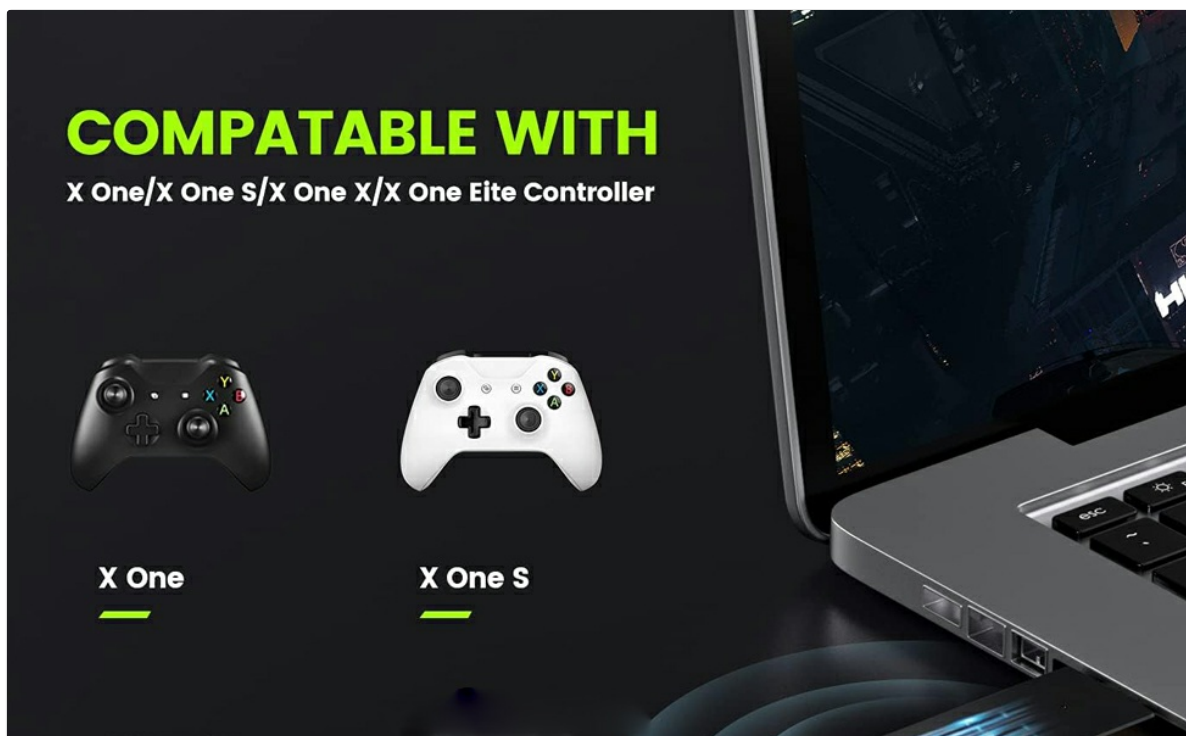
Image 6: An image illustrating compatibility with various Xbox One controller models (Xbox One, Xbox One S, Xbox One X, Xbox One Elite) and explicitly stating non-compatibility with Xbox 360 controllers.

The adapter is compatible with official Xbox One, Xbox One S, Xbox One X, and Xbox One Elite controllers. It is not compatible with Xbox 360 controllers.