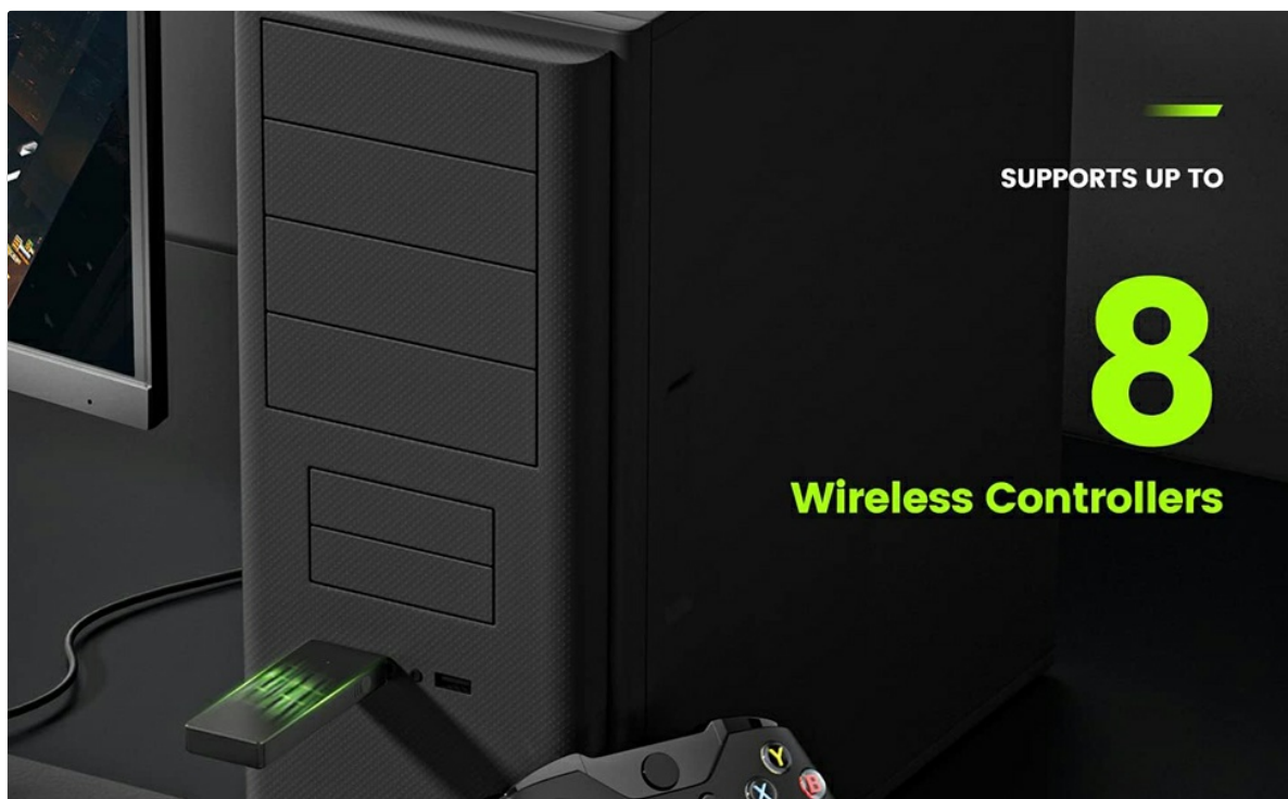
Image 3: An illustration showing the adapter connected to a desktop PC, indicating support for up to 8 wireless controllers.