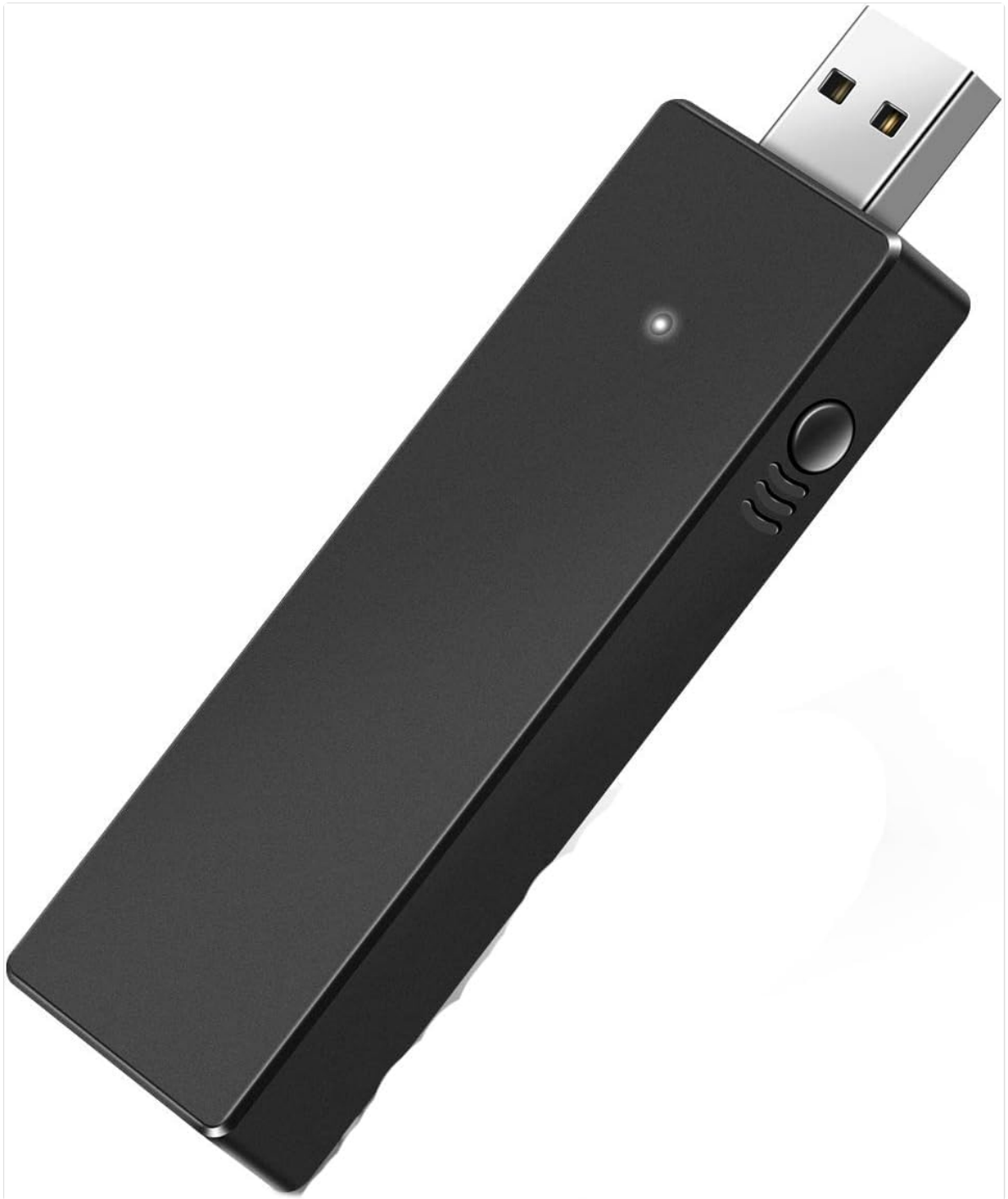
Image 1: The Cuifati Wireless Controller Adapter, a black USB dongle with a small indicator light and a pairing button on the side.