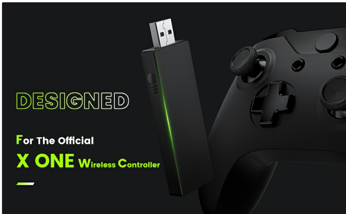
Image 2: The Cuifati Wireless Adapter shown next to an Xbox One controller, highlighting its design for official Xbox One wireless controllers.