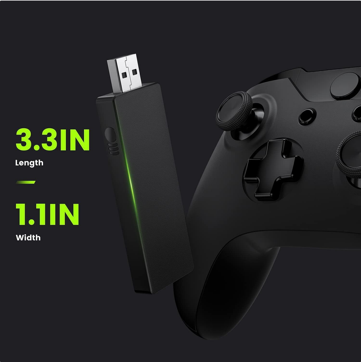
Image 8: The adapter shown next to an Xbox controller, with labels indicating its length as 3.3 inches and width as 1.1 inches.