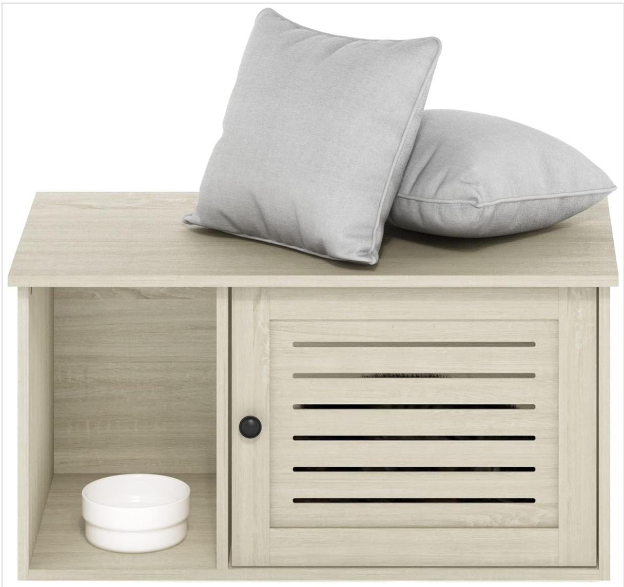
Image: A front view of the assembled unit, highlighting the open compartment for a food bowl and the slatted door of the main enclosure. This shows the exterior design and functionality.

Tools required for assembly are typically a screwdriver (not included) and the provided hardware. Ensure all cam locks are tightened and all screws are fully inserted for structural integrity.