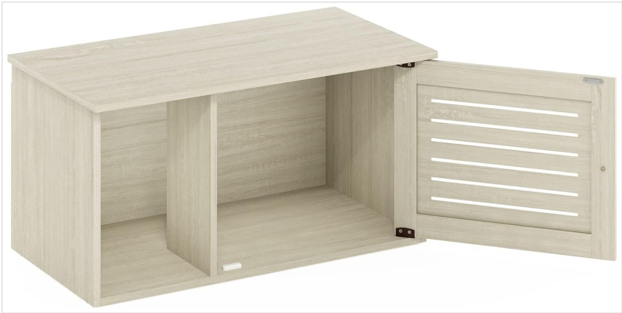
Image: An interior view of the unit with the slatted door open, clearly showing the internal divider that creates two distinct compartments.