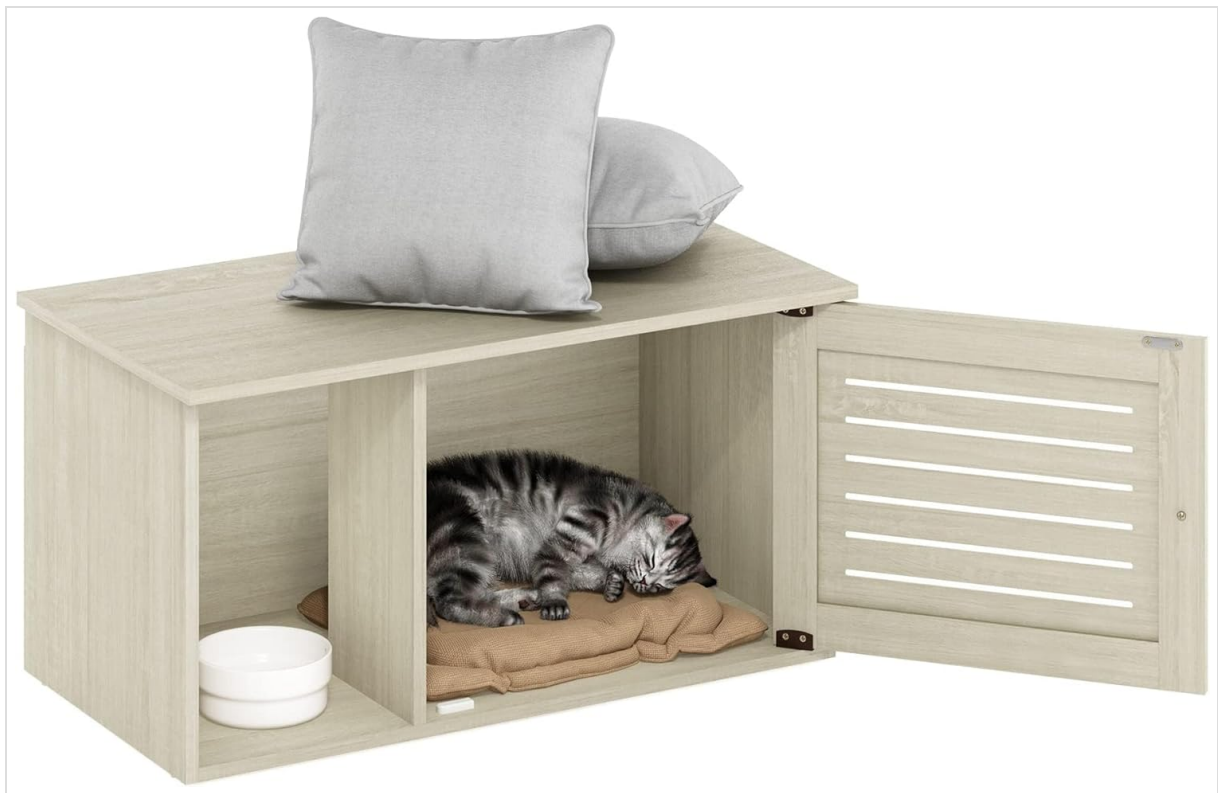
Image: An interior view of the assembled unit, showing a cat resting in the main compartment and a food bowl in the smaller, open section. This illustrates the internal divider and potential uses.