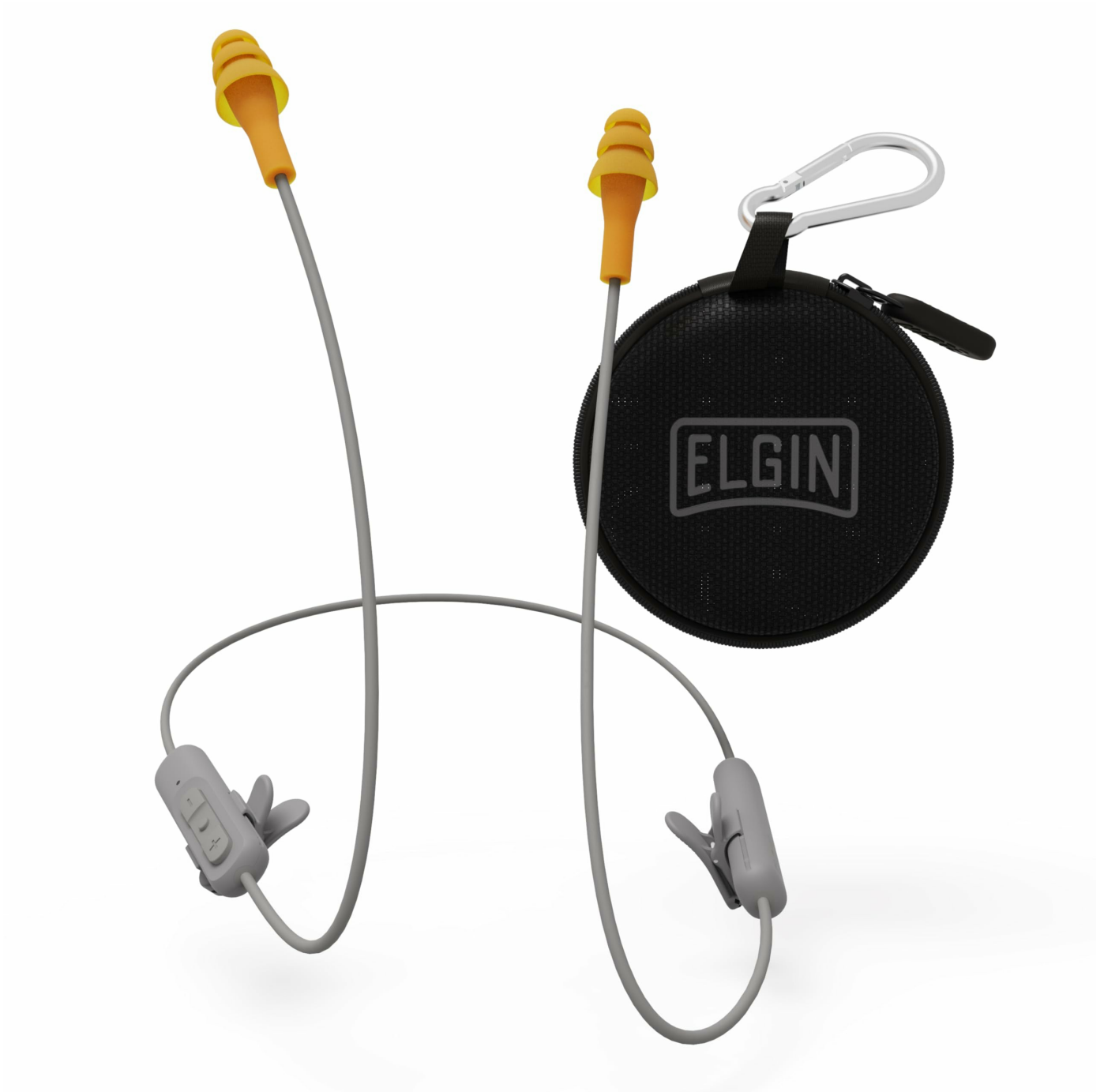
A close-up view of the Elgin Ruckus Wireless Bluetooth Earplug Headphones, highlighting the orange earplugs and the gray control module.

The Elgin Ruckus Wireless Earplug Headphones combine robust construction with advanced audio technology. They feature medical-grade silicone ear tips for comfort and effective noise isolation, a durable Kevlar-reinforced cable, and a compact control module.