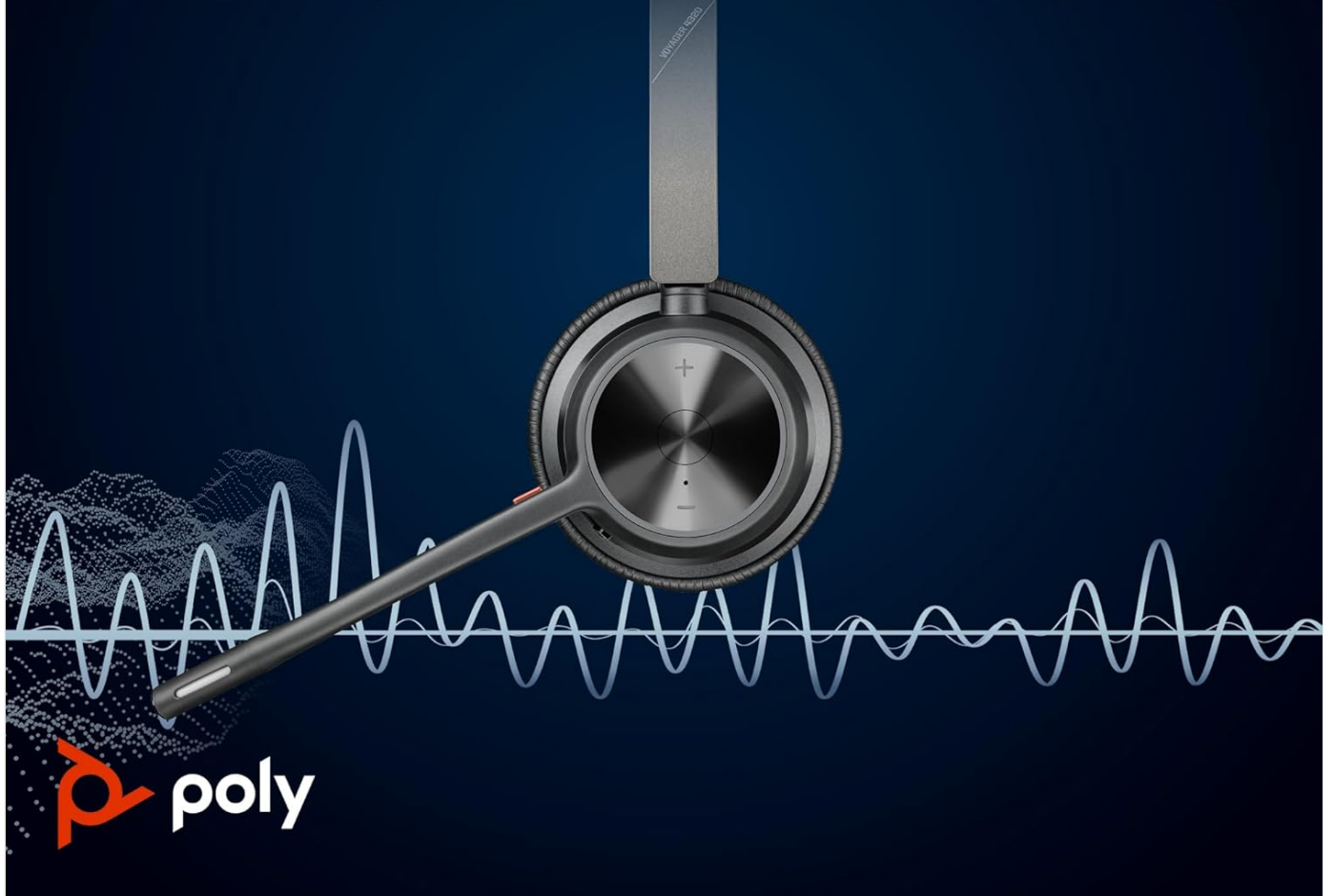
Image: Visual representation of the noise-canceling dual mic with Acoustic Fence technology, designed to eliminate background noise.

Callers hear you, not your surroundings, thanks to a noise-canceling dual mic with Acoustic Fence technology.