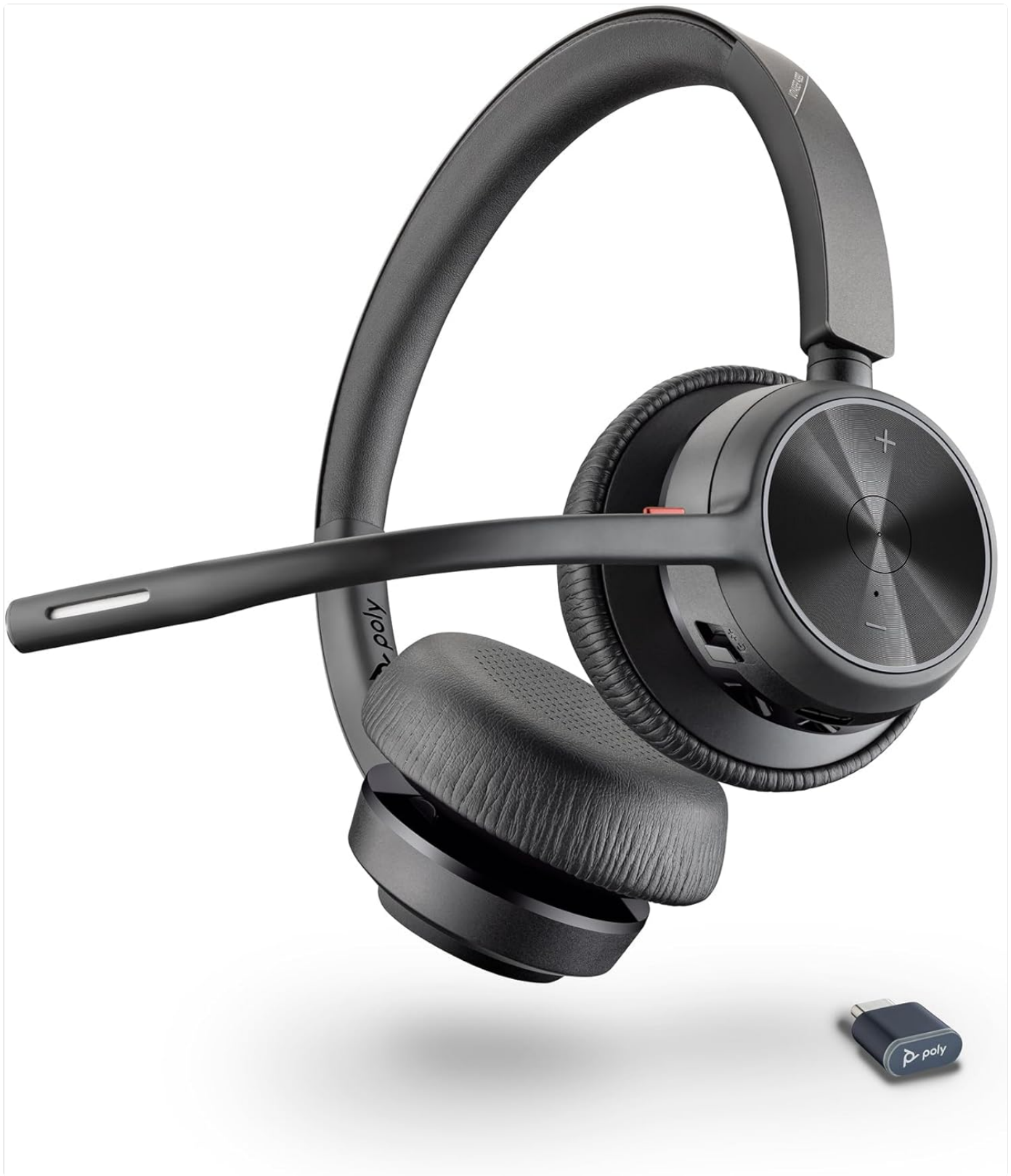
Image: The Poly Voyager 4320 UC Wireless Headset shown with its included USB adapter.