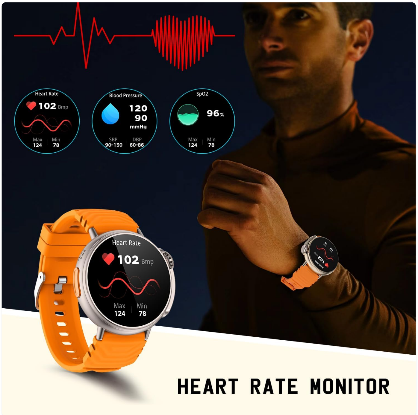
Figure 2: The AMZSA GT88 Smartwatch displaying real-time health metrics including heart rate, blood pressure, and SpO2 levels, providing a quick overview of your vital signs.