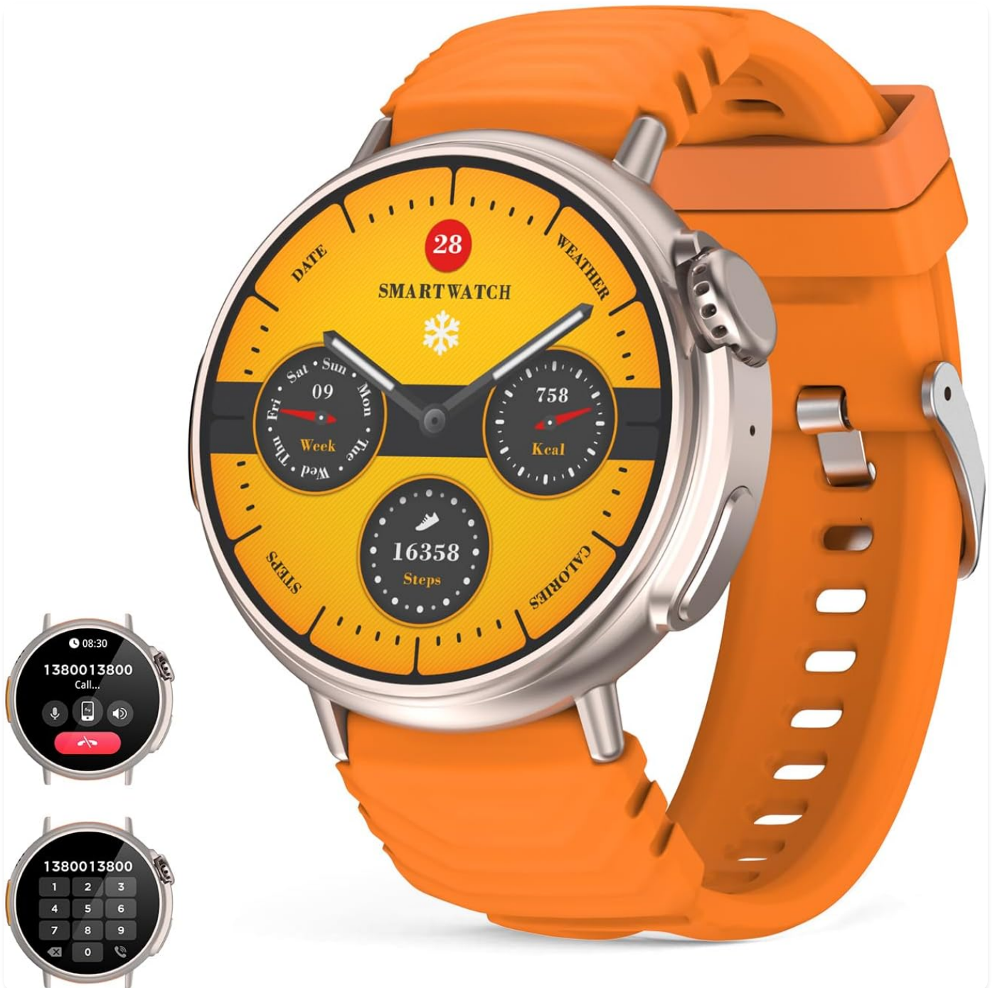
Figure 1: The AMZSA GT88 Smartwatch, featuring a vibrant orange band and a clear yellow watch face that displays essential information such as time, date, weather, steps, and calories burned.