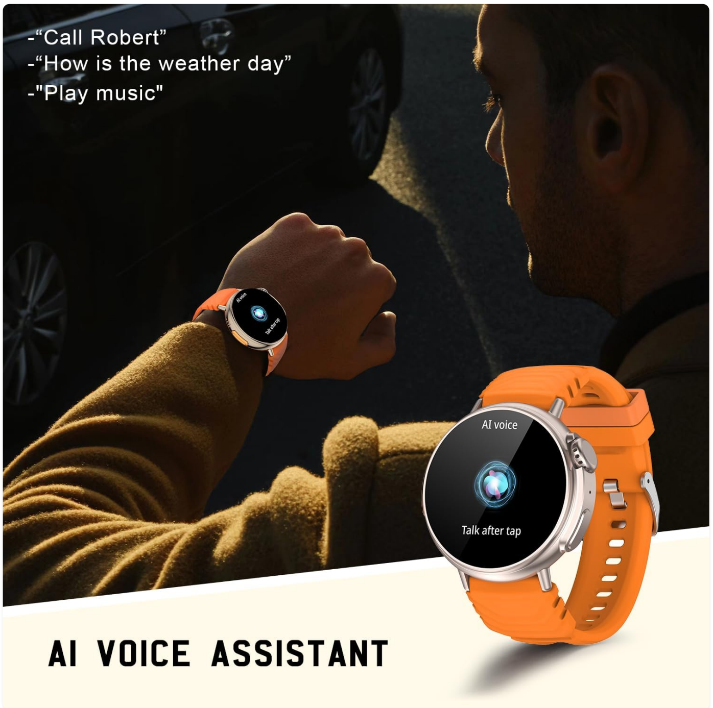
Figure 8: The AMZSA GT88 Smartwatch displaying the AI Voice Assistant interface, ready to receive voice commands for various functions.