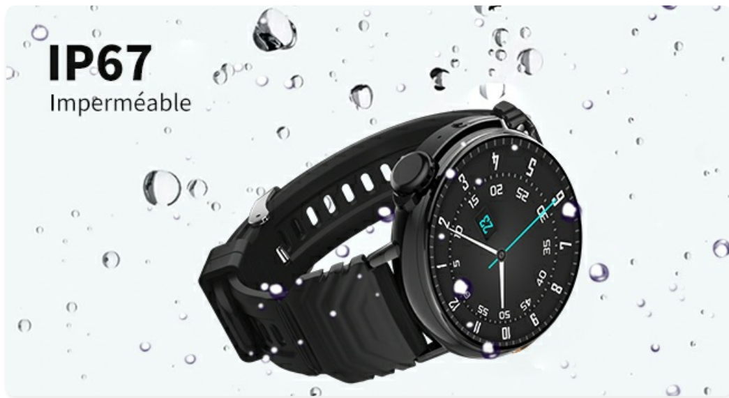
Figure 11: The AMZSA GT88 Smartwatch shown with water droplets, emphasizing its IP67 waterproof rating, making it suitable for various daily activities.