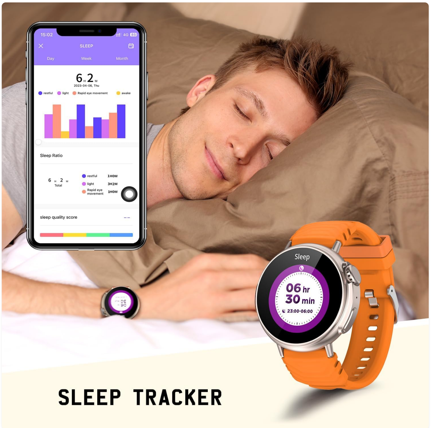
Figure 3: A user sleeping while wearing the AMZSA GT88 Smartwatch, with a smartphone screen showing detailed sleep analysis, including sleep duration and quality metrics.