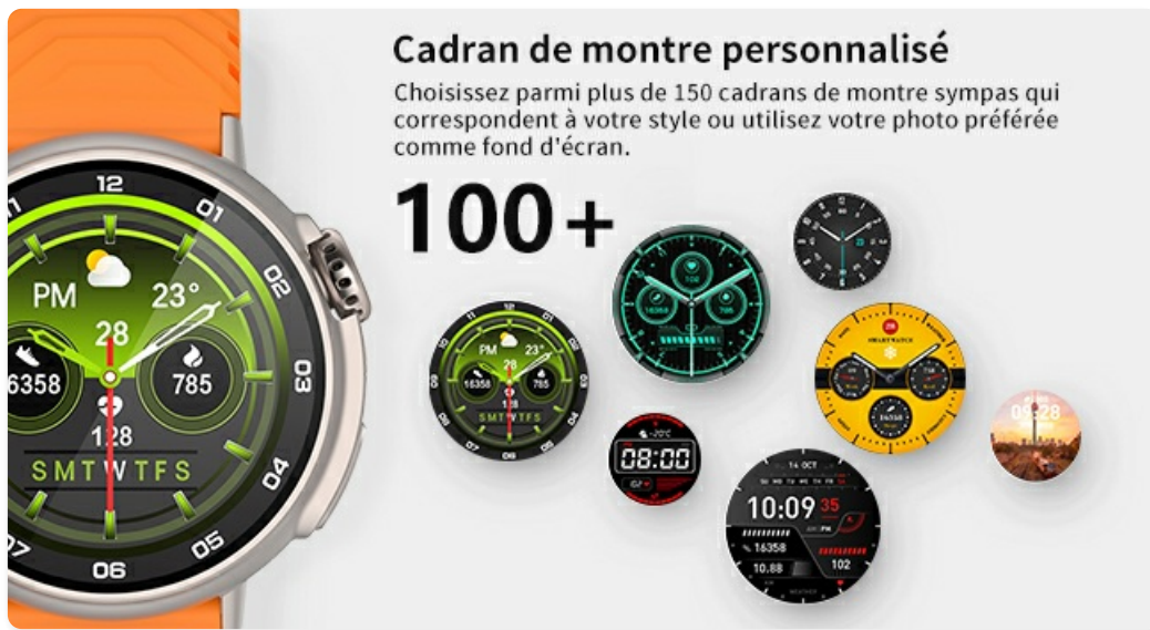
Figure 7: A selection of diverse watch faces surrounding the AMZSA GT88 Smartwatch, illustrating the extensive customization options available to users.