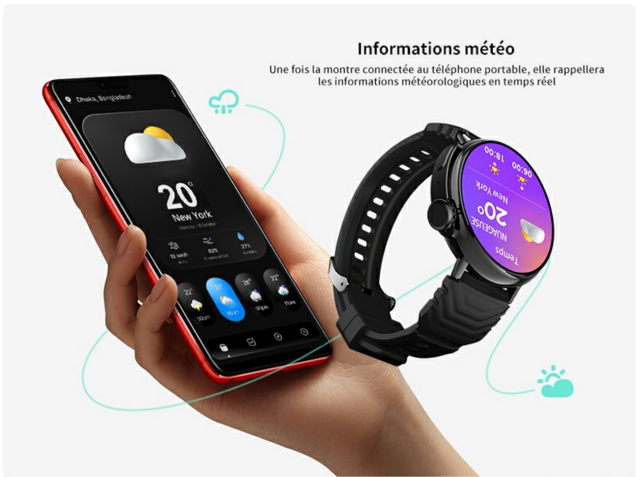
Figure 10: The AMZSA GT88 Smartwatch showing current weather conditions, synchronized with a smartphone displaying a more detailed weather forecast.