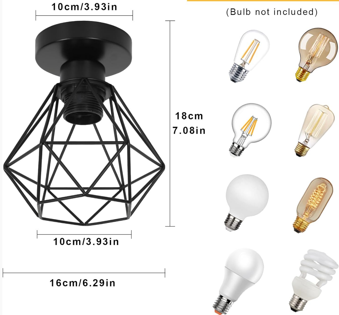
Figure 3: Dimensions and Compatible E27 Bulbs. This image displays the physical dimensions of the light fixture and examples of E27 base bulbs that can be used.