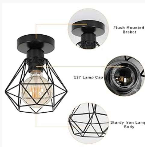
Figure 1: Components and Installation Diagram. This image illustrates the main parts of the light fixture and how they connect during installation.