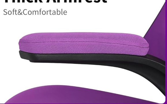
Figure 4: Flip-up armrests for space-saving and versatility.