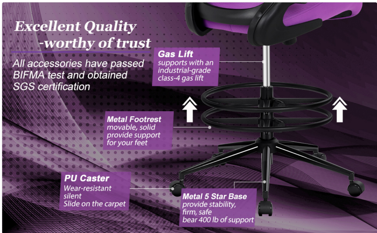
Figure 2: Illustration of the chair's robust components, including the industrial-grade gas lift, metal footrest, PU casters, and 5-star metal base.