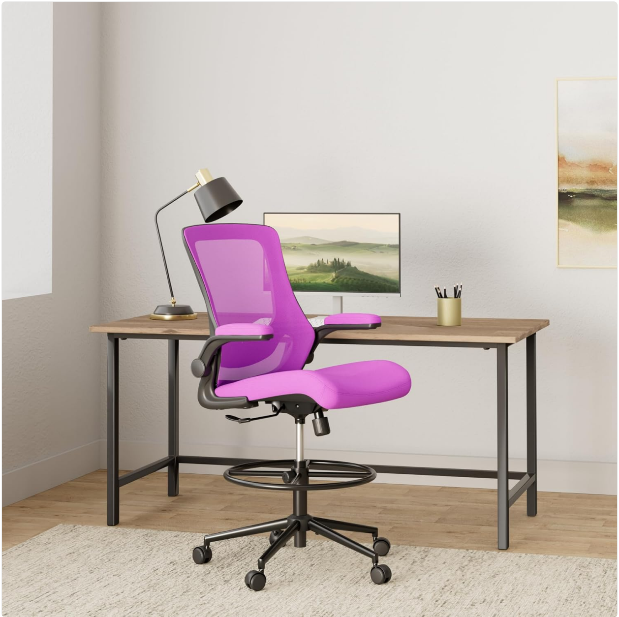
Figure 1: Misolant Tall Drafting Office Chair in an office environment.