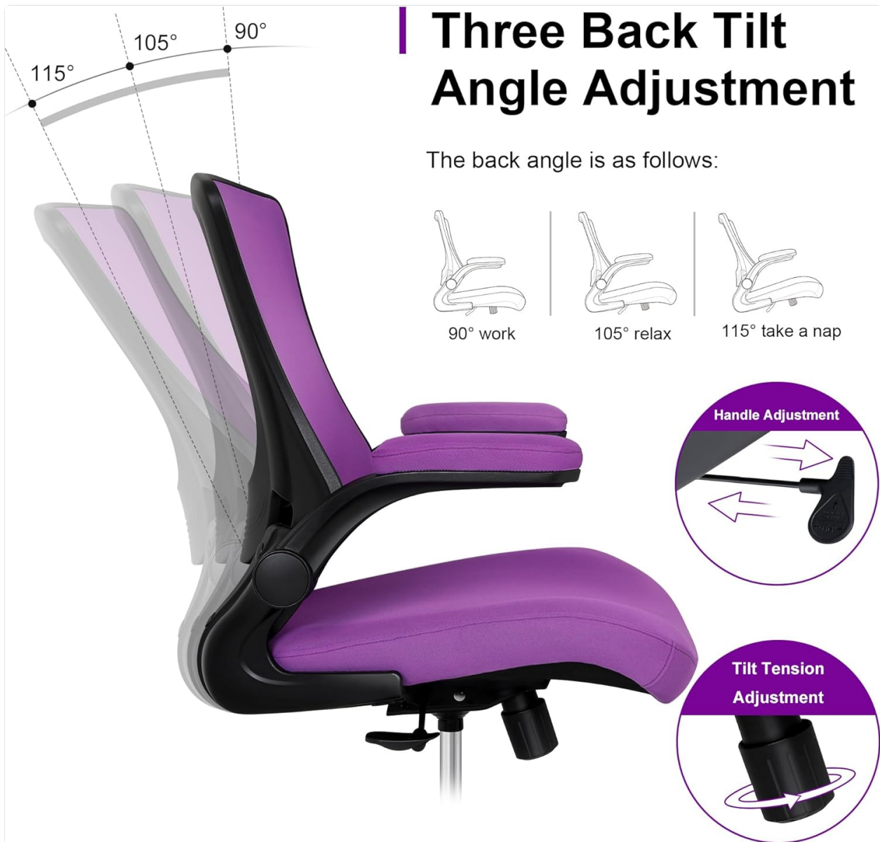
Figure 5: Back tilt angle and tension adjustment controls.