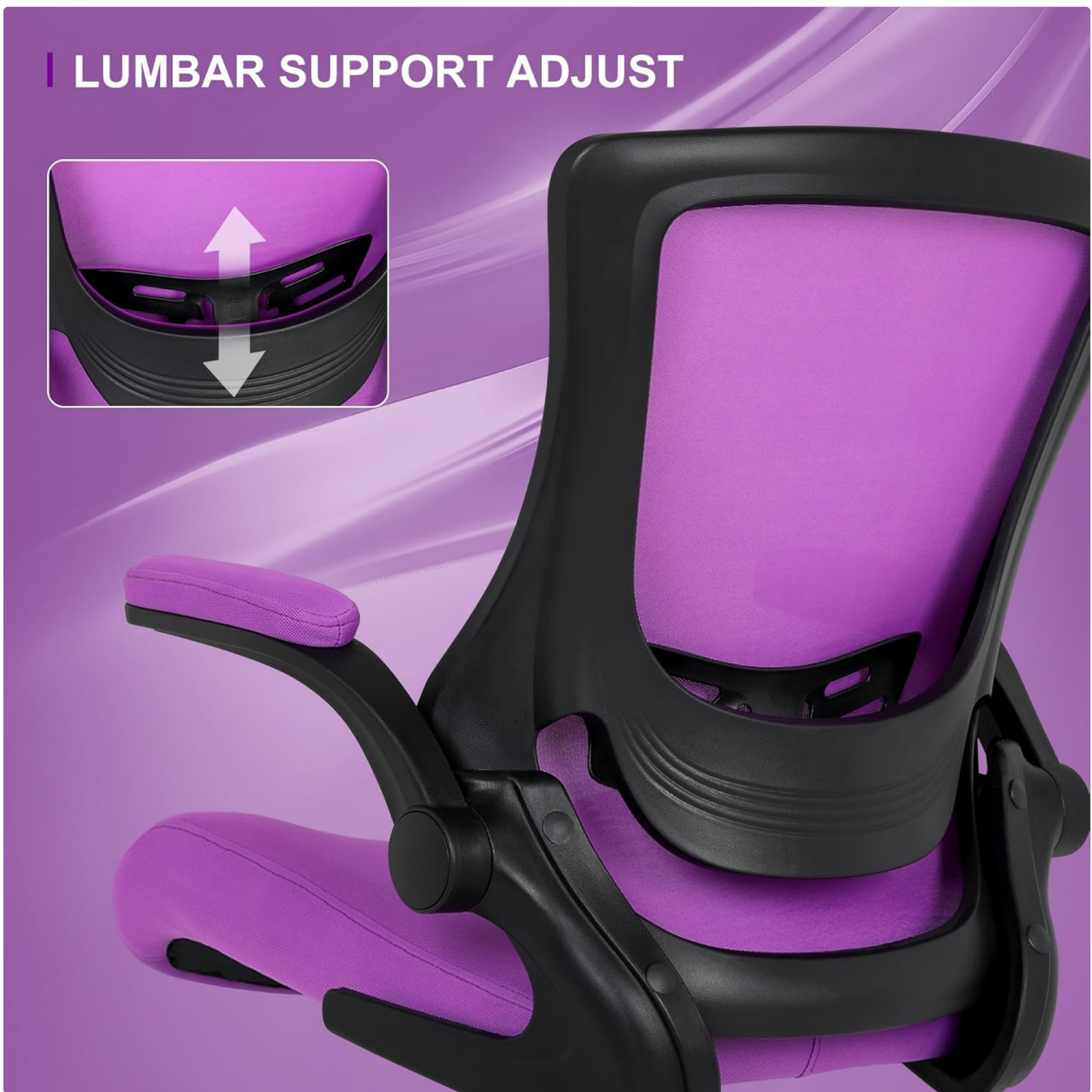
Figure 3: Adjustable lumbar support for personalized back comfort.